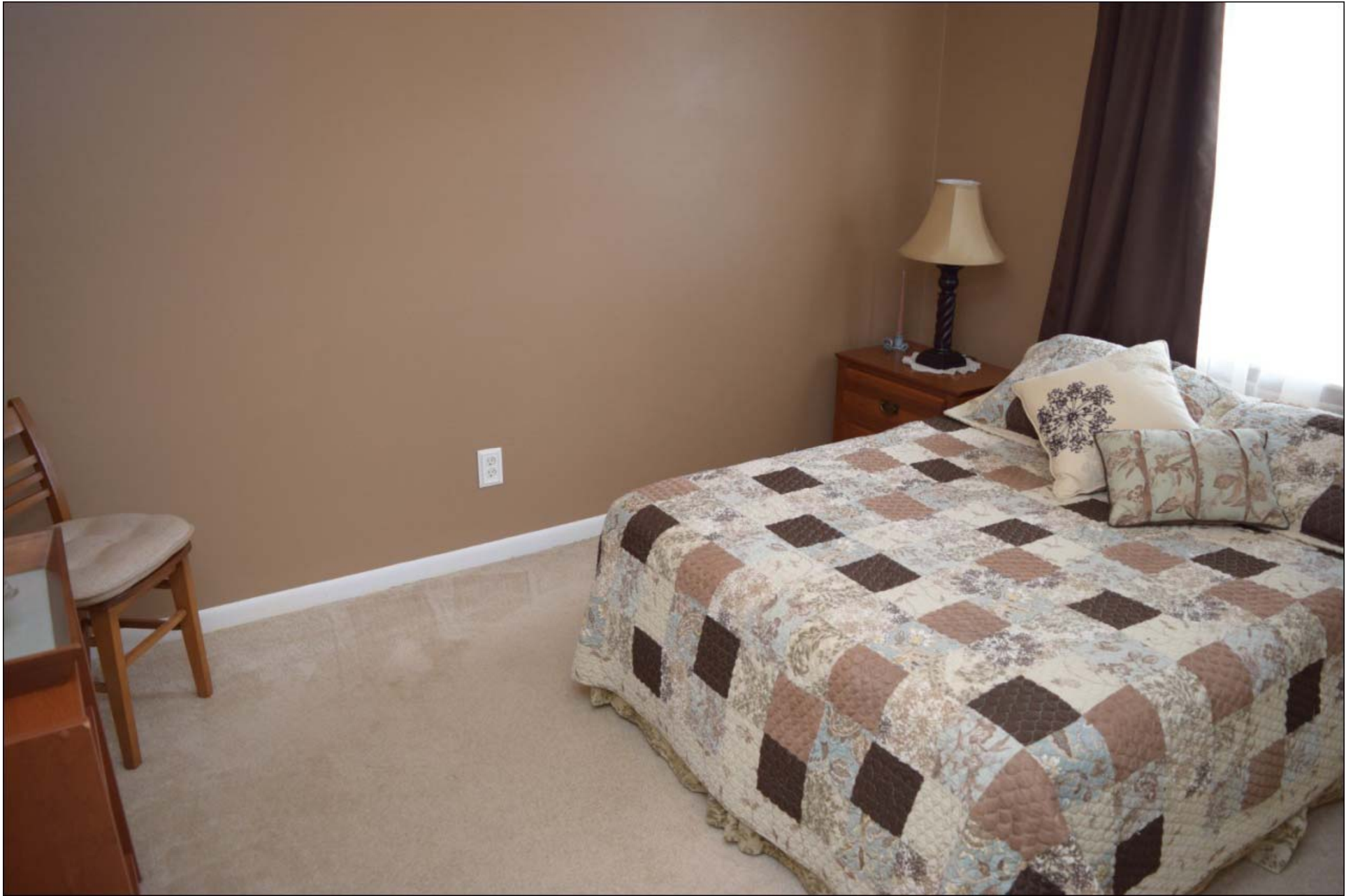
Bedroom 2 – 11 x 9