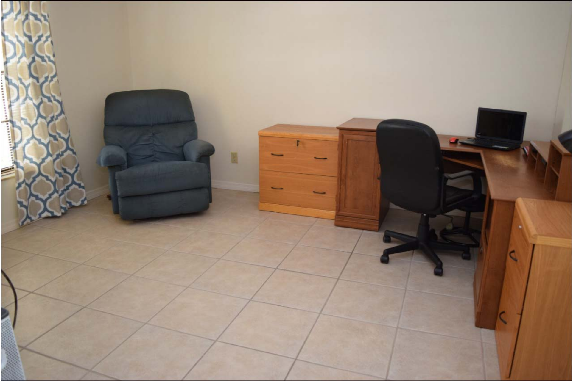
Office/Den/Bonus Room with front view 11 x 11