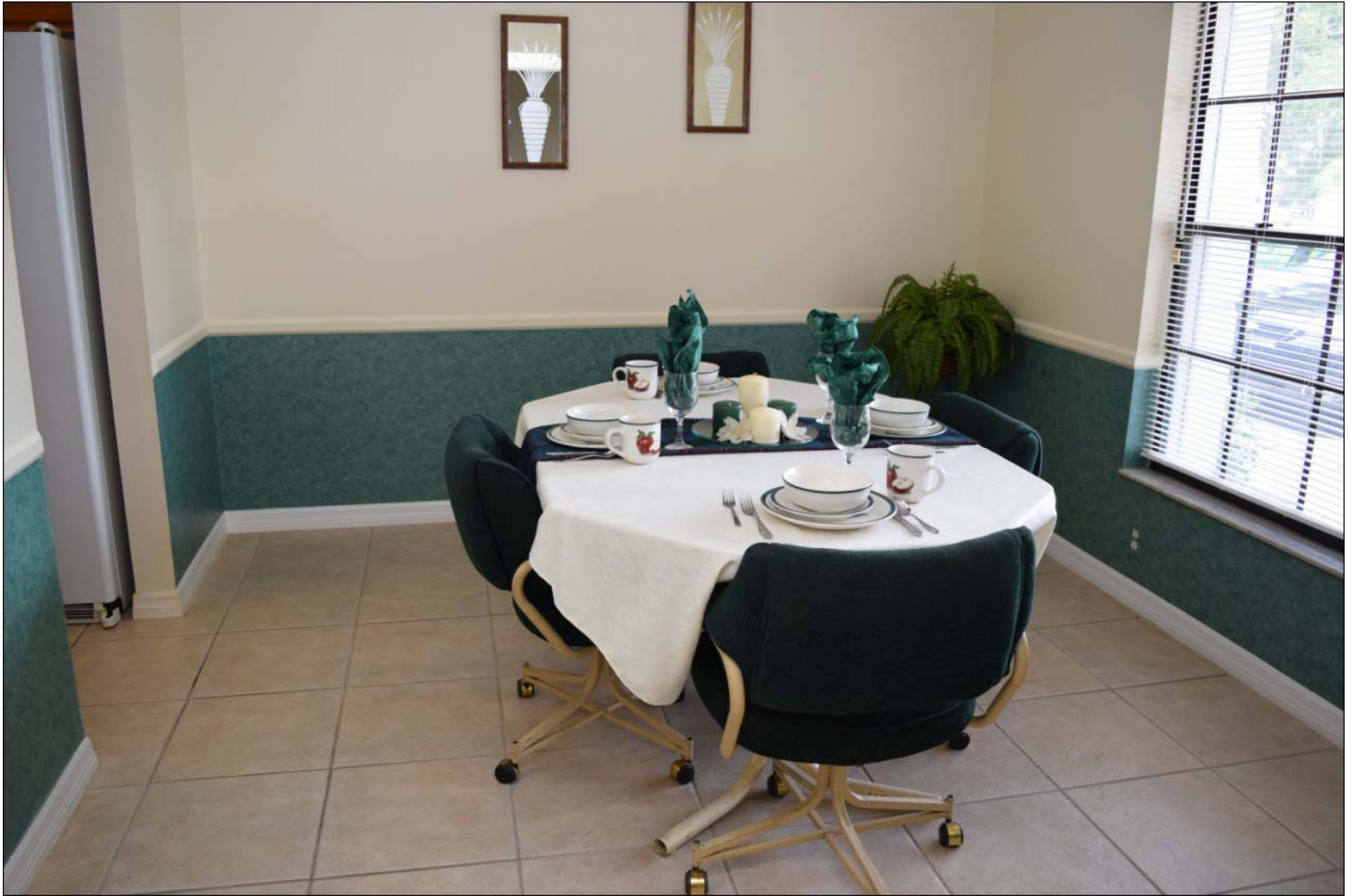
Formal Dining Room with front view 11 x 10