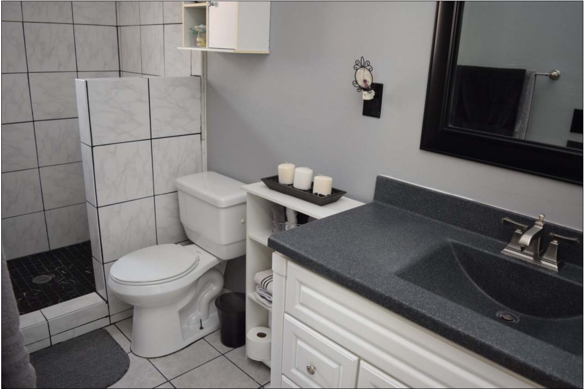
Master Bathroom with walk-in shower