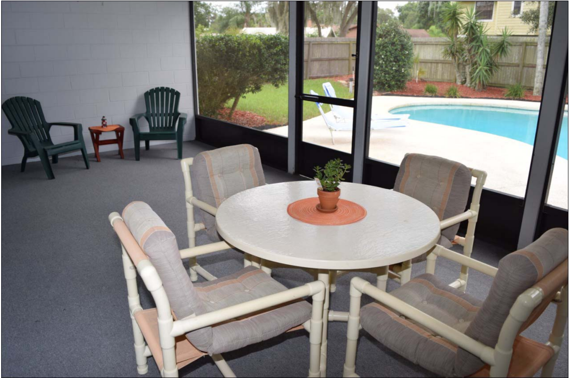
Large Back Patio with Pool View 36 x 18