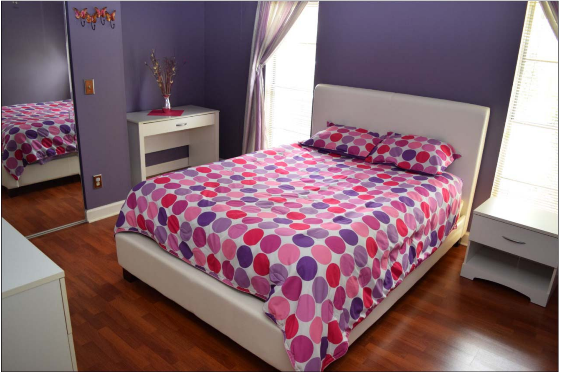
Bedroom 4 with back pool view 12 x 12