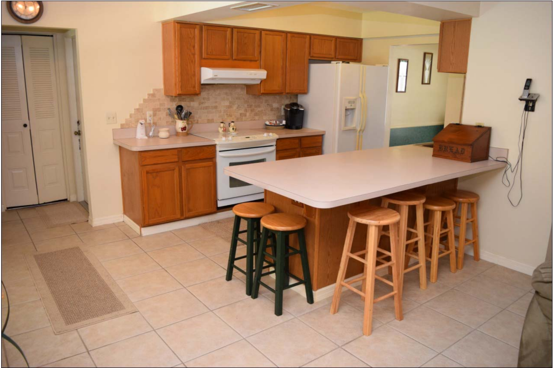
Kitchen with breakfast bar