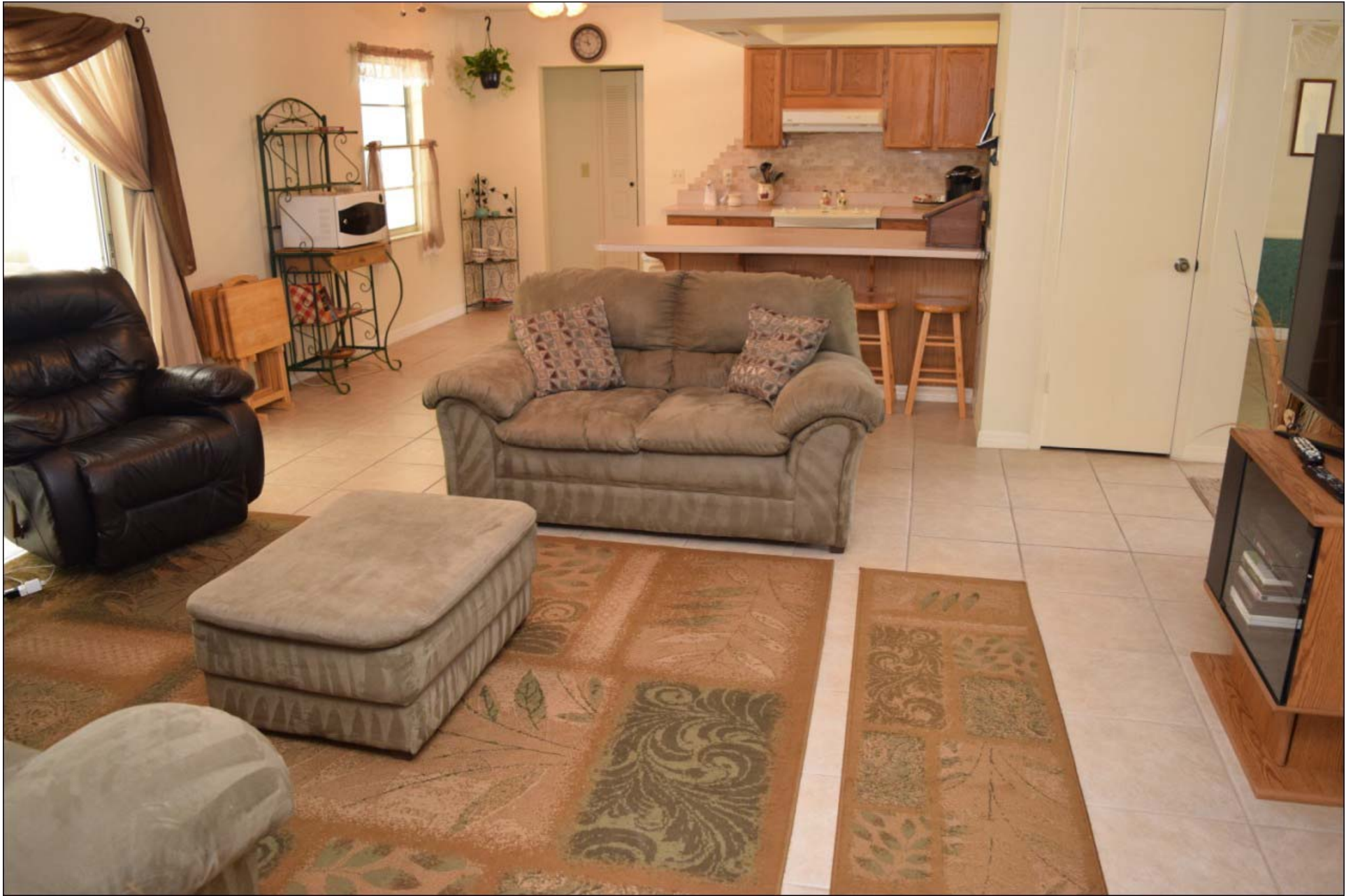
Open Plan Family Room onto Kitchen 17 x 16