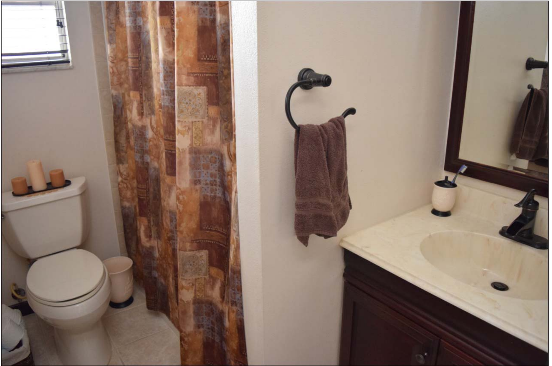
Attractive Bathroom 2 with vanity & shower in tub