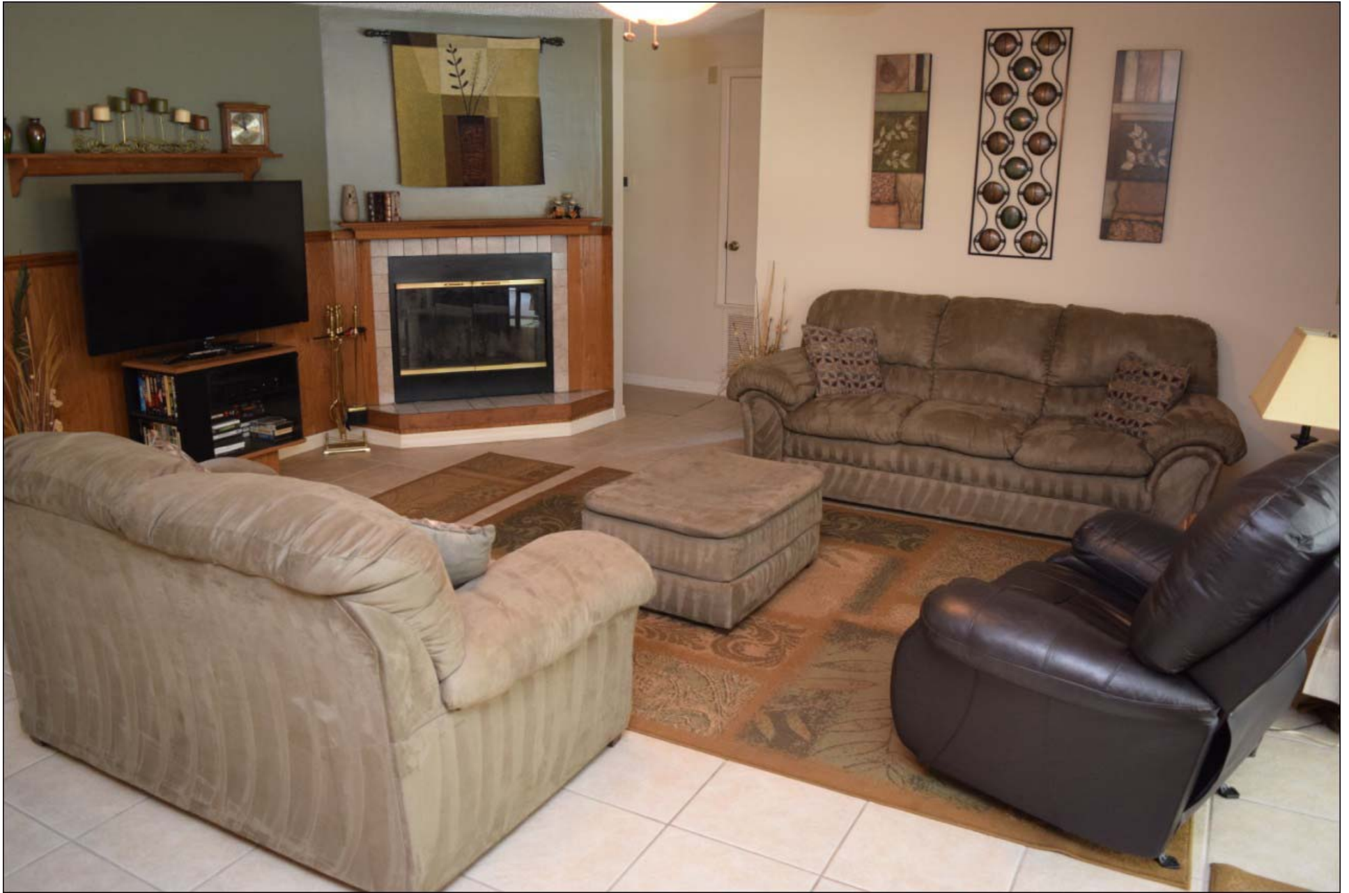
Family Room with wood burning fire place