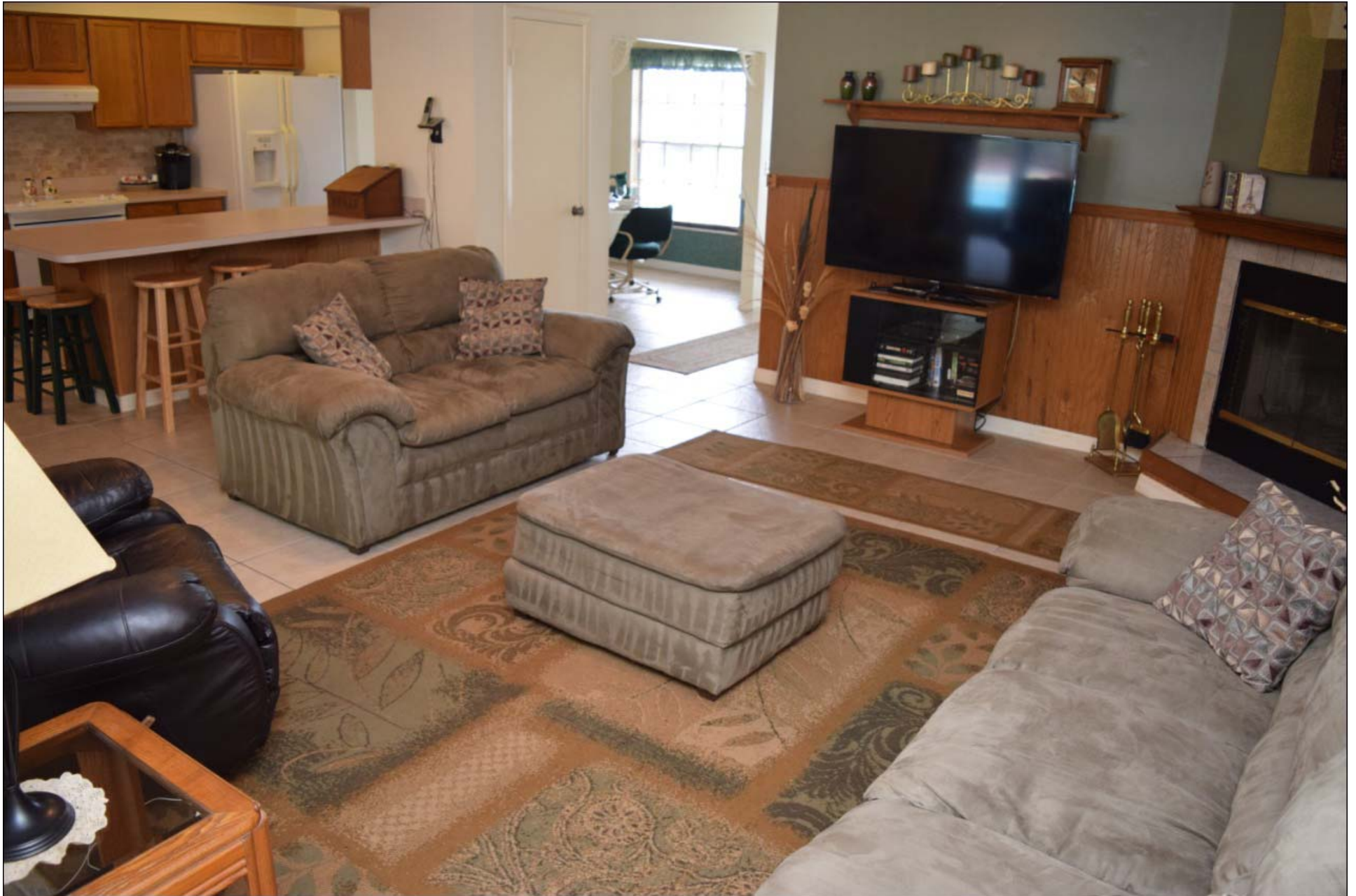
Open Plan Family Room with ceramic tiles