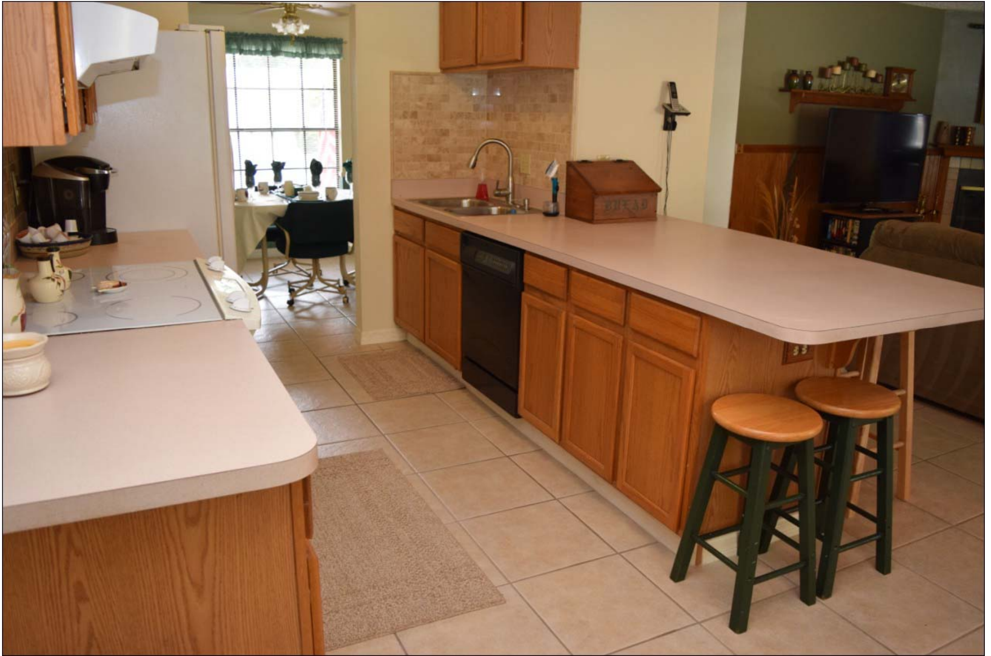
Kitchen with generous counter/working space