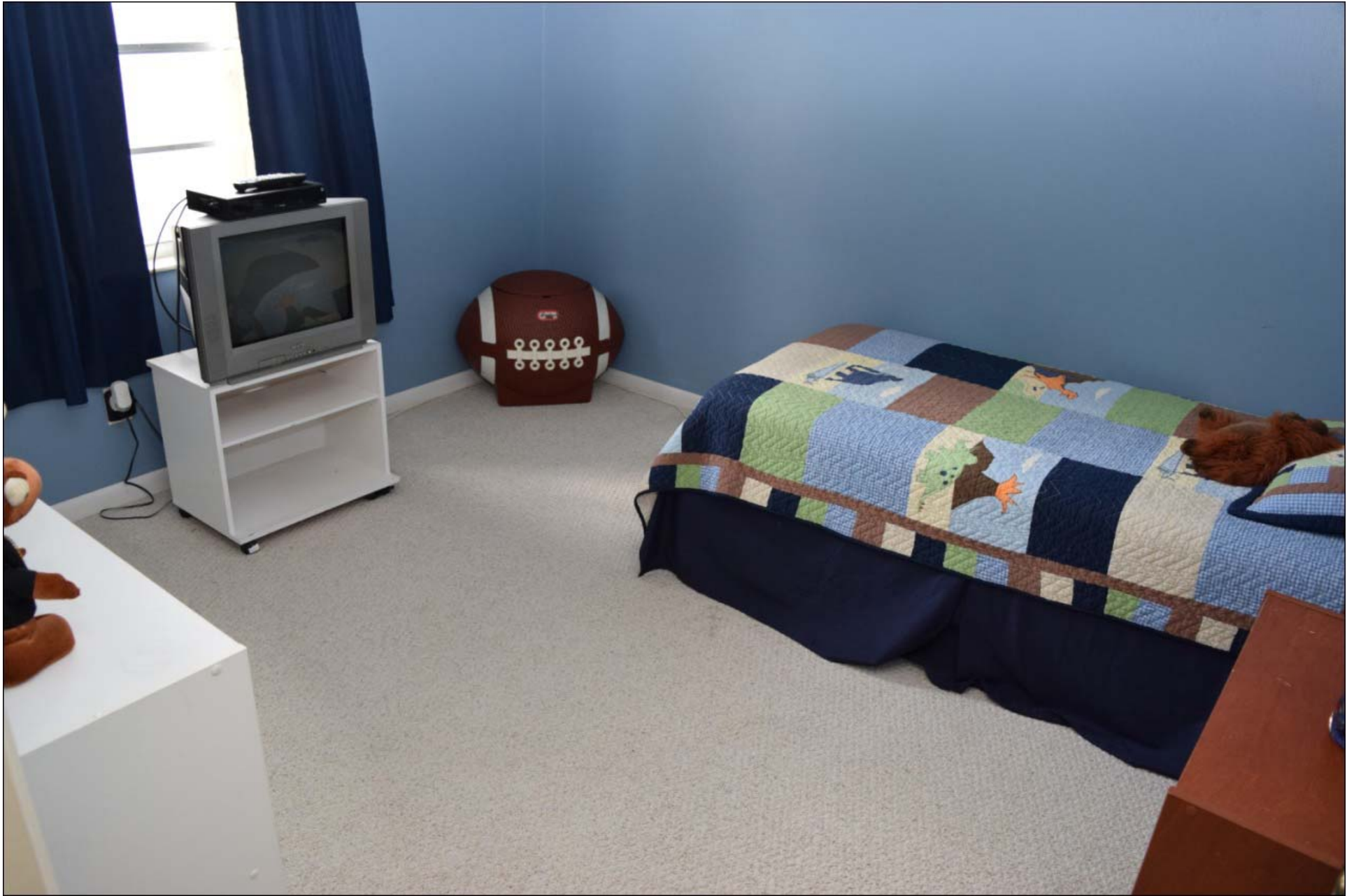
Bedroom 3 – 11 x 10