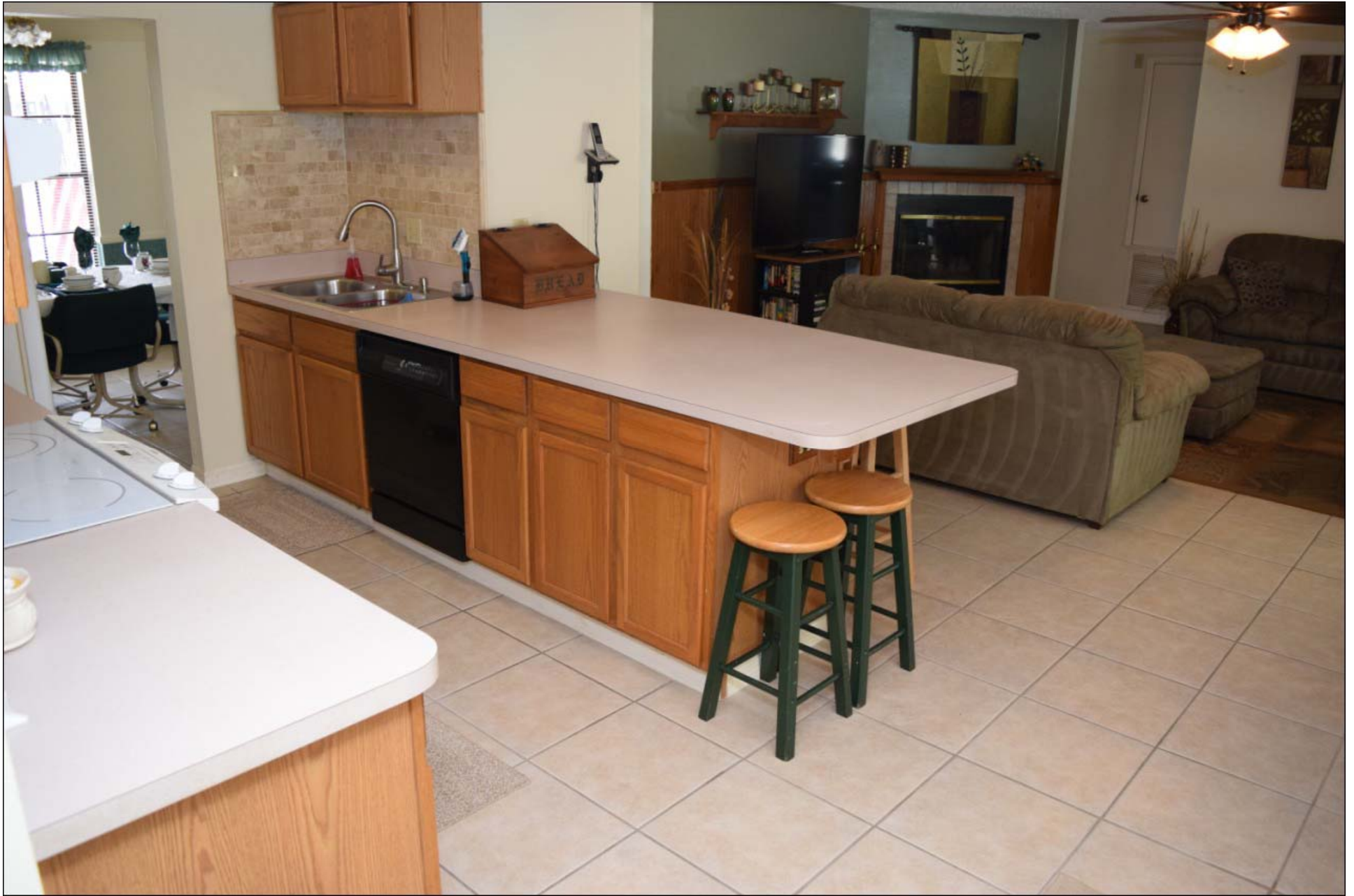
Open Plan Kitchen onto Family Room