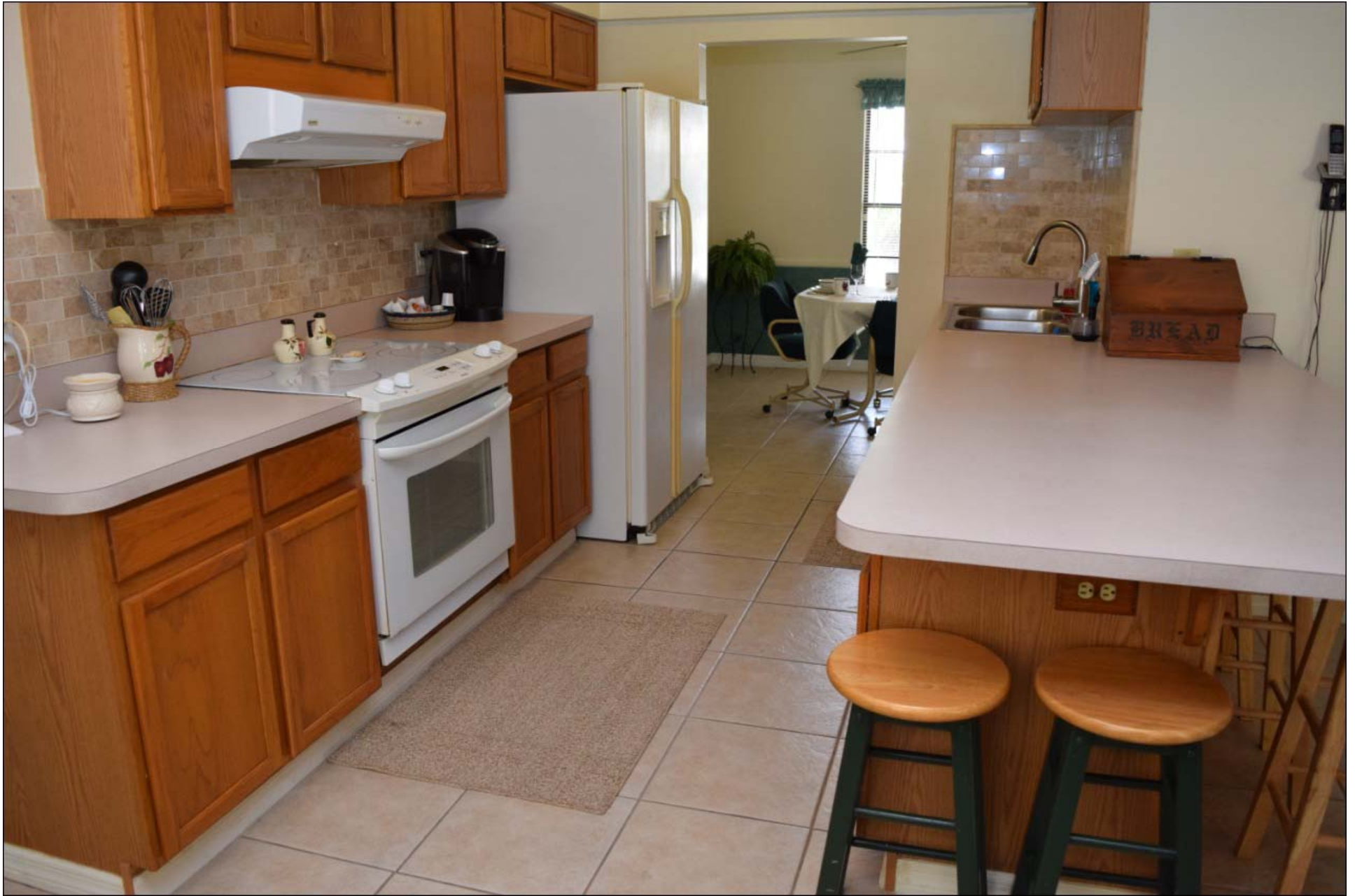
Kitchen with tan brick-tile backsplash & ceramic floors 18 x 12