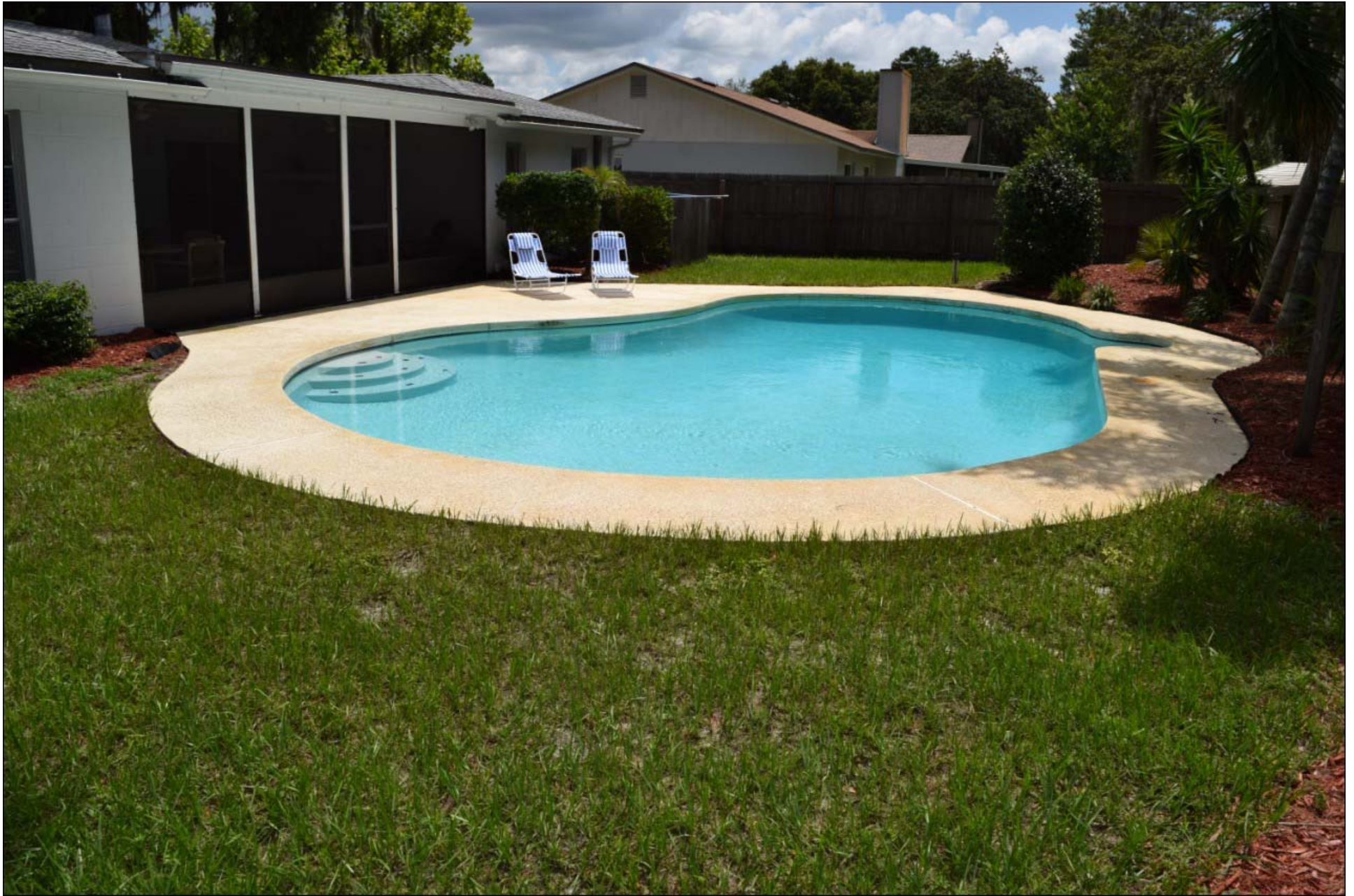
Pool with deck, steps, love seat & fenced in back yard 36 x 18