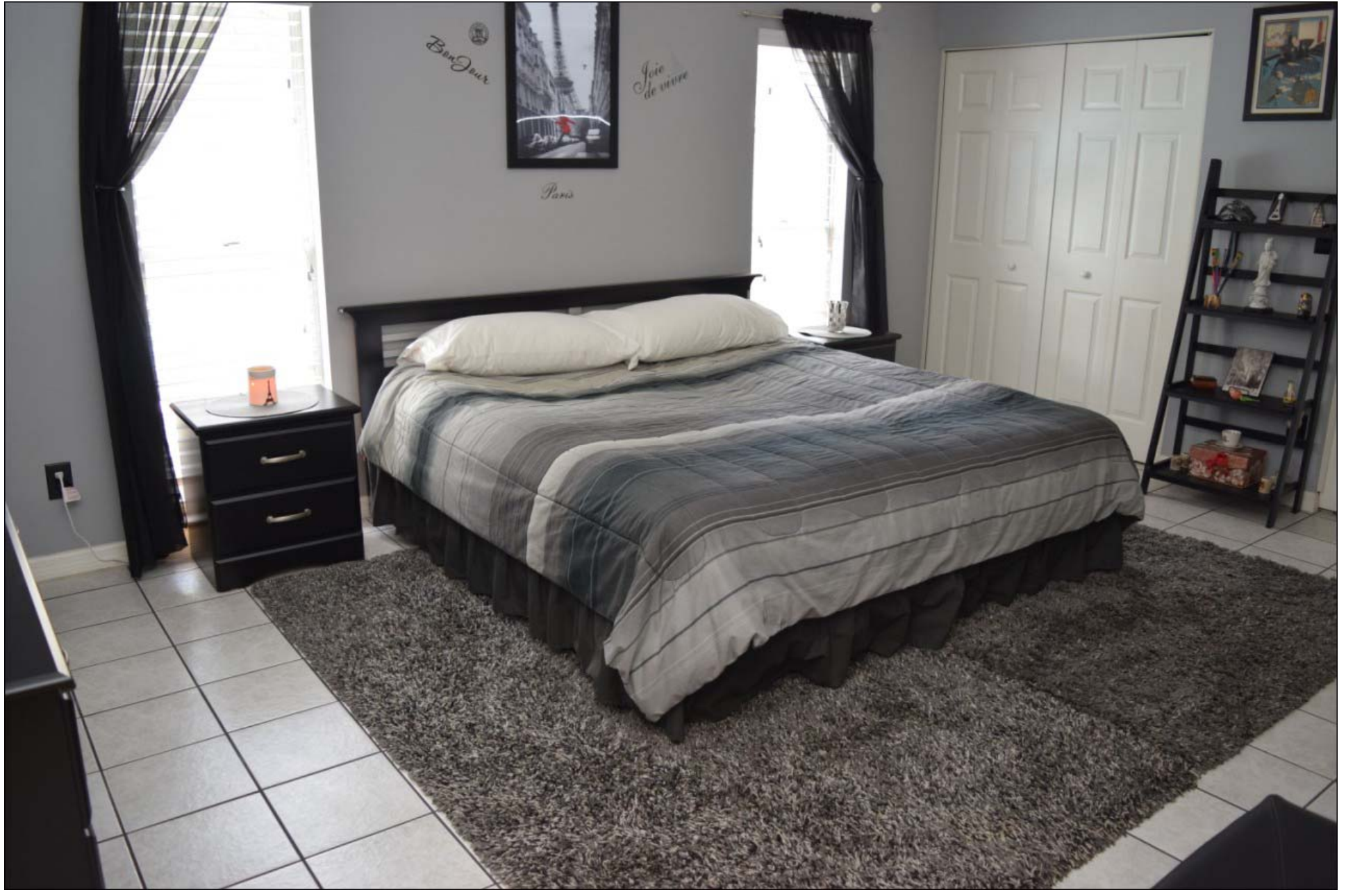
Large Master Bedroom with his&hers closets 18 x 13