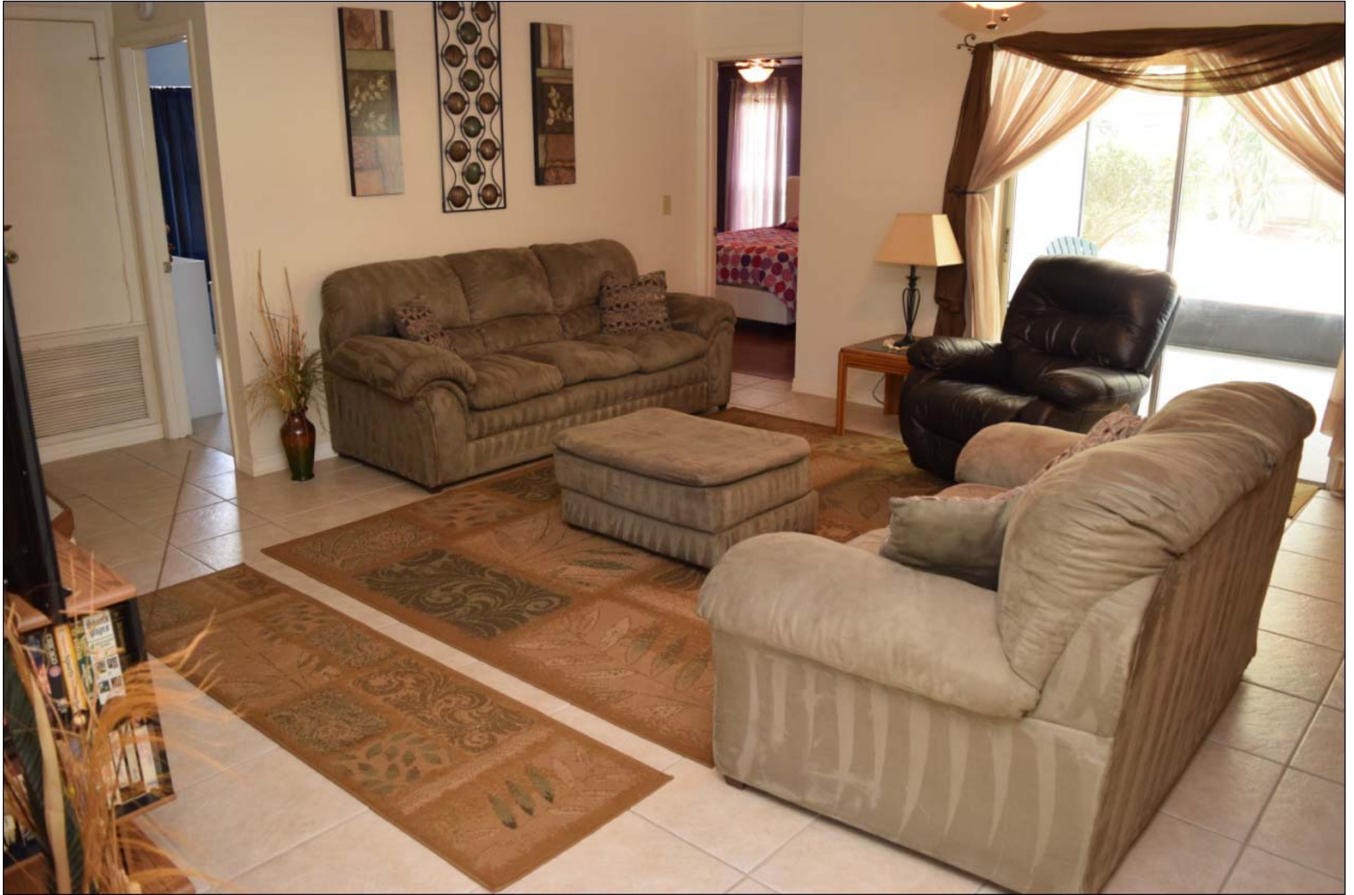
Open Plan Family Room with sliding doors onto back patio