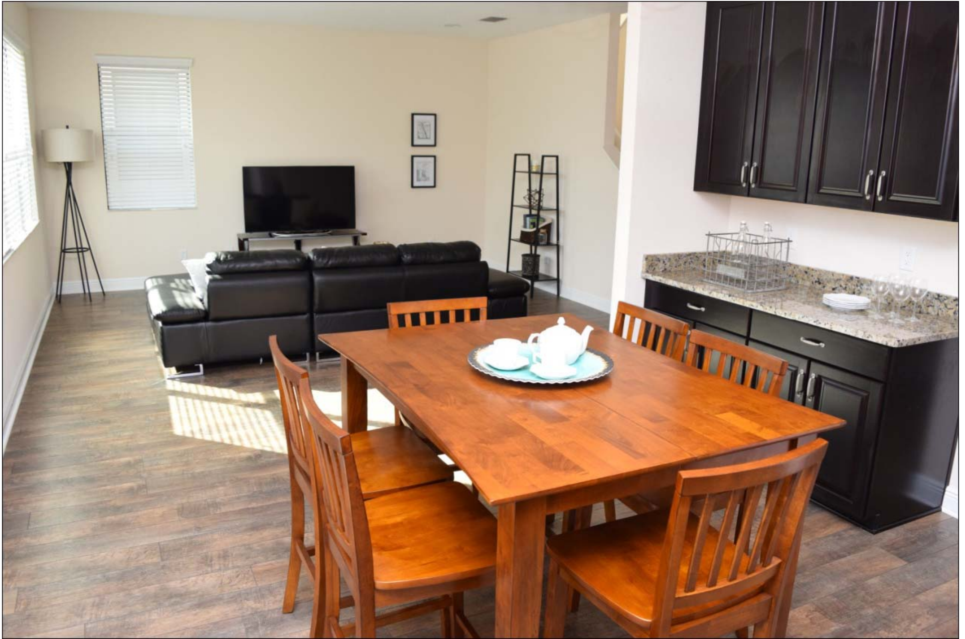
Dinette onto Family Room