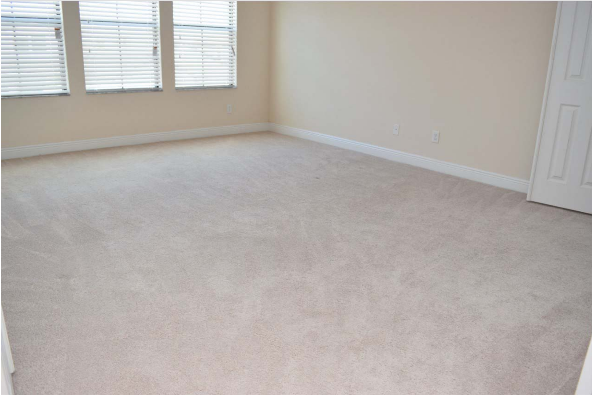
Large Master Bedroom – 18' x 14'