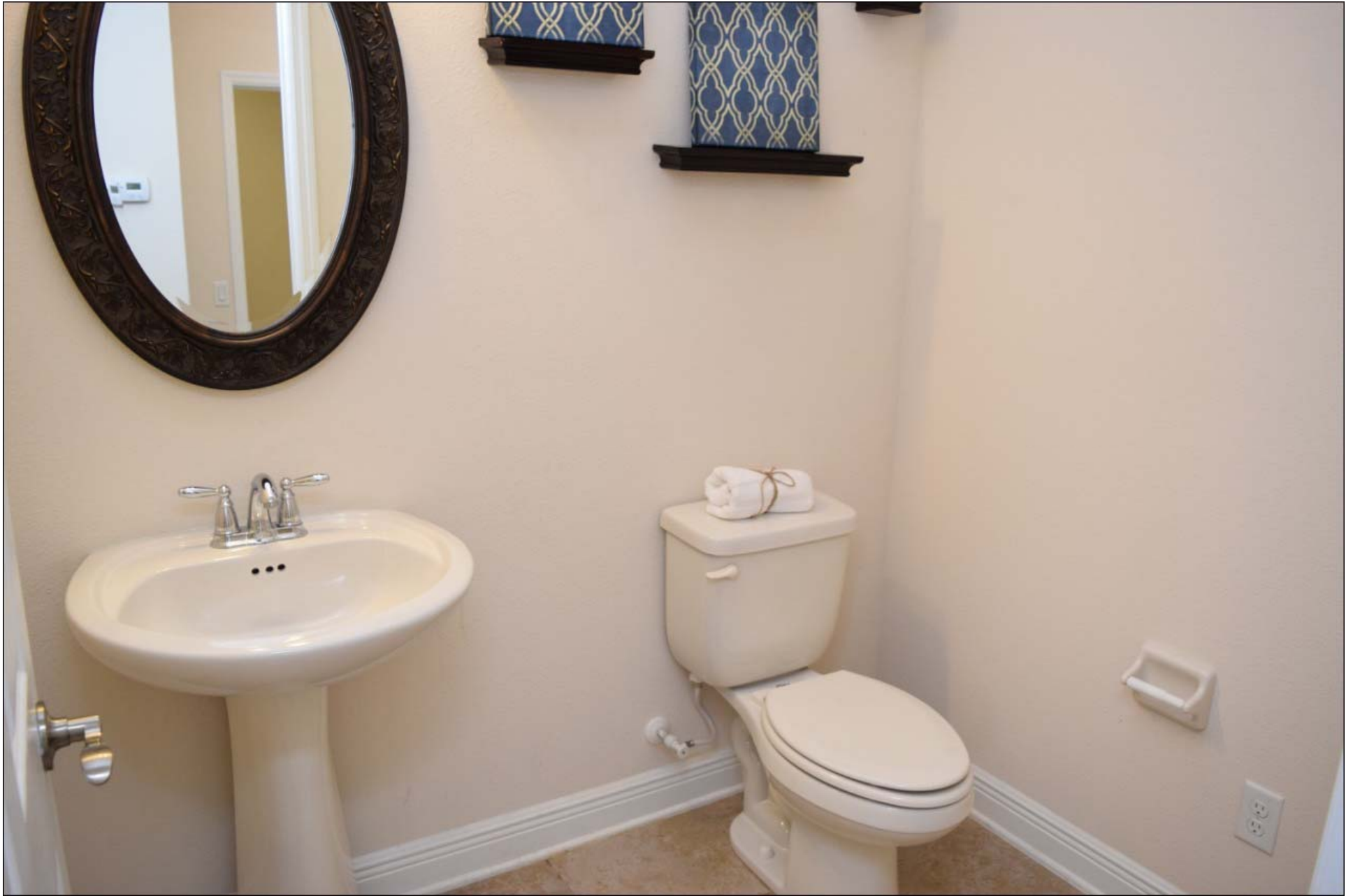
Downstairs guest bathroom