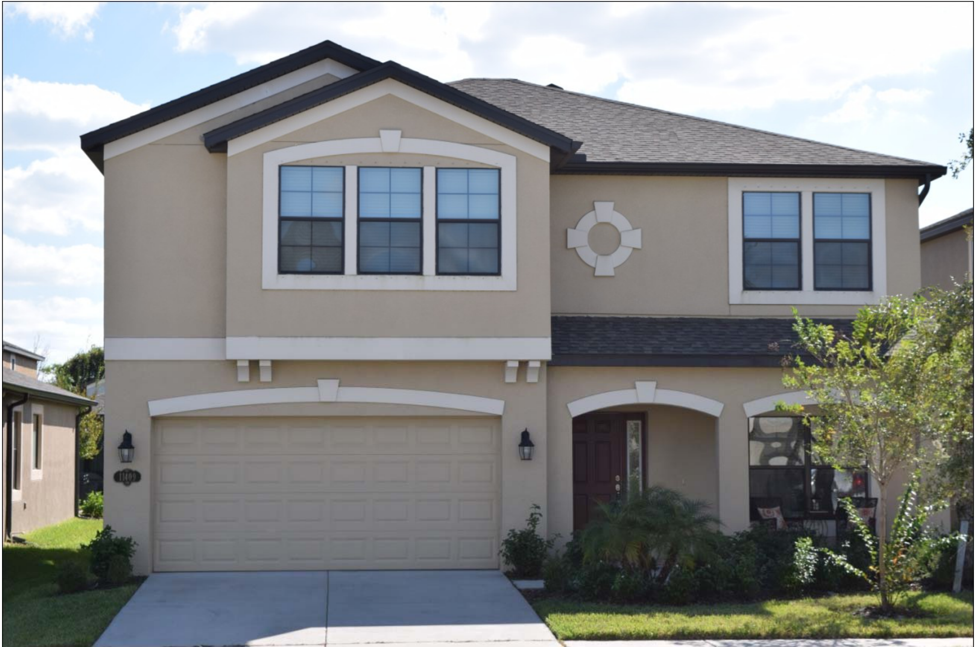
Front View – Level lot – NOT in a flood zone – 2014