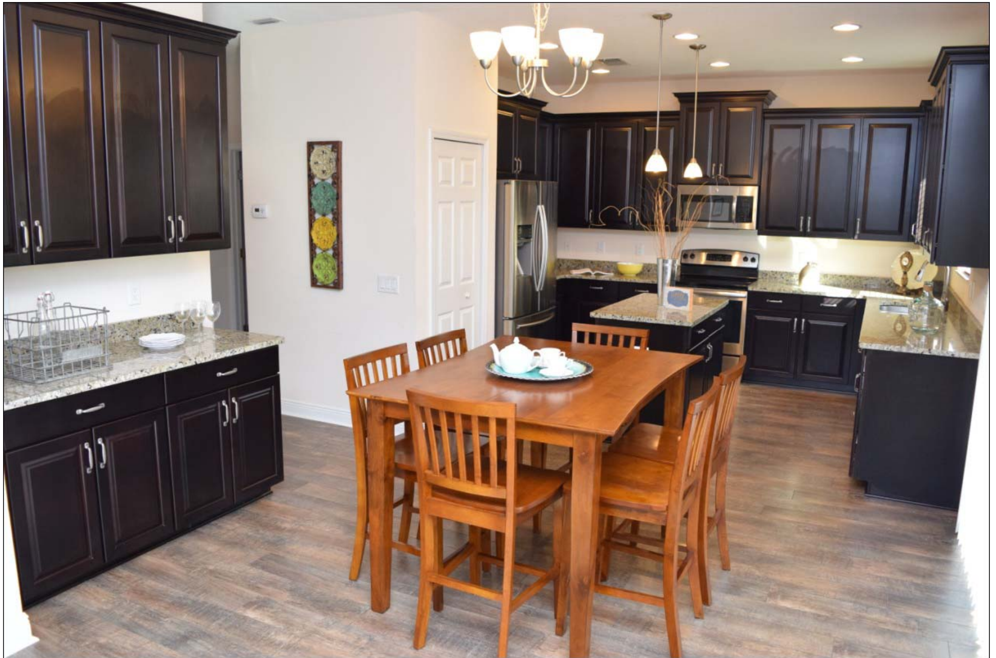
Dinette 14' x 9'