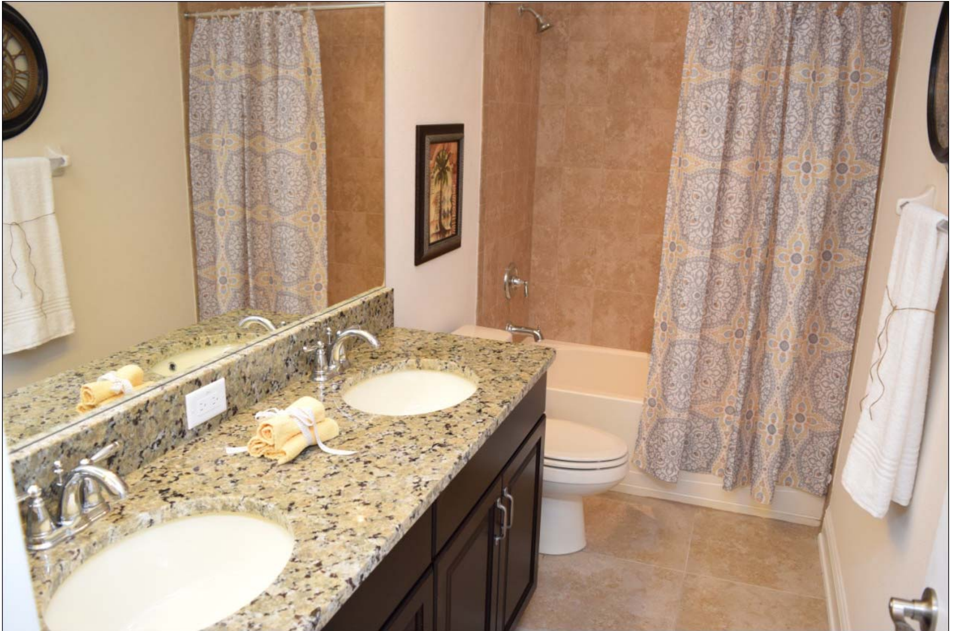
Bathroom 2 w/ granite, dual sinks & shower in tub