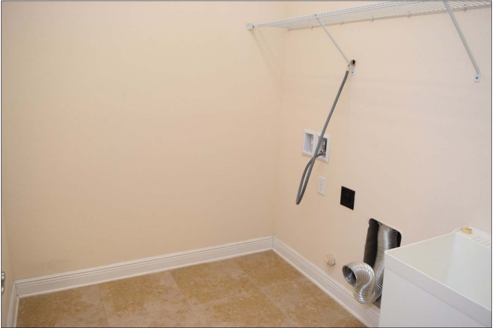
Laundry with sink