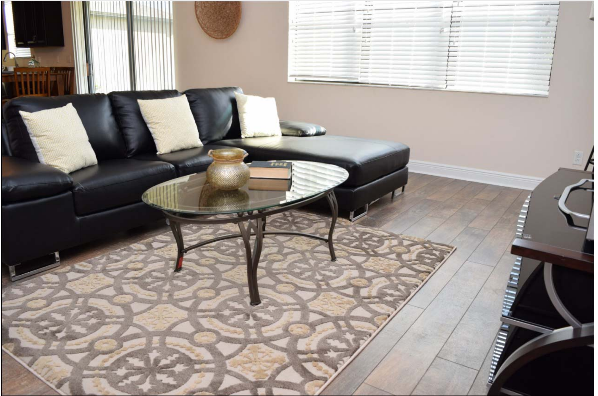
Family Room – sliding doors onto back patio