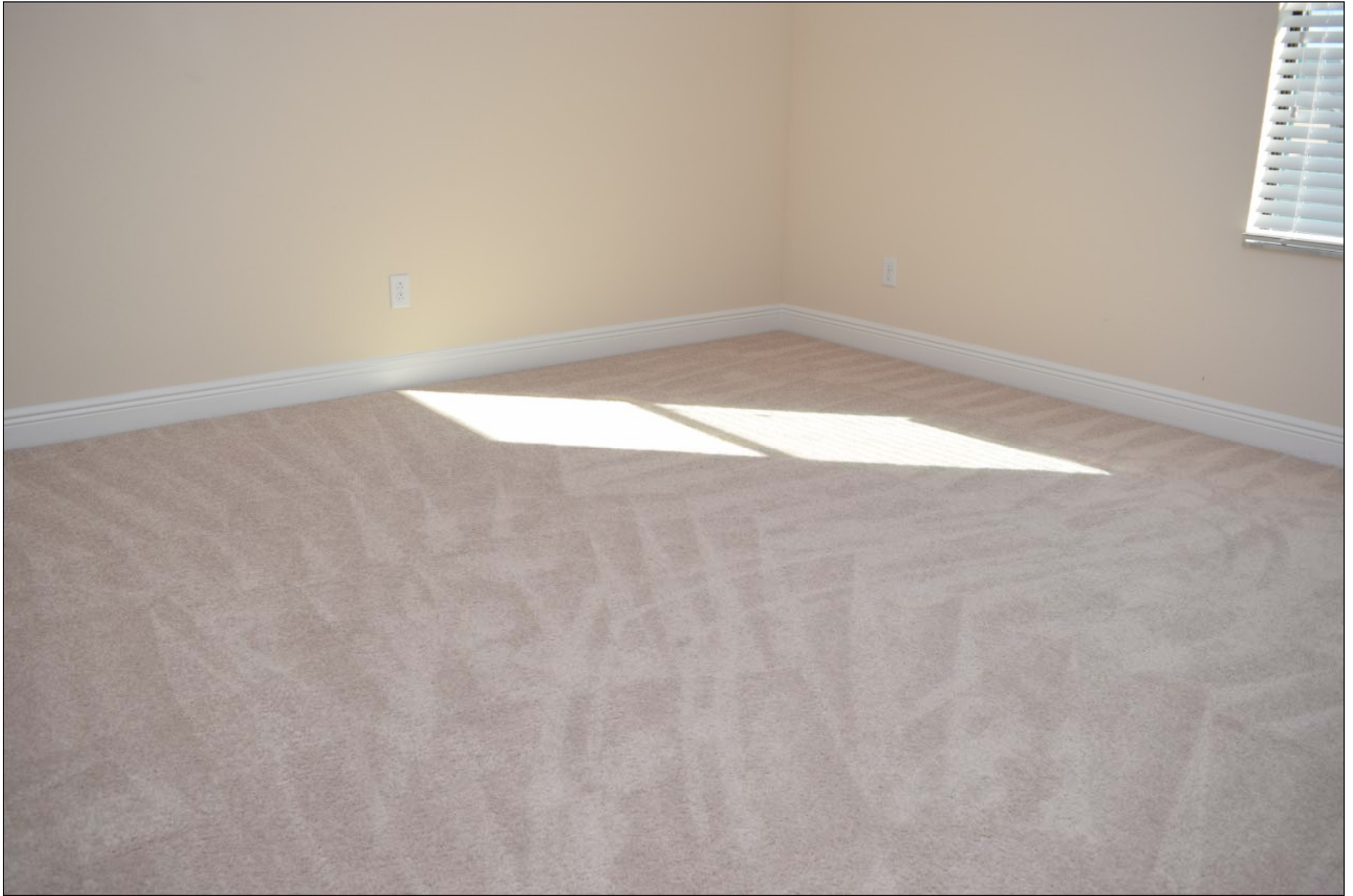
Bedroom 3 – 11' x 11'