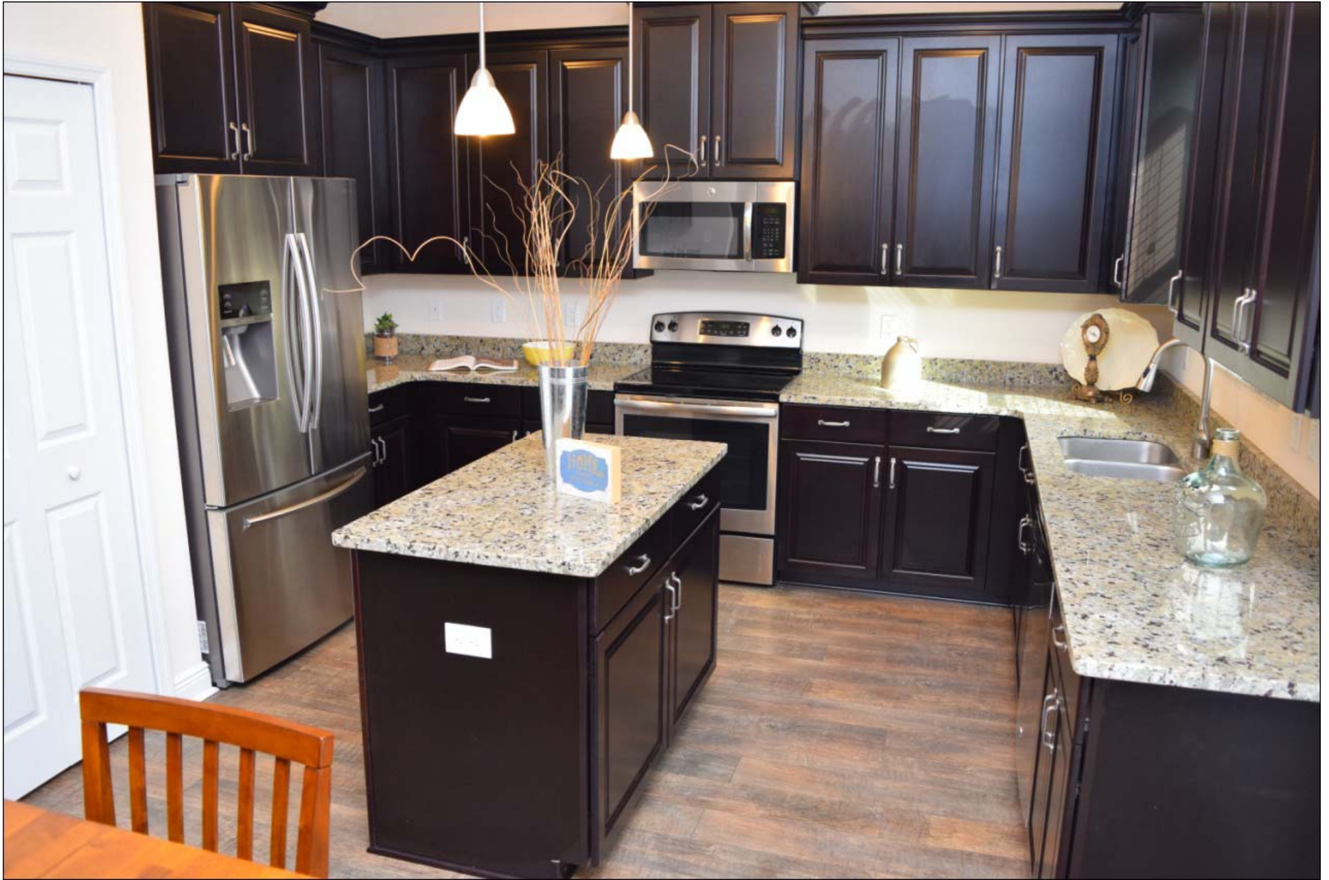
Kitchen w/ Granite, Solid cabinets, Stainless steel appliances, Island, Pantry 14' x 12'