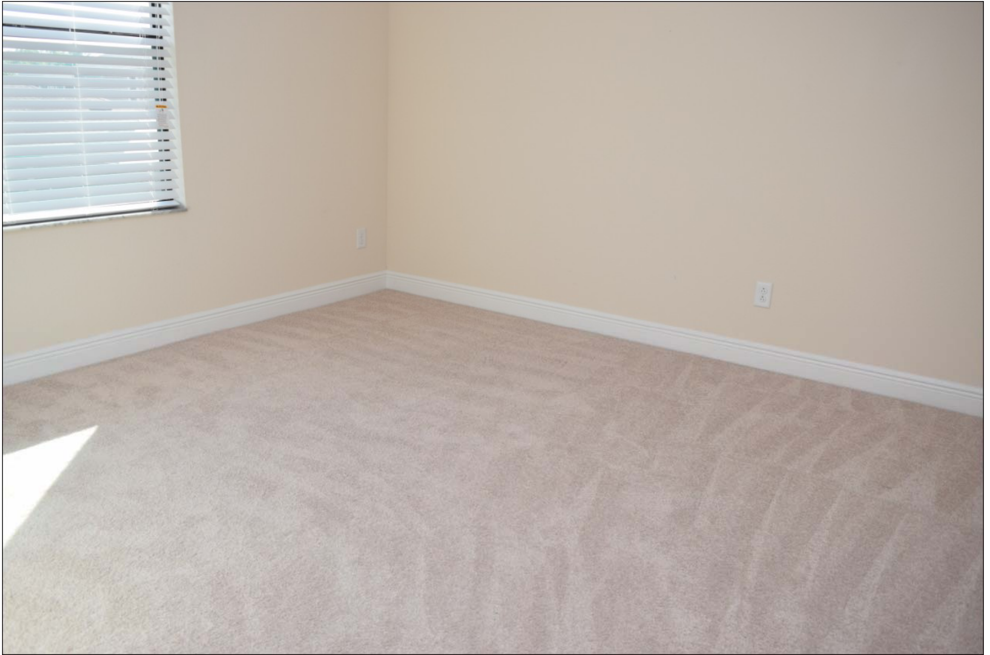
Bedroom 2 – 11' x 10'