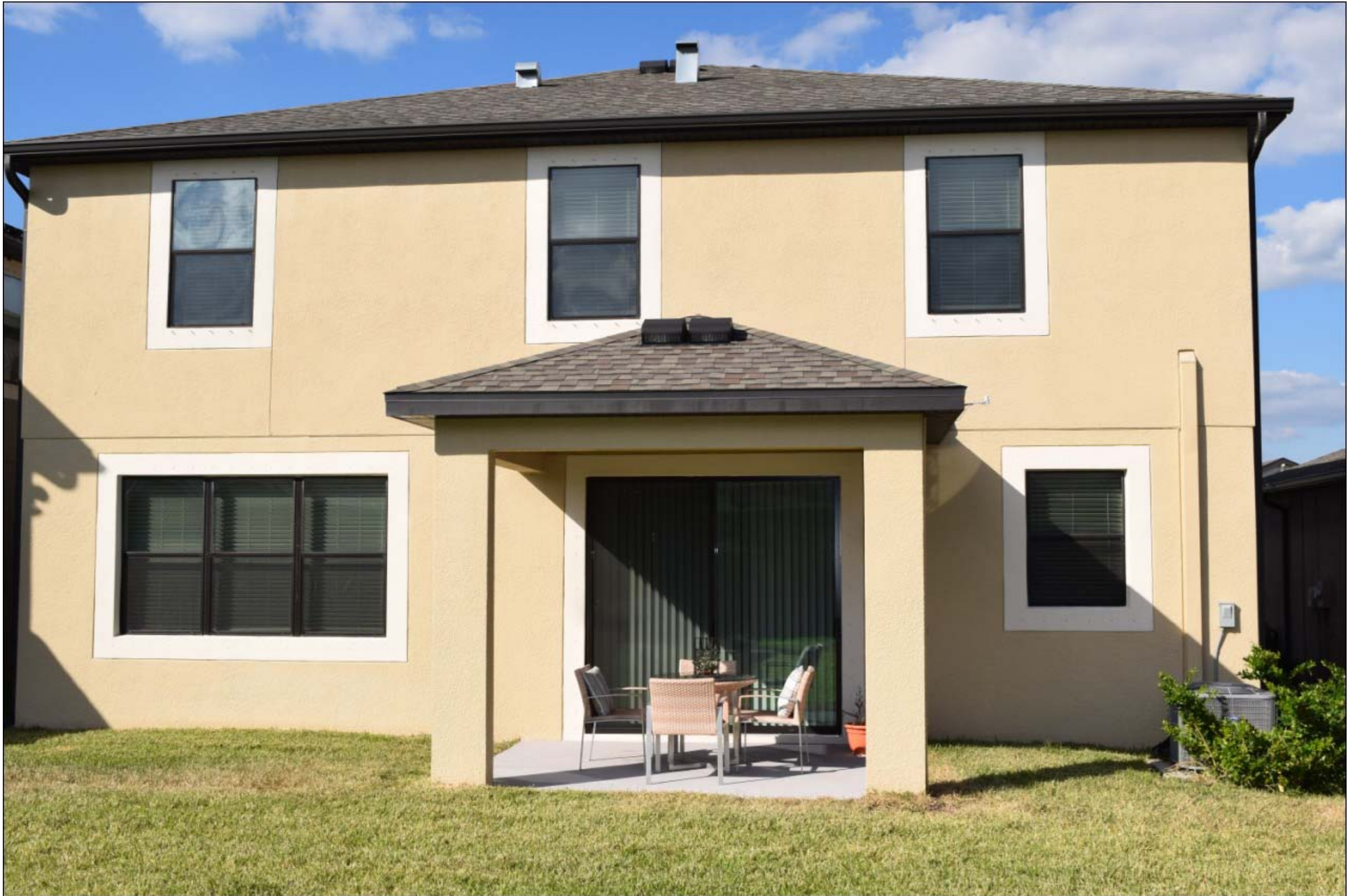
Back Yard & Covered Patio