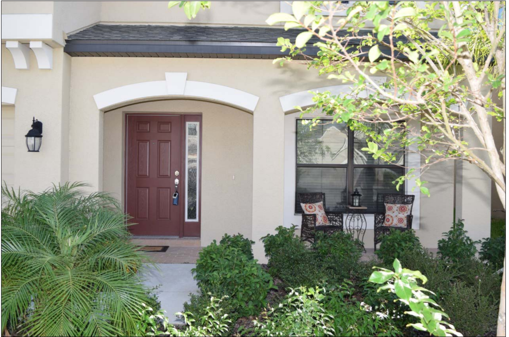
Front Entrance & Porch