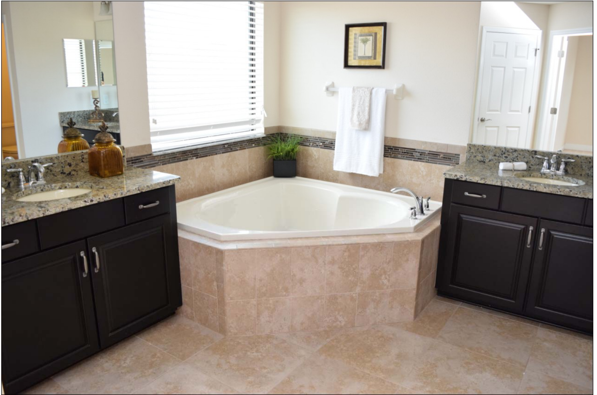
Master Bathroom w/ garden tub and his&hers granite vanities