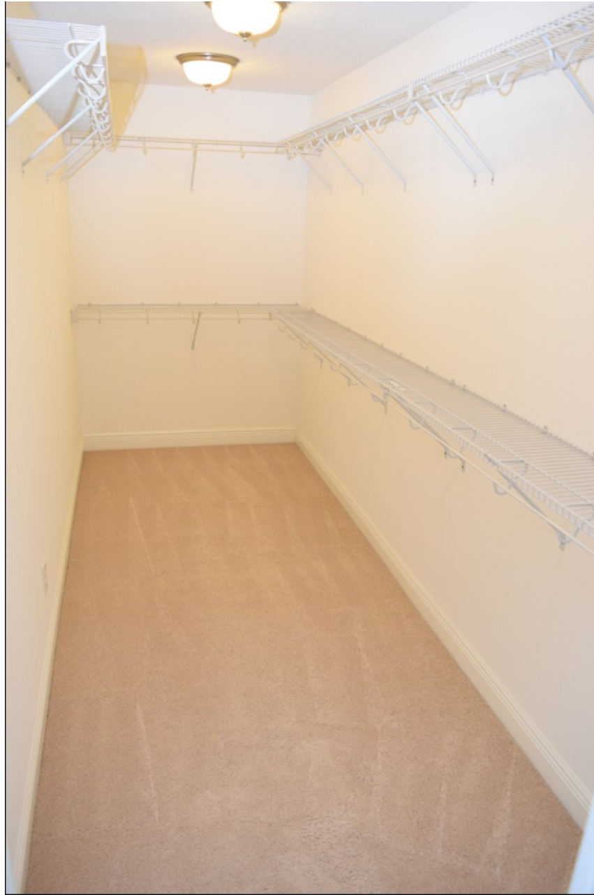
Large Master Bedroom walk-in-closet