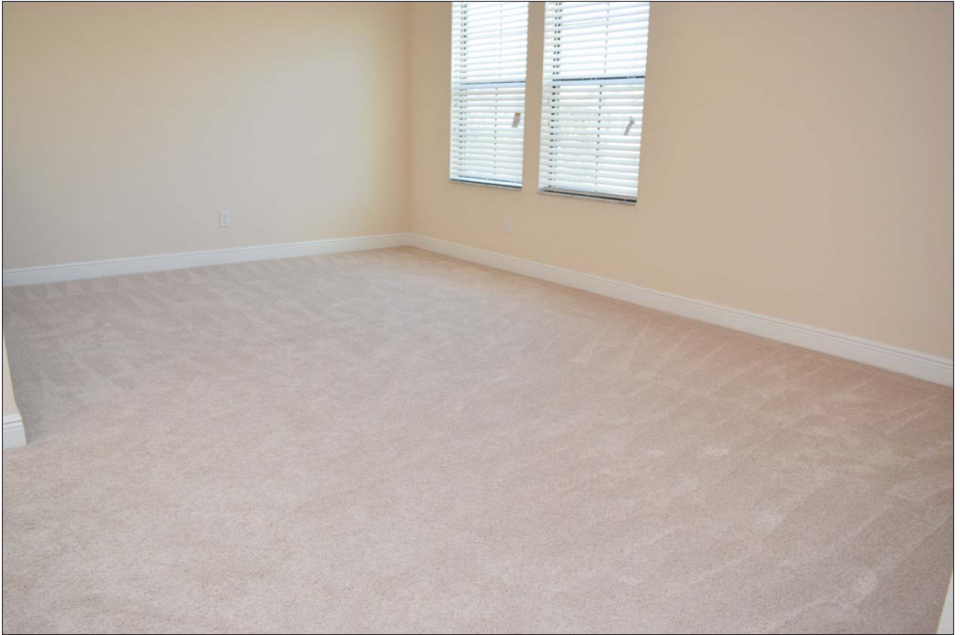
Upstairs Bonus Room – 2 nd living space 19' x 11'