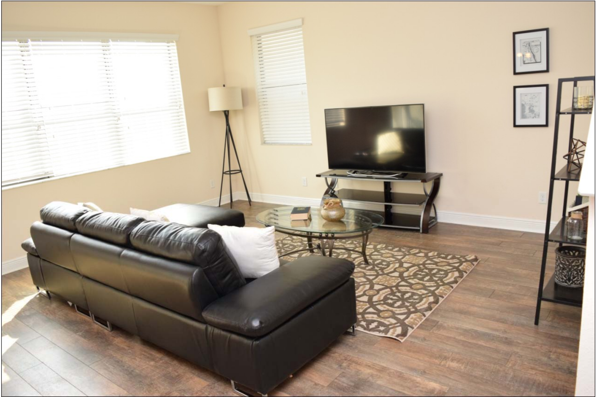
Family Room with back view 17' x 15'