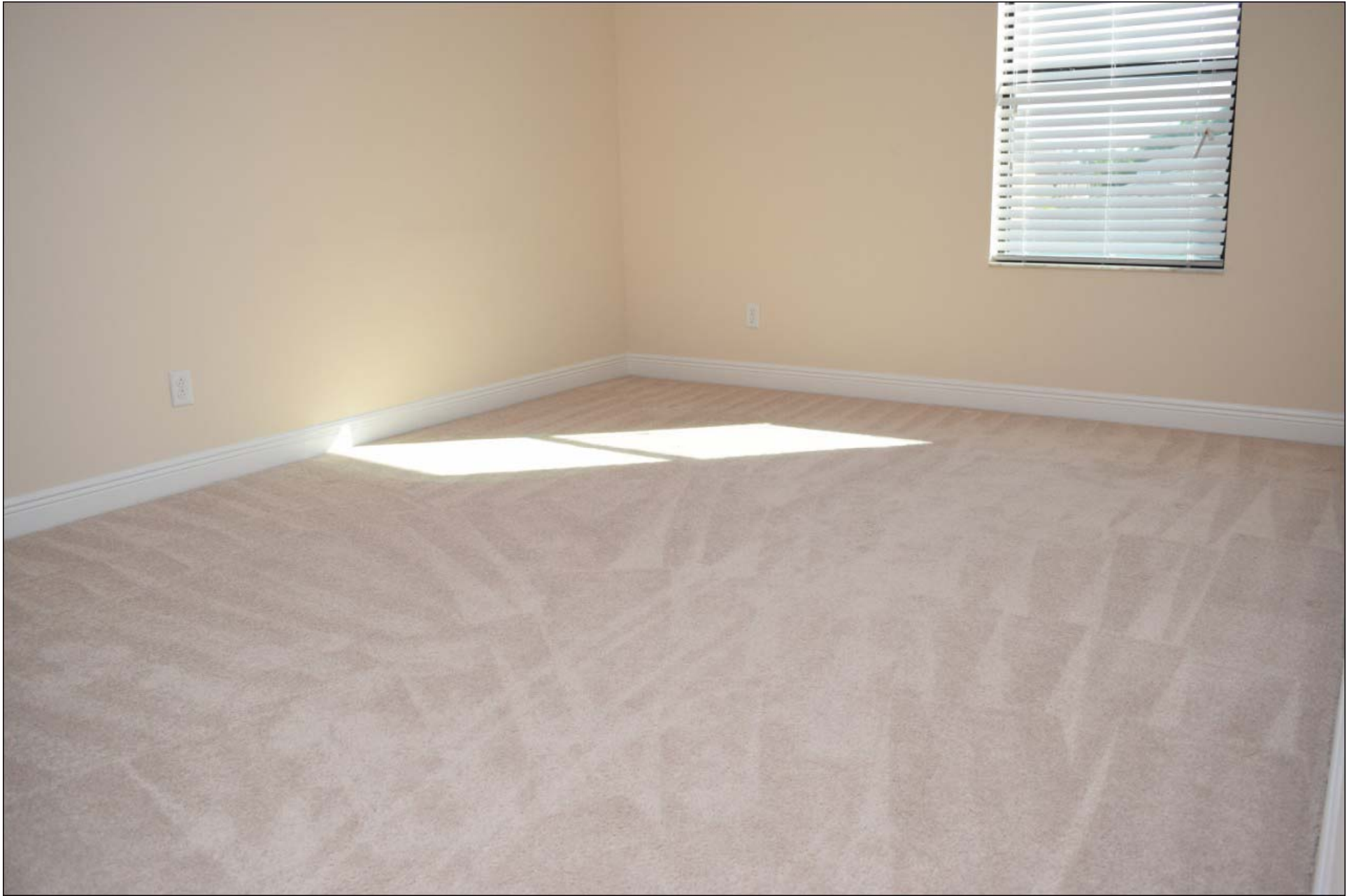
Bathroom 4 – 15' x 11'