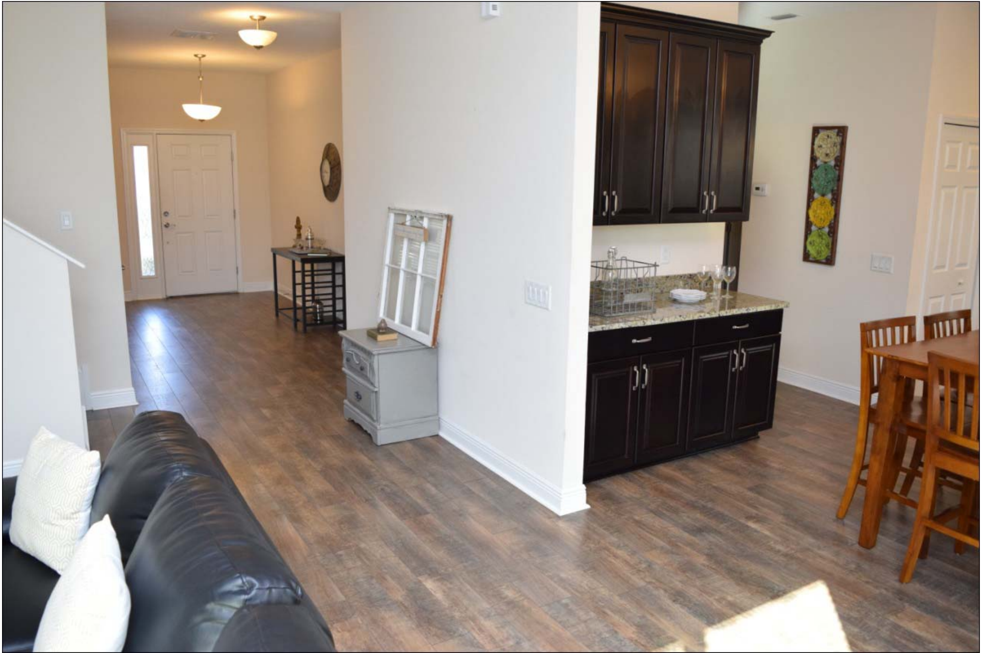
Family Room back to Entrance – Breezeway