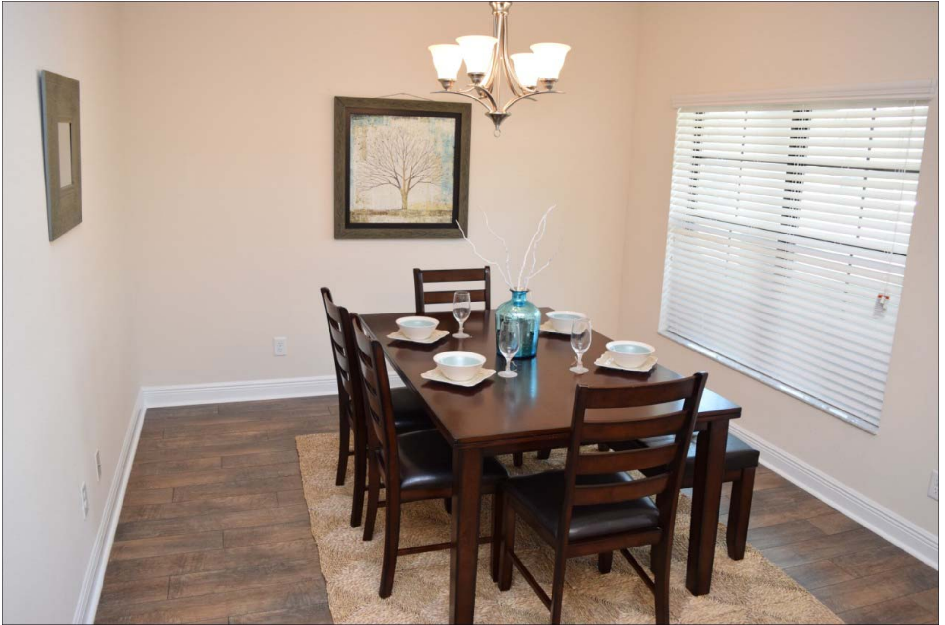
Formal Dining Room with Front View 13' x 10'