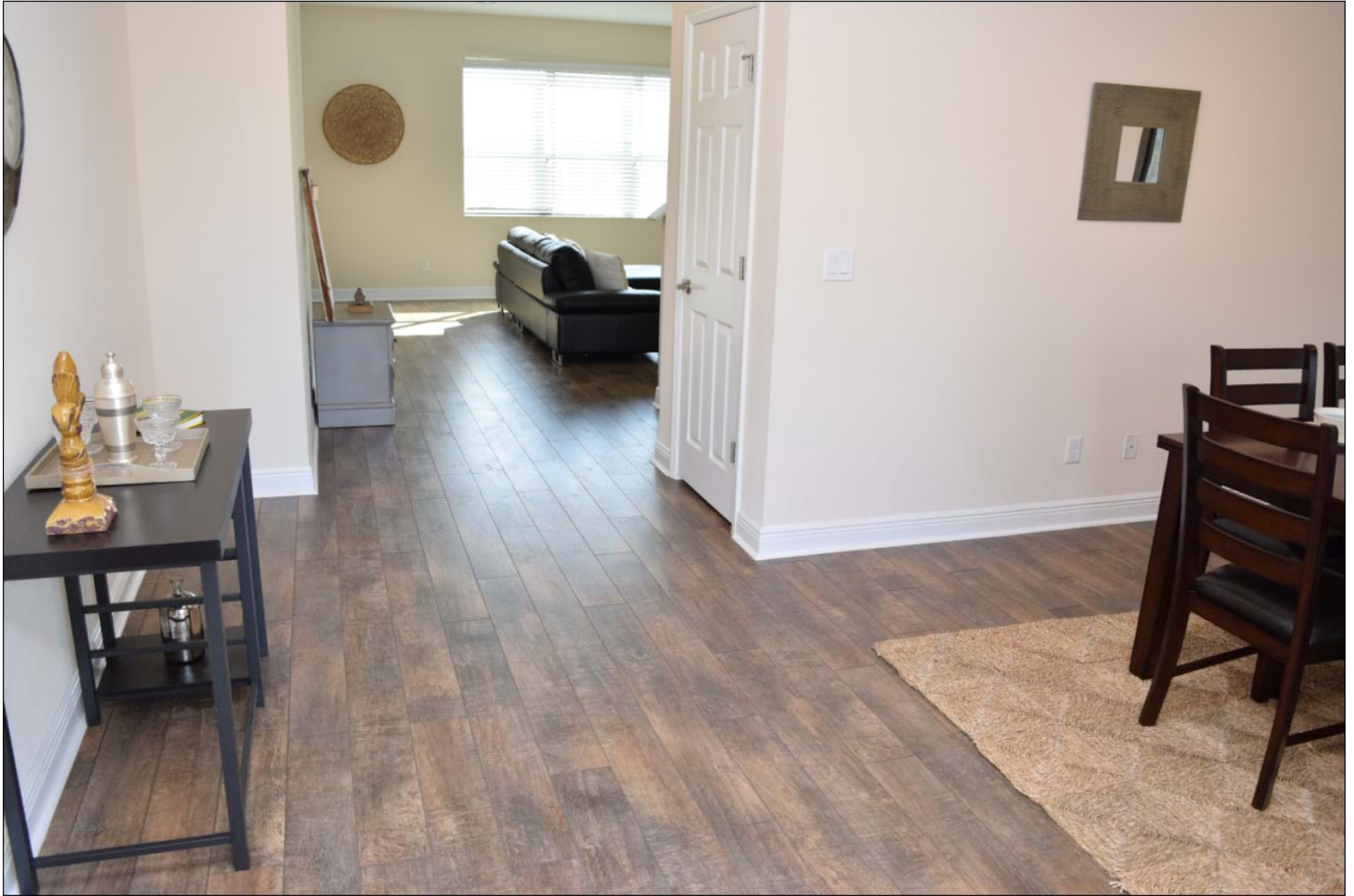
Entrance – Breezeway – high quality laminate floors