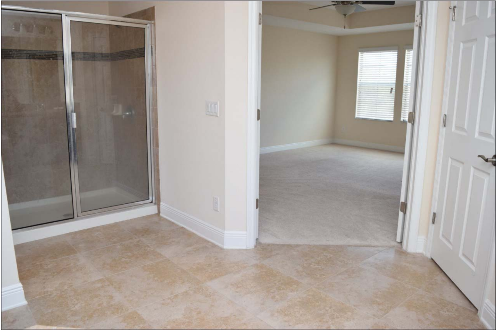
Master bathroom with separate shower & private W.C.