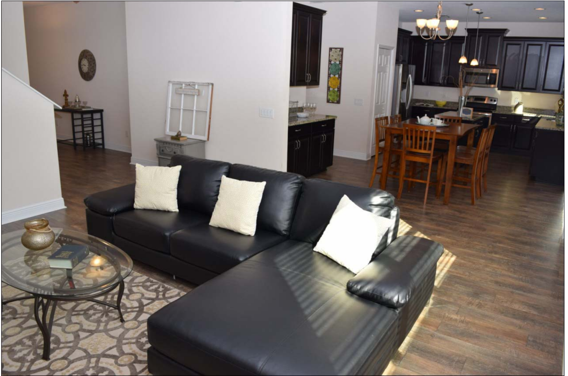
Family Room onto Dinette/Kitchen