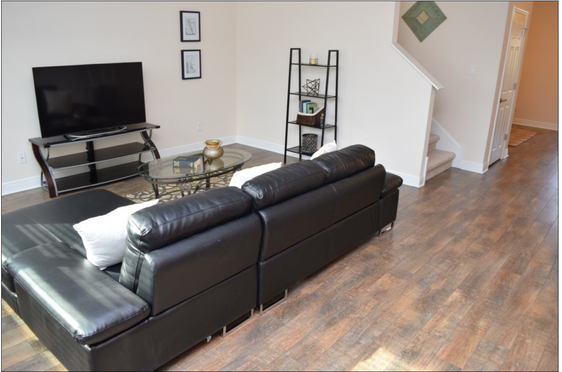
Family Room – staircase with storage room underneath