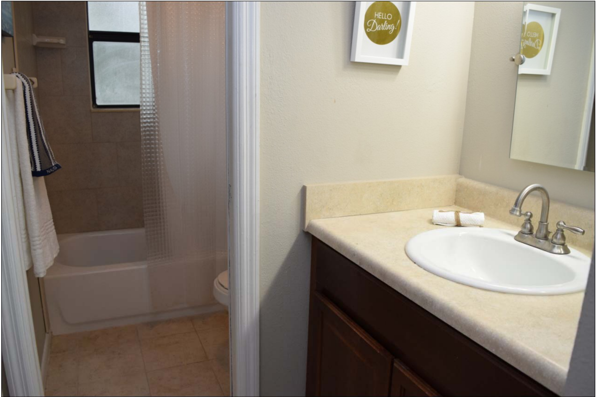
Bathroom 2 with shower in tub