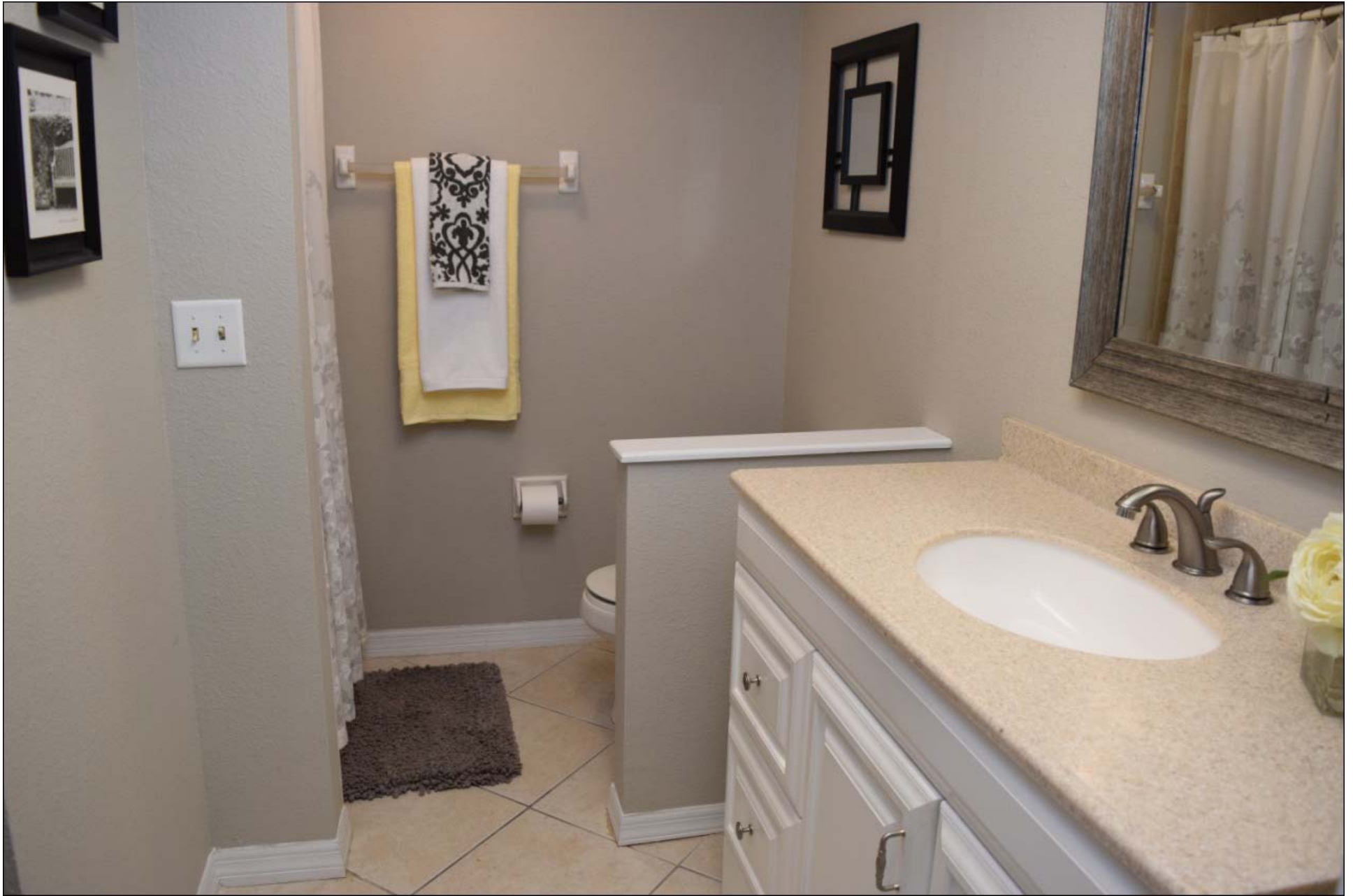
Elegant Master bathroom with shower