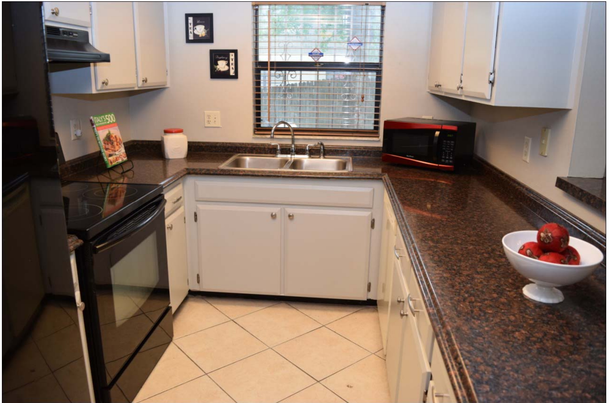
Kitchen w/ granite counters, solid cabinets & view over wooded back yard - 11 x 8