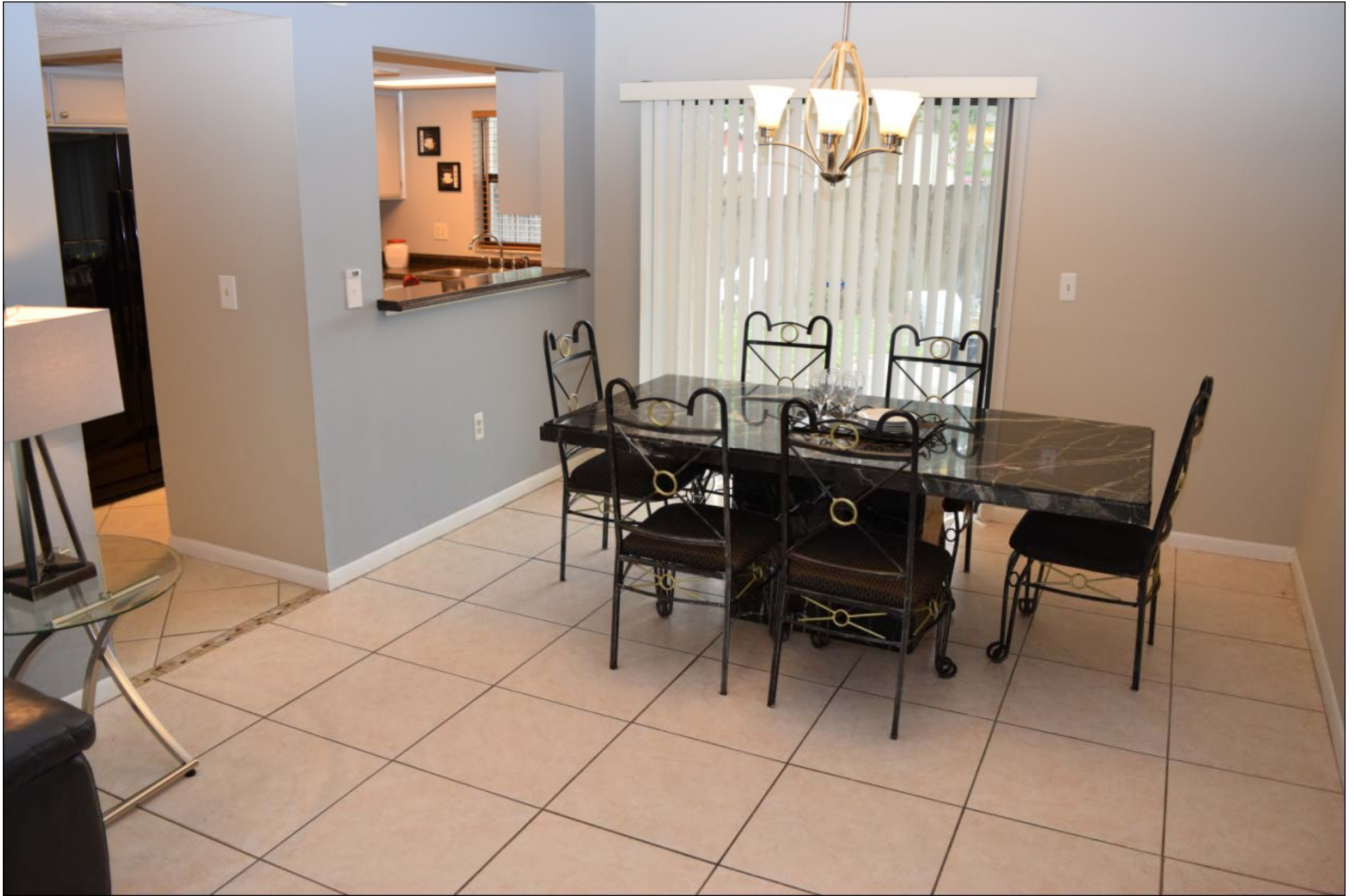
Dining room with sliding doors onto fenced in back yard - 12 x 9