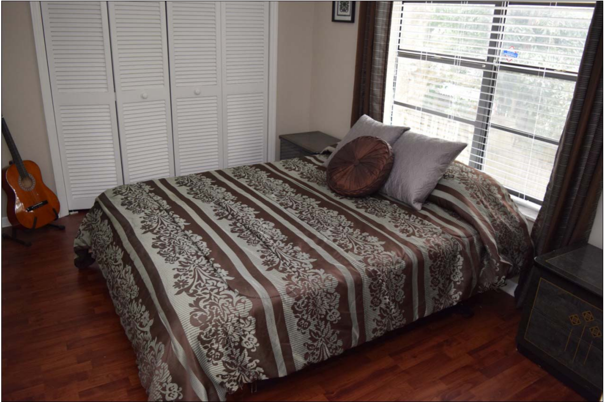
Bedroom 3 with private door to bathroom 2 making a perfect guest room - 12 x 9