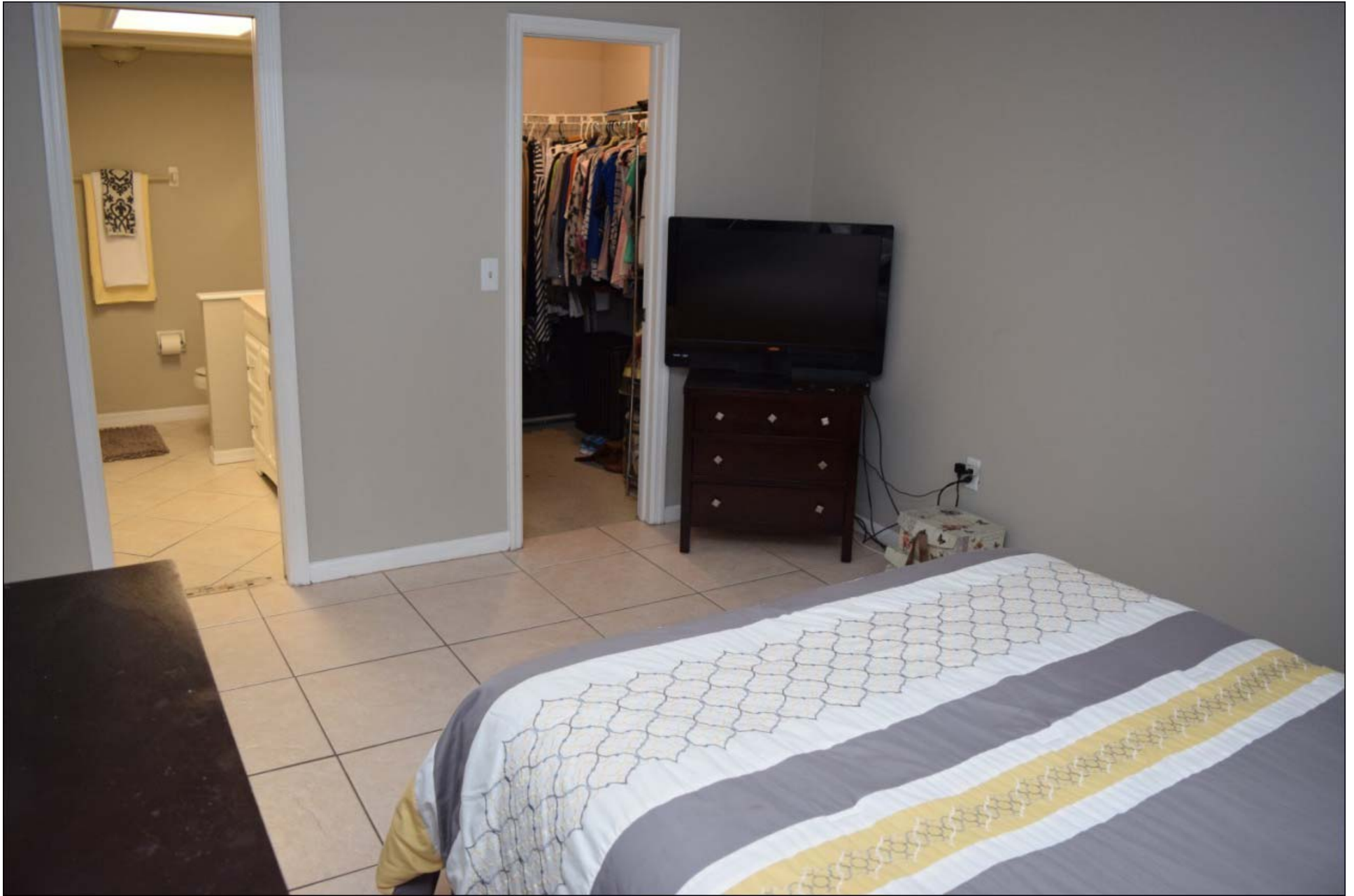
Master bedroom with walk-in-closet & master bathroom