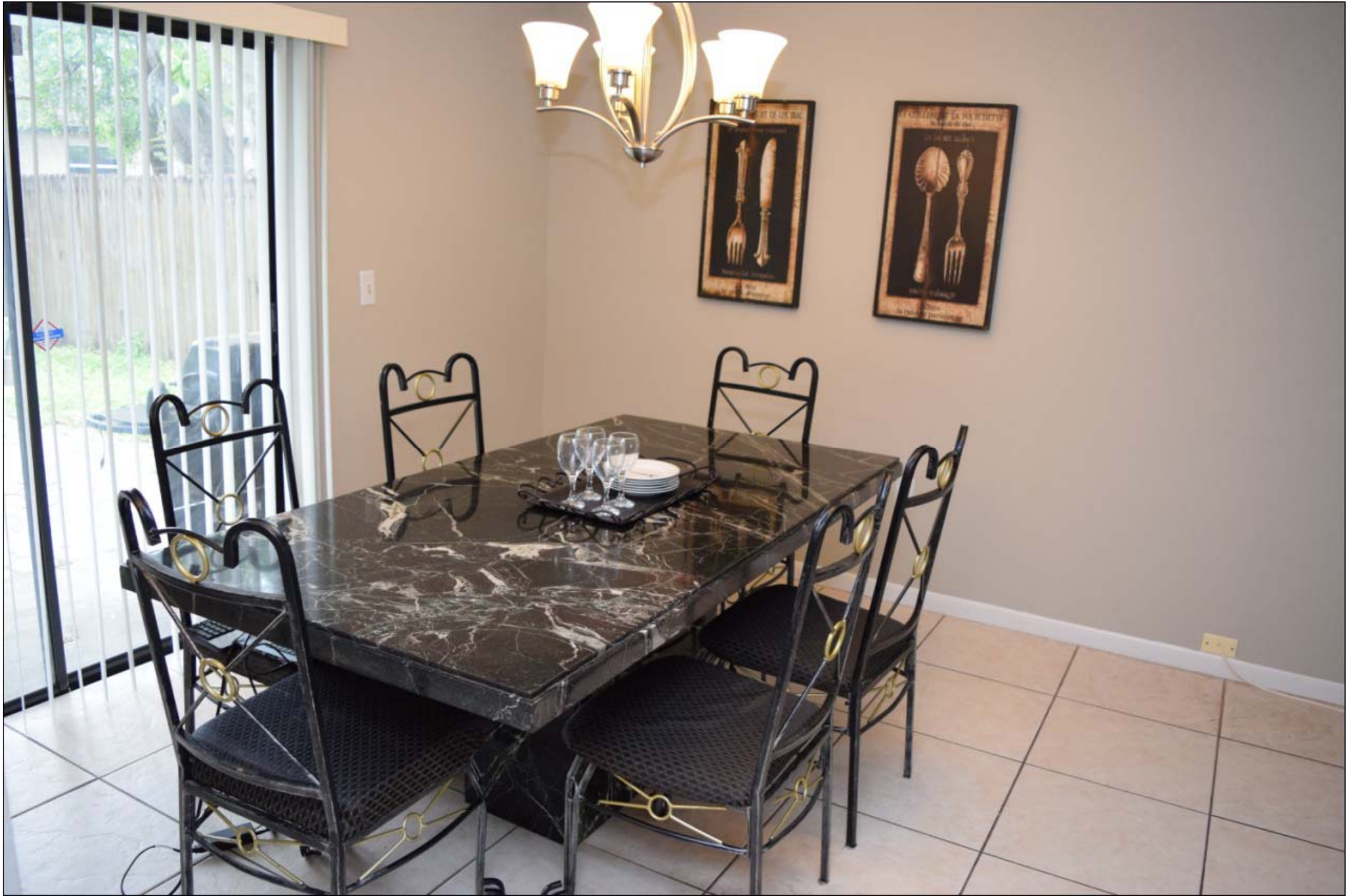
Dining Room overlooking fenced in back yard