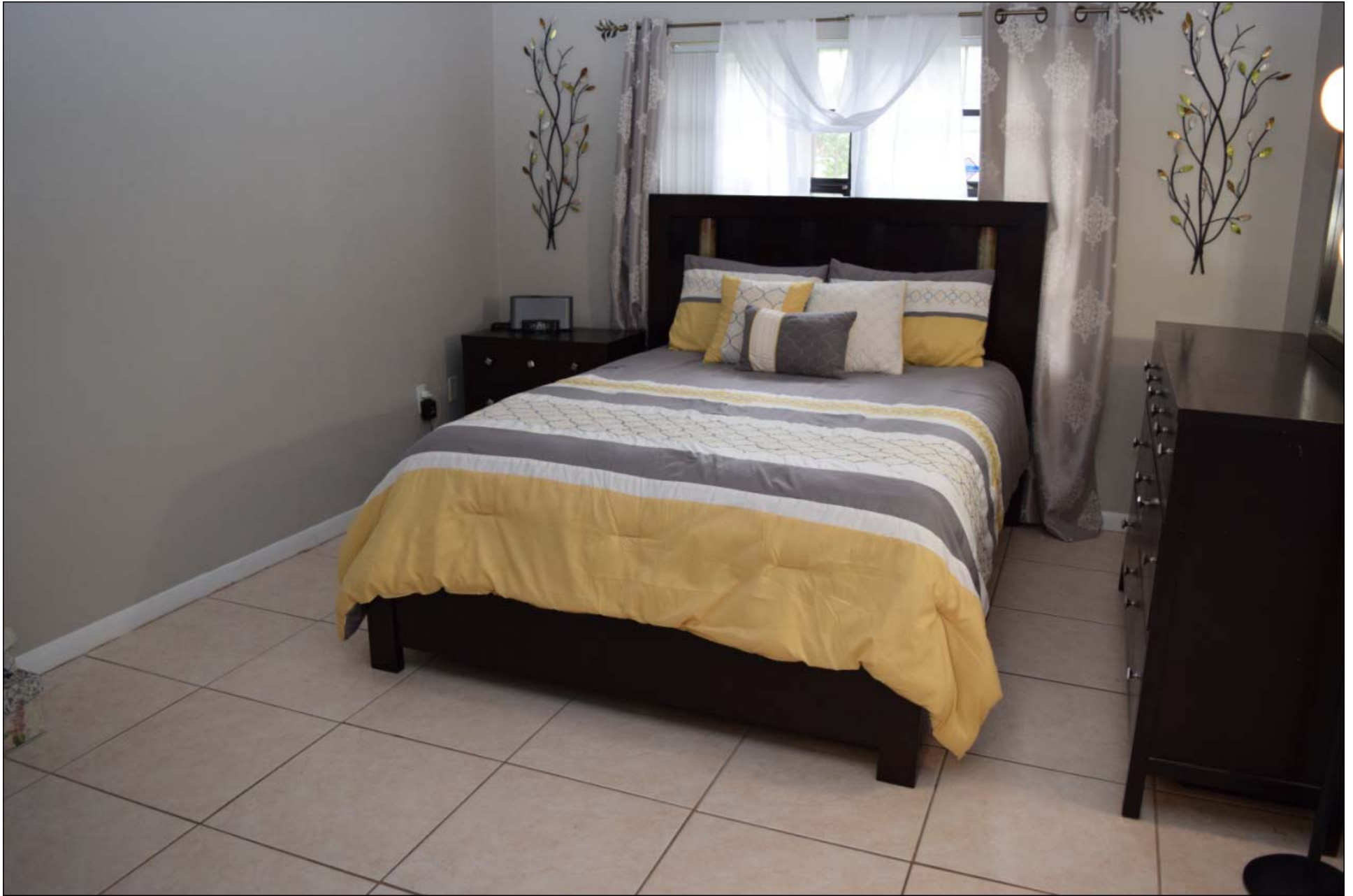
Large Master bedroom - 15 x 12