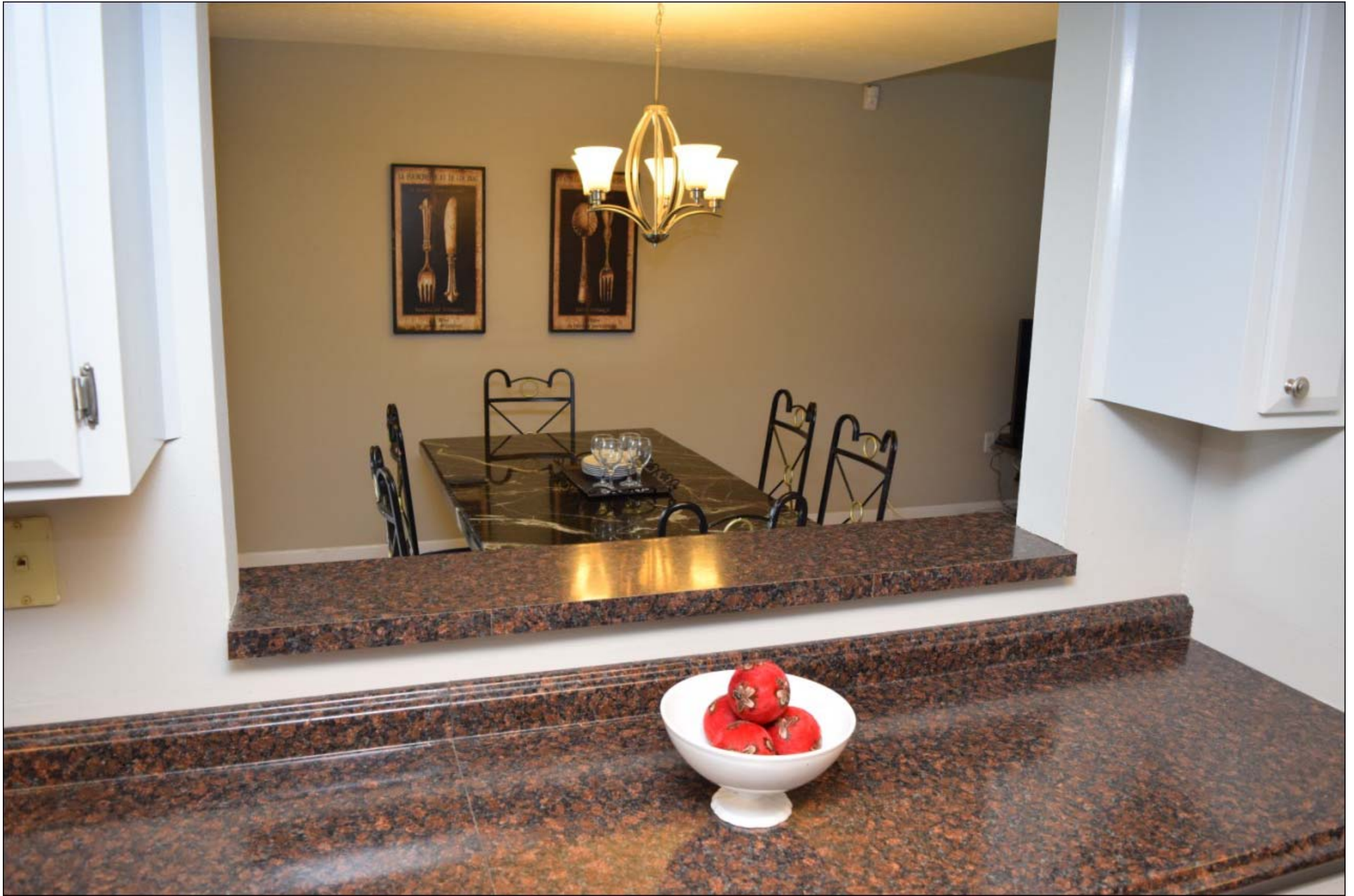
Serving hatch onto dining room