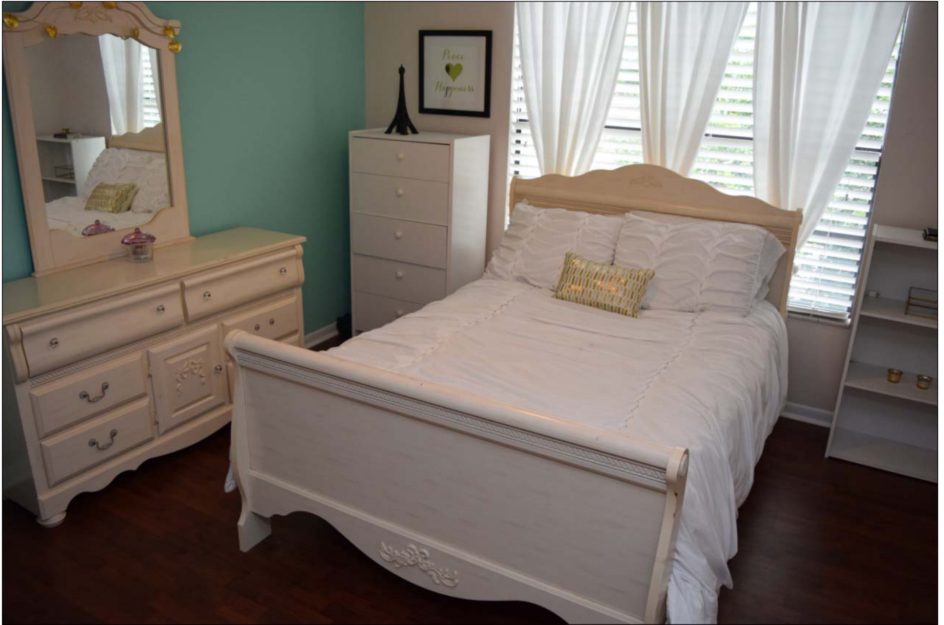
Bedroom 2 with large window bring in plenty natural light - 12 x 12