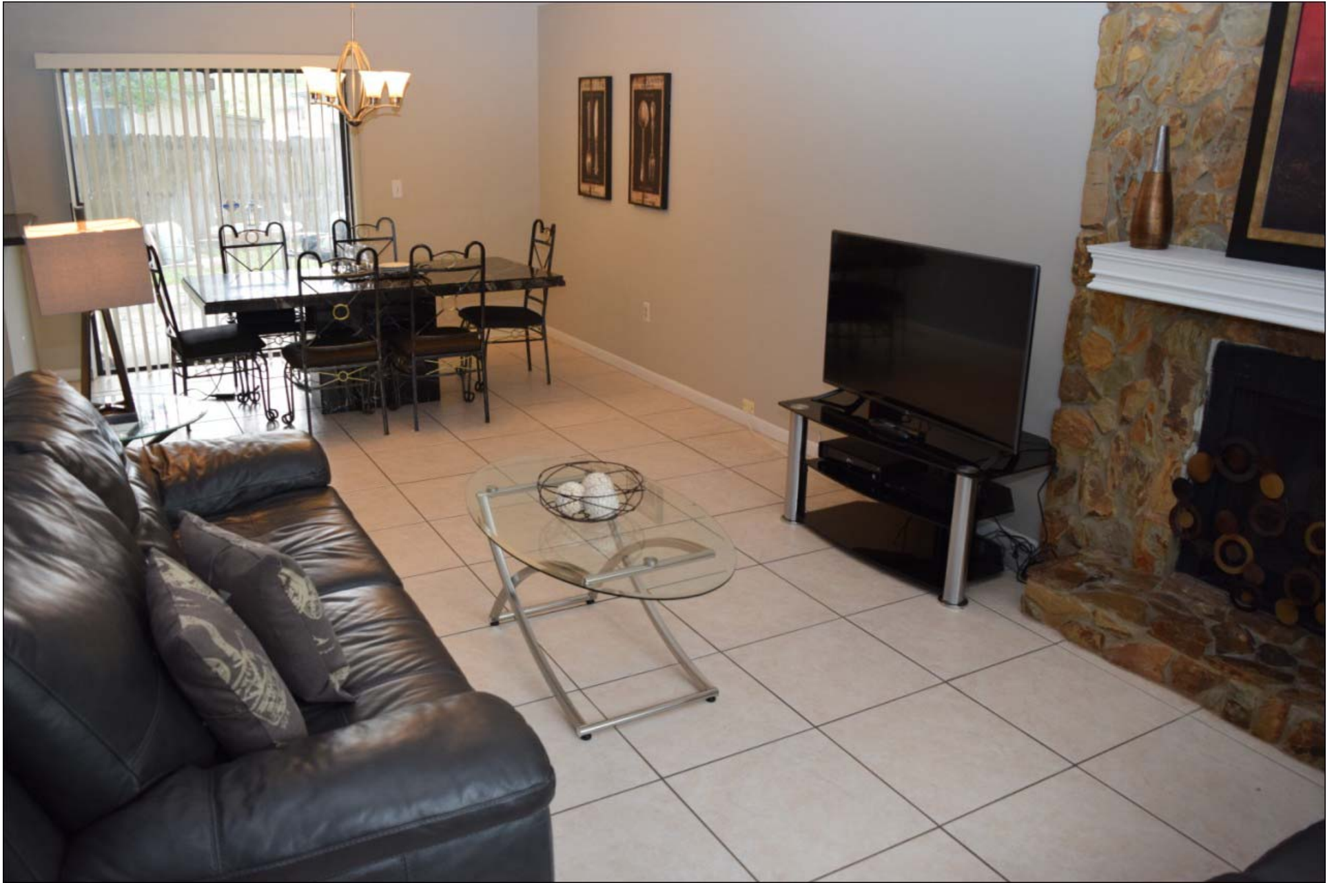
Living onto Dining room