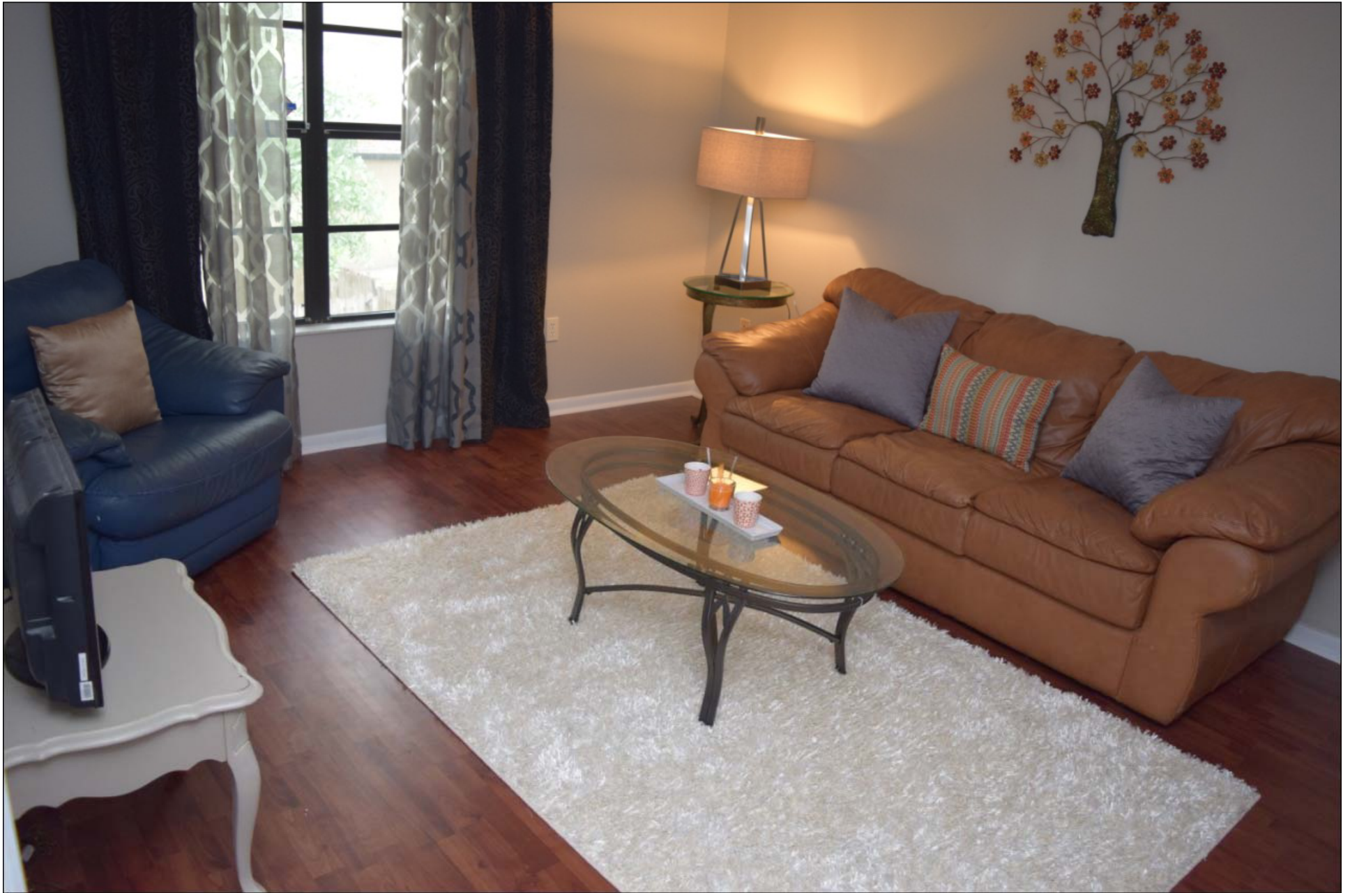
Large Loft or Family room or Bonus room or Office - 14 x 12