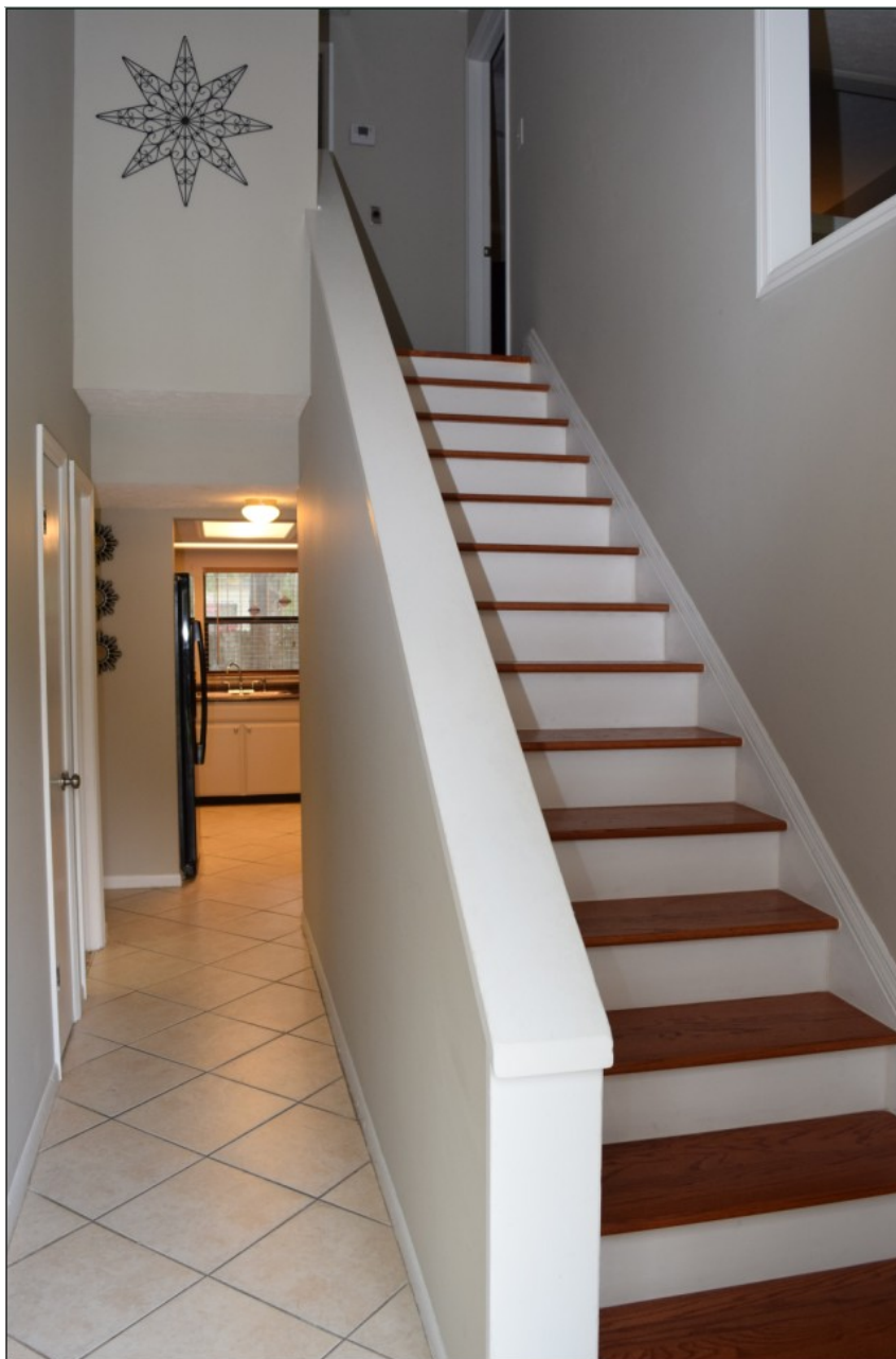
Stately wooden stairs