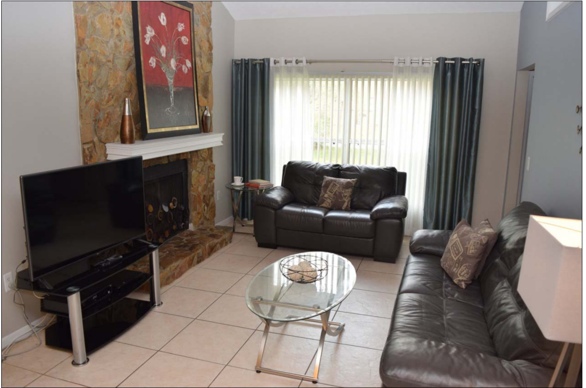
Living Room with front view, ceramic tile floors & wood burning fire place - 16 x 12