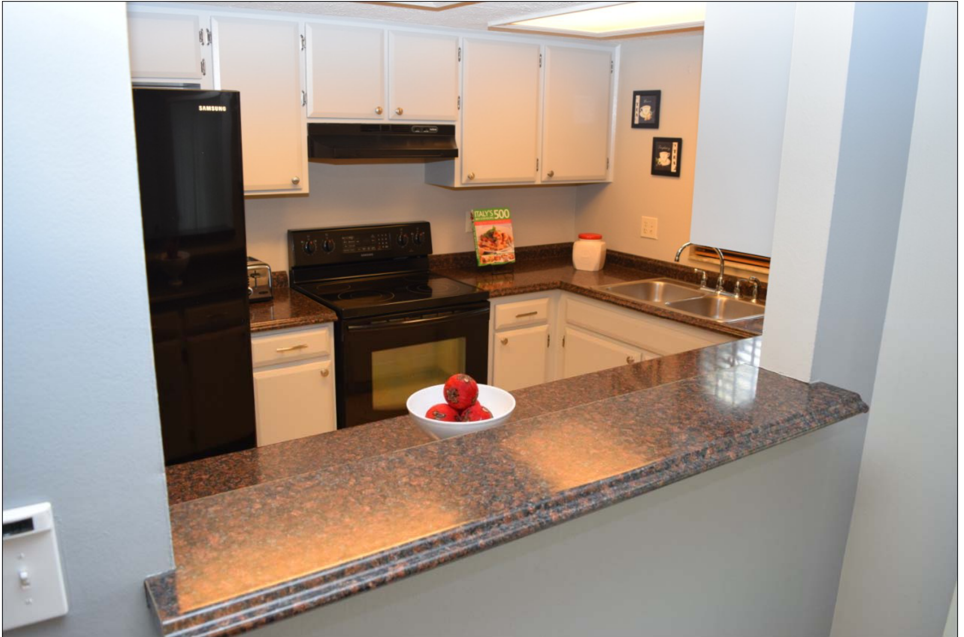
Serving hatch onto kitchen