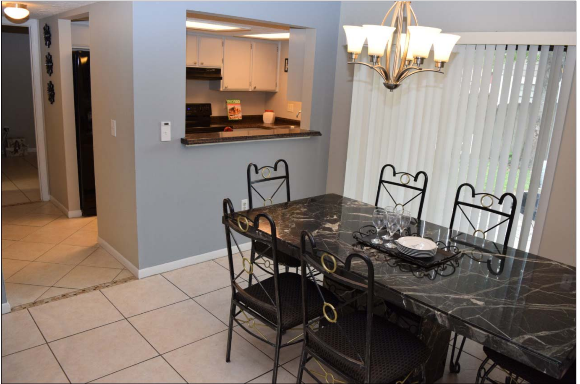
Dining room with serving hatch from kitchen