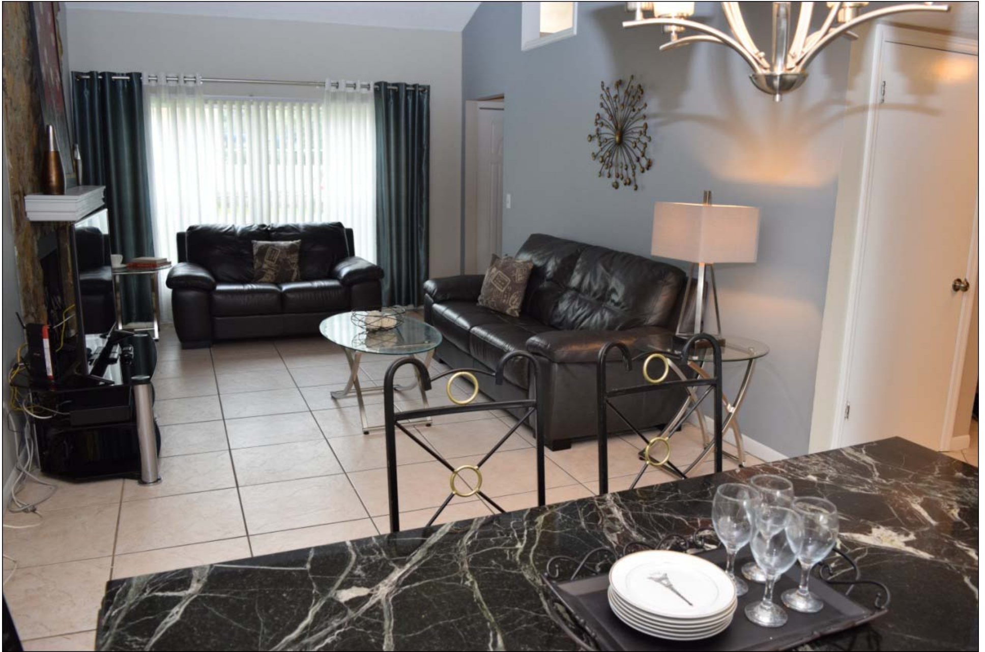
Dining onto Living room