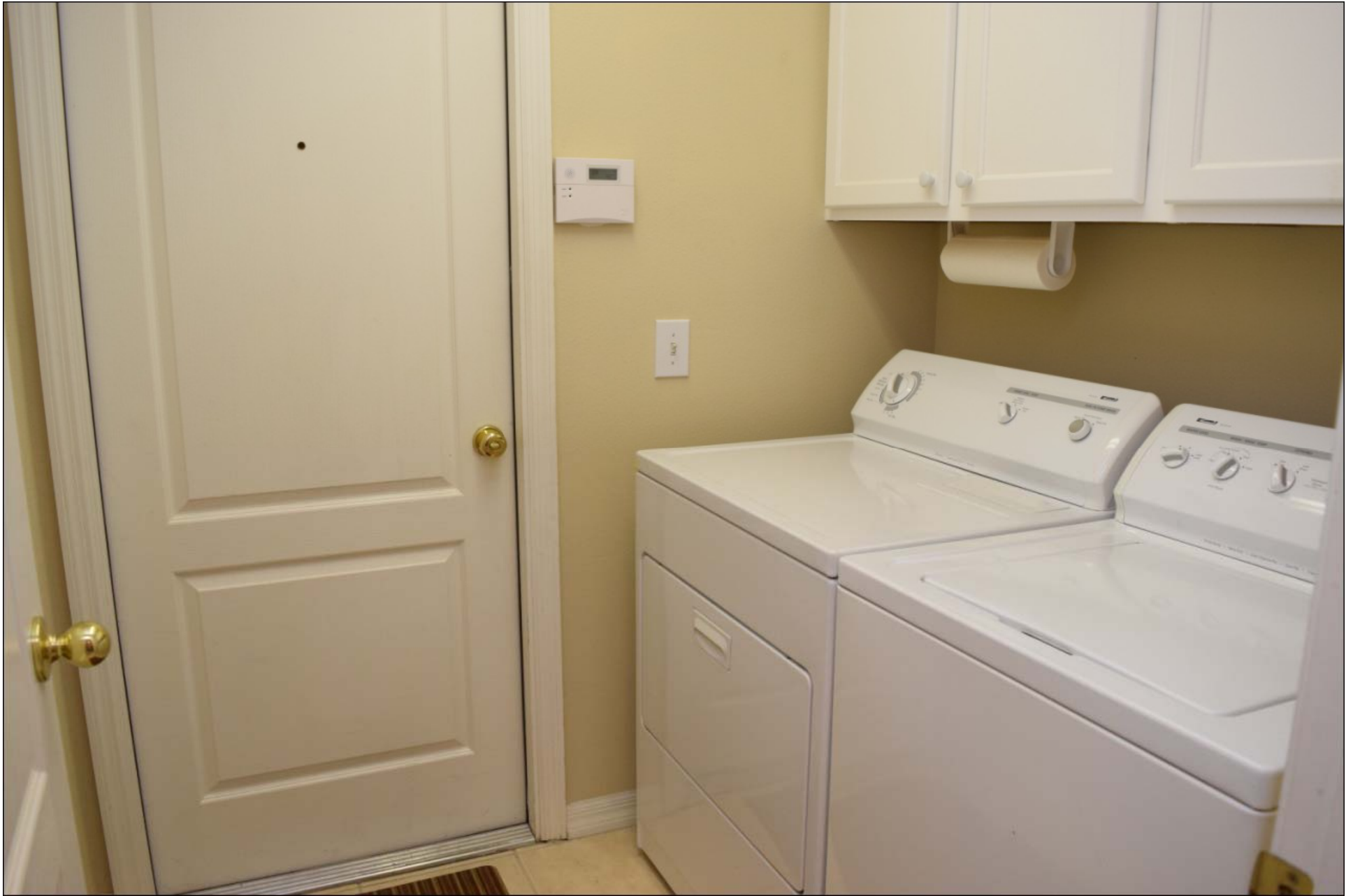
Laundry with storage cabinets