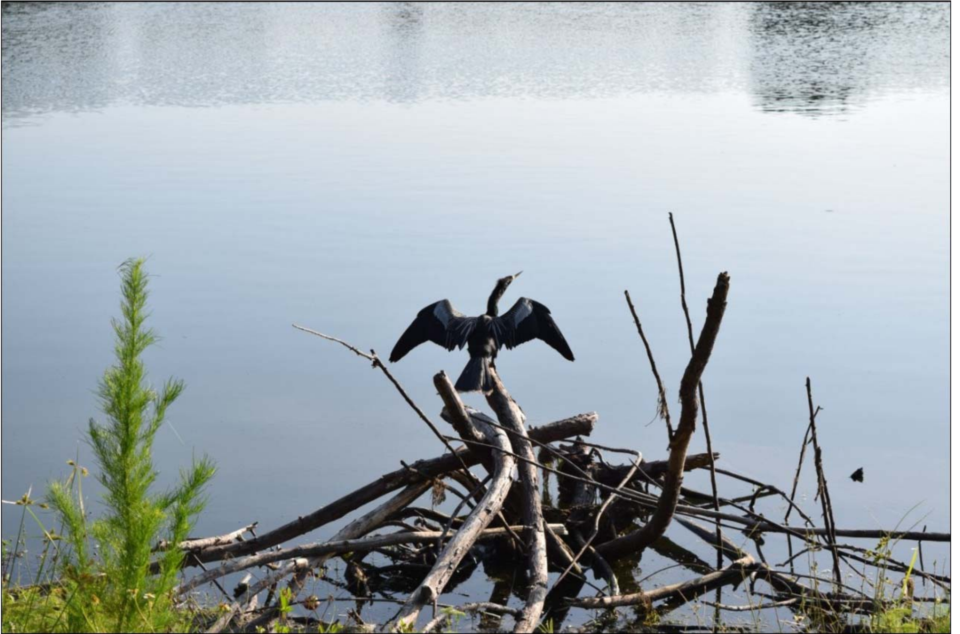
Fish & bird life abound