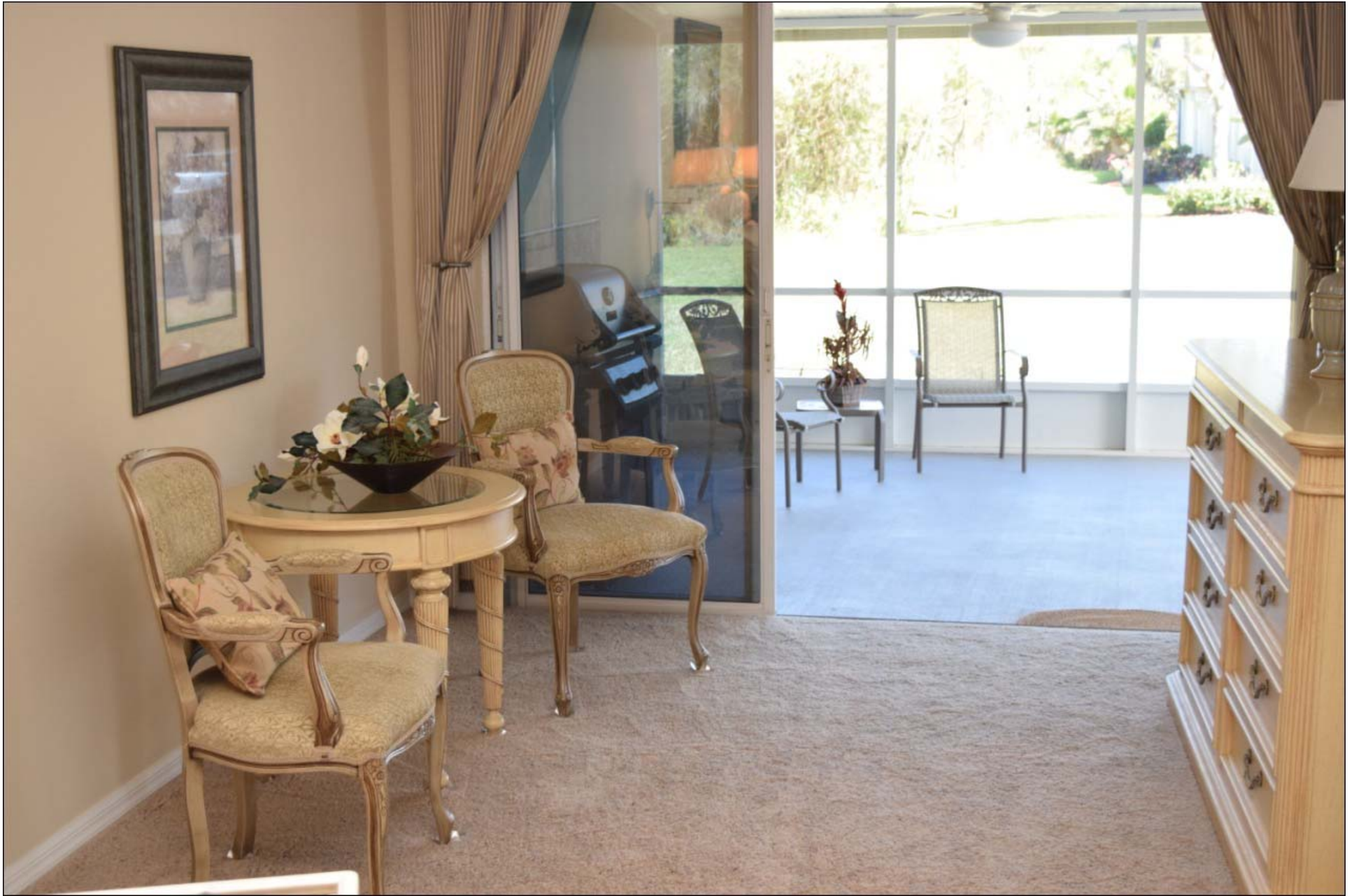
Sitting/Reading area in Master Bedroom with back view