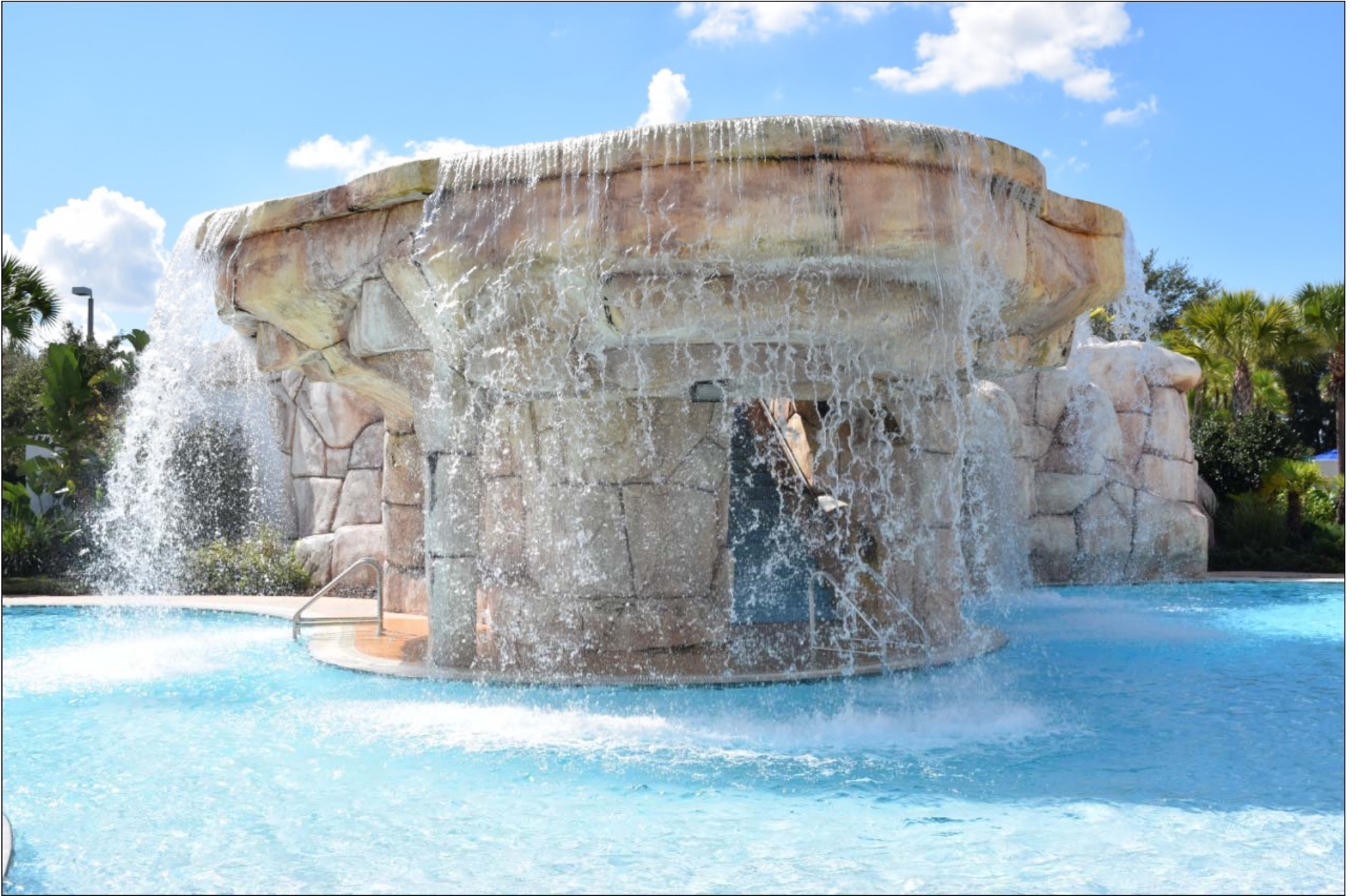
Steps to pool slide