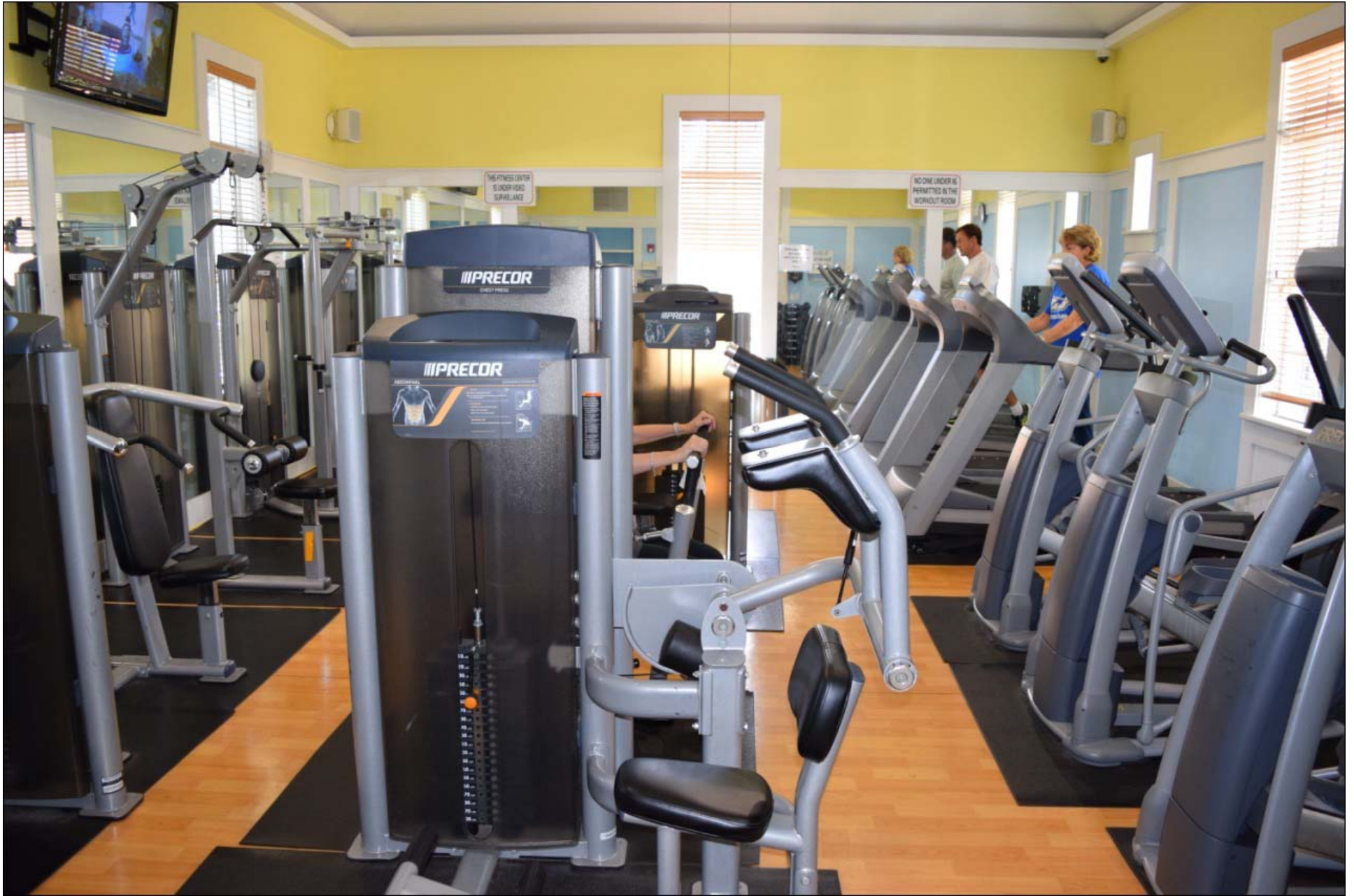
Well fitted Gym