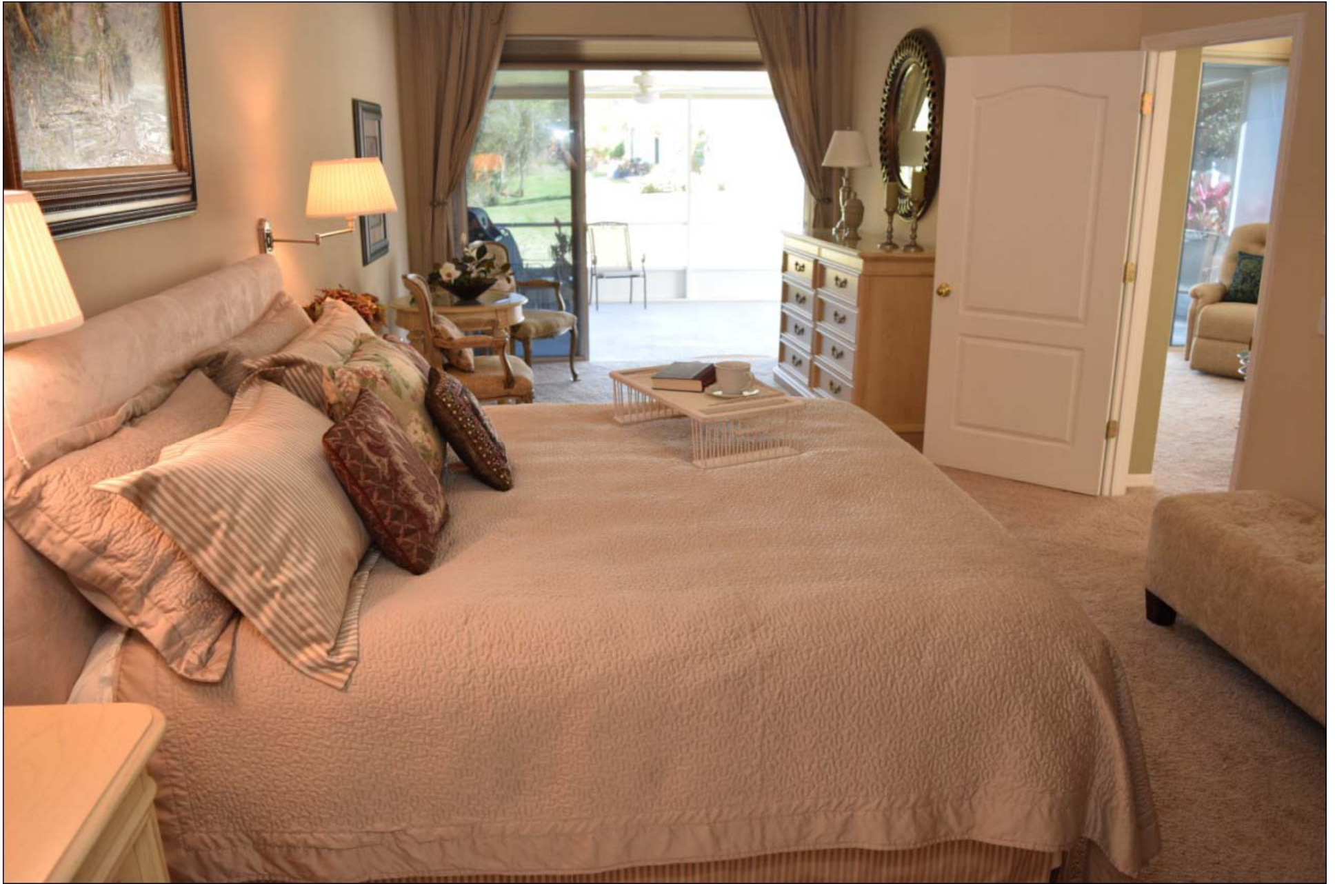
Large Master Bedroom 24' x 13'