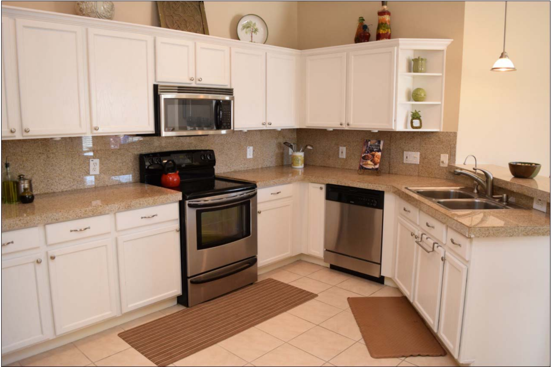
Kitchen with matching stainless steel appliances