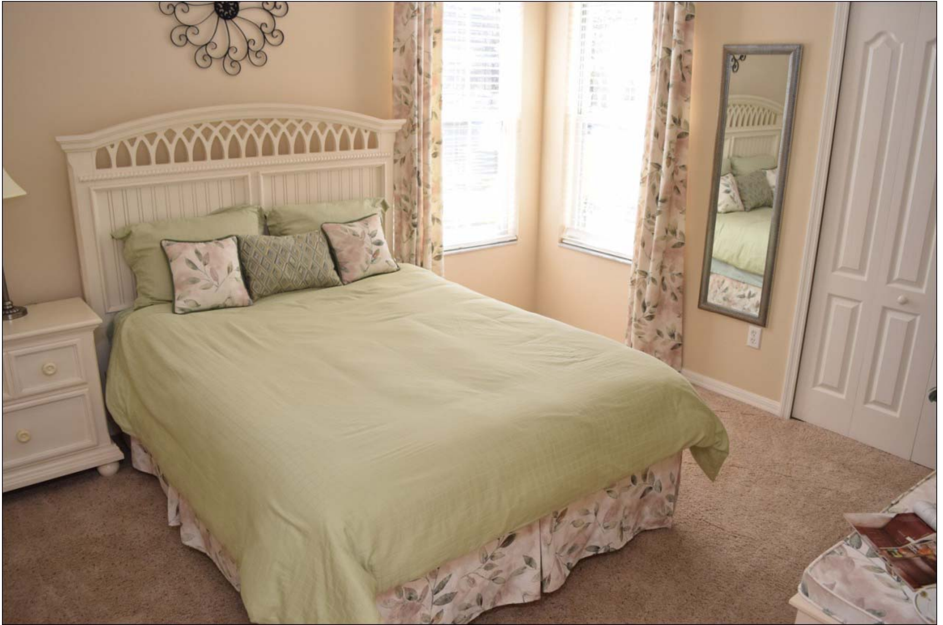
Bedroom 2 – 11' x 11'