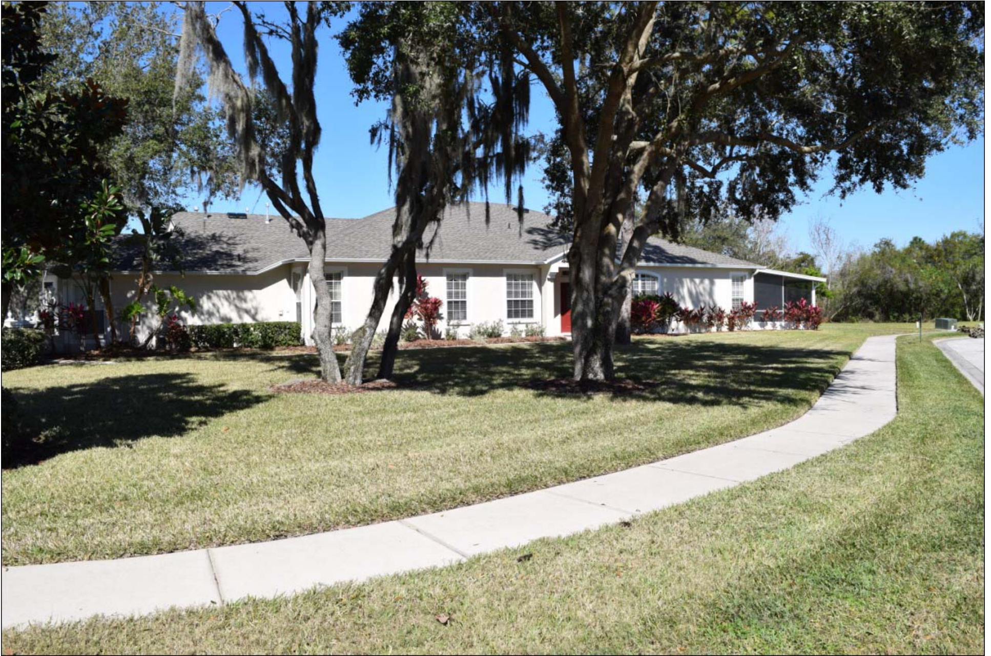
Side View – mature Oak trees