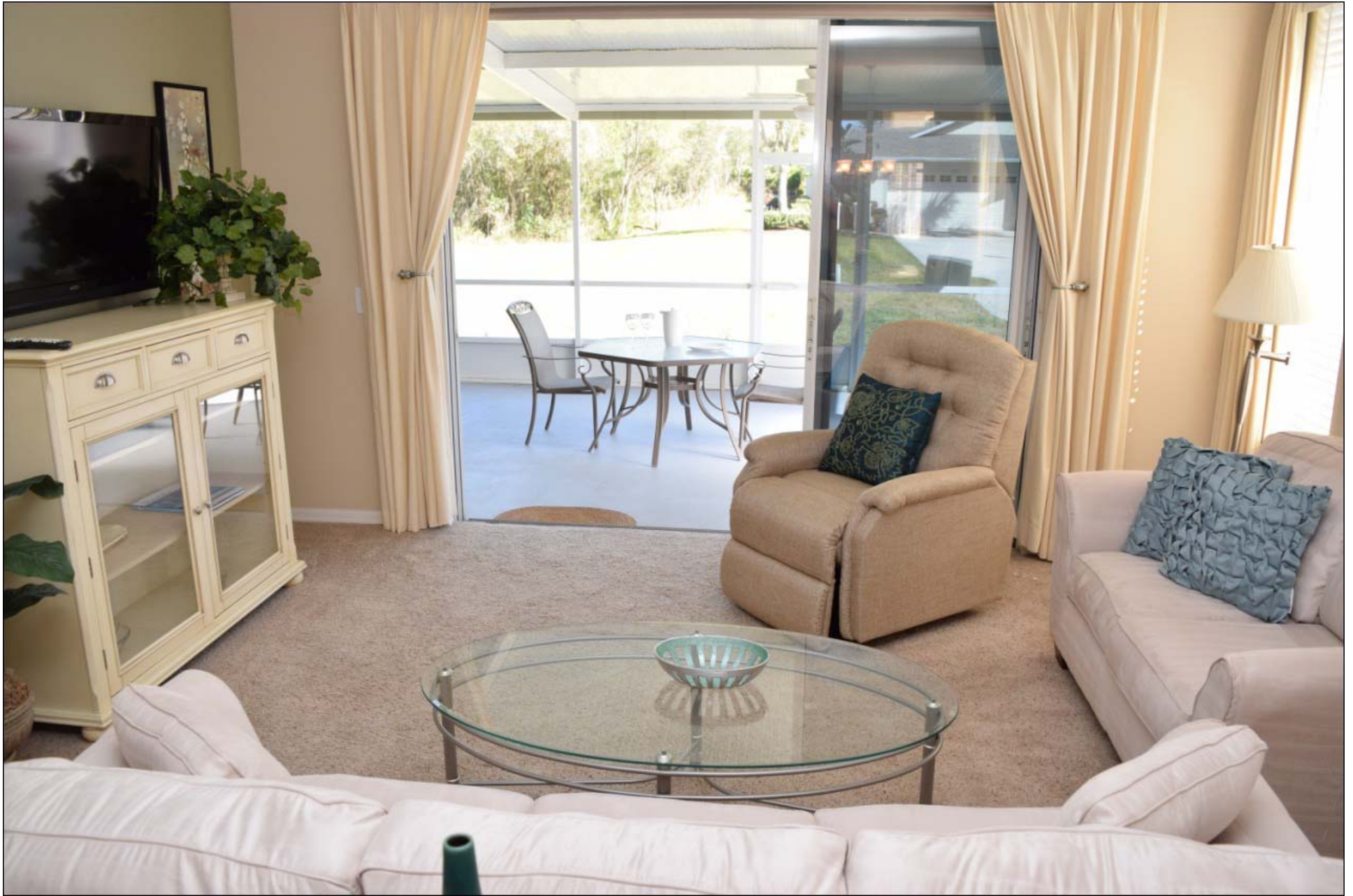
Formal Living Room onto Large Patio/Lanai