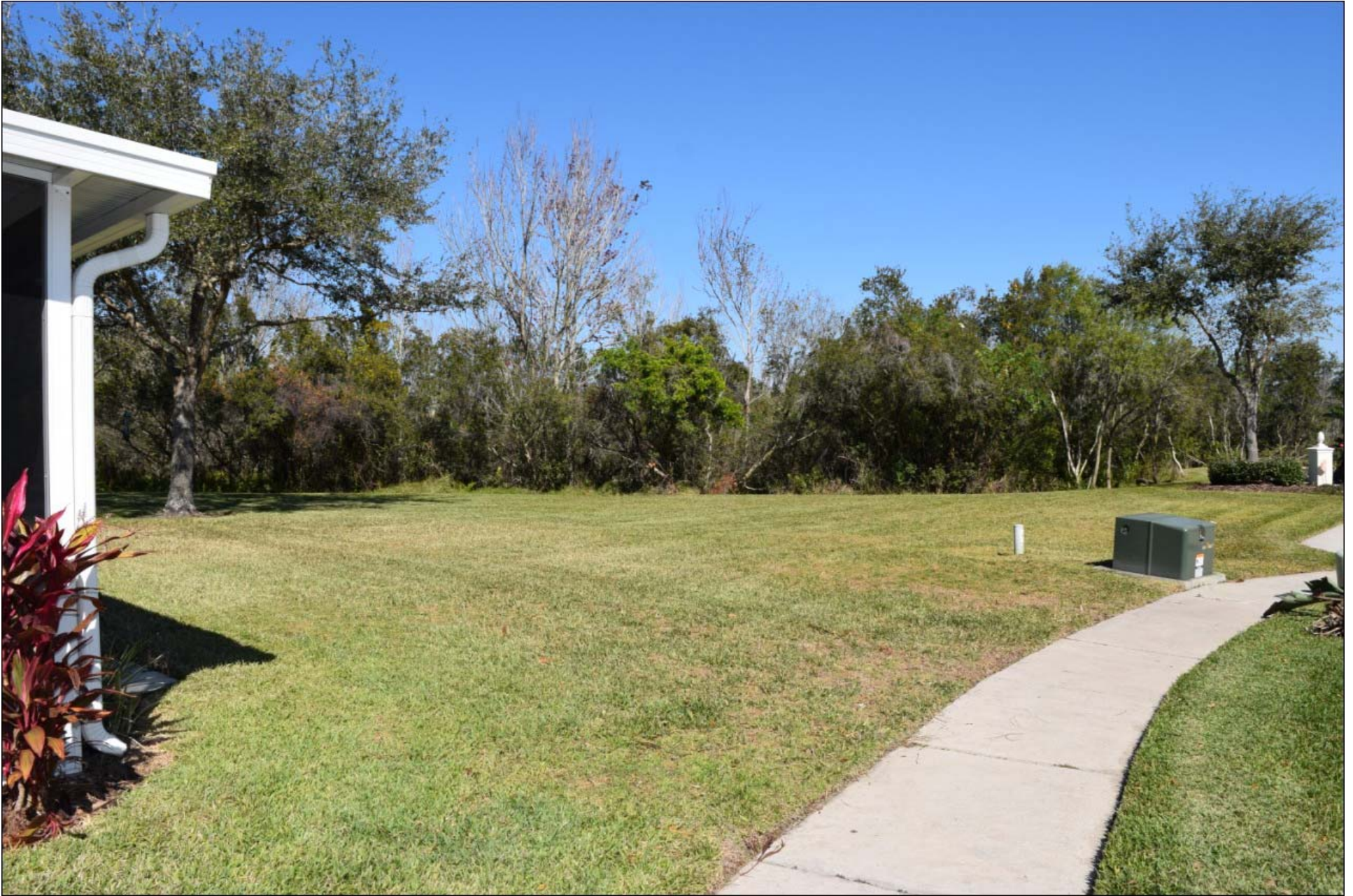
Back Conservation View