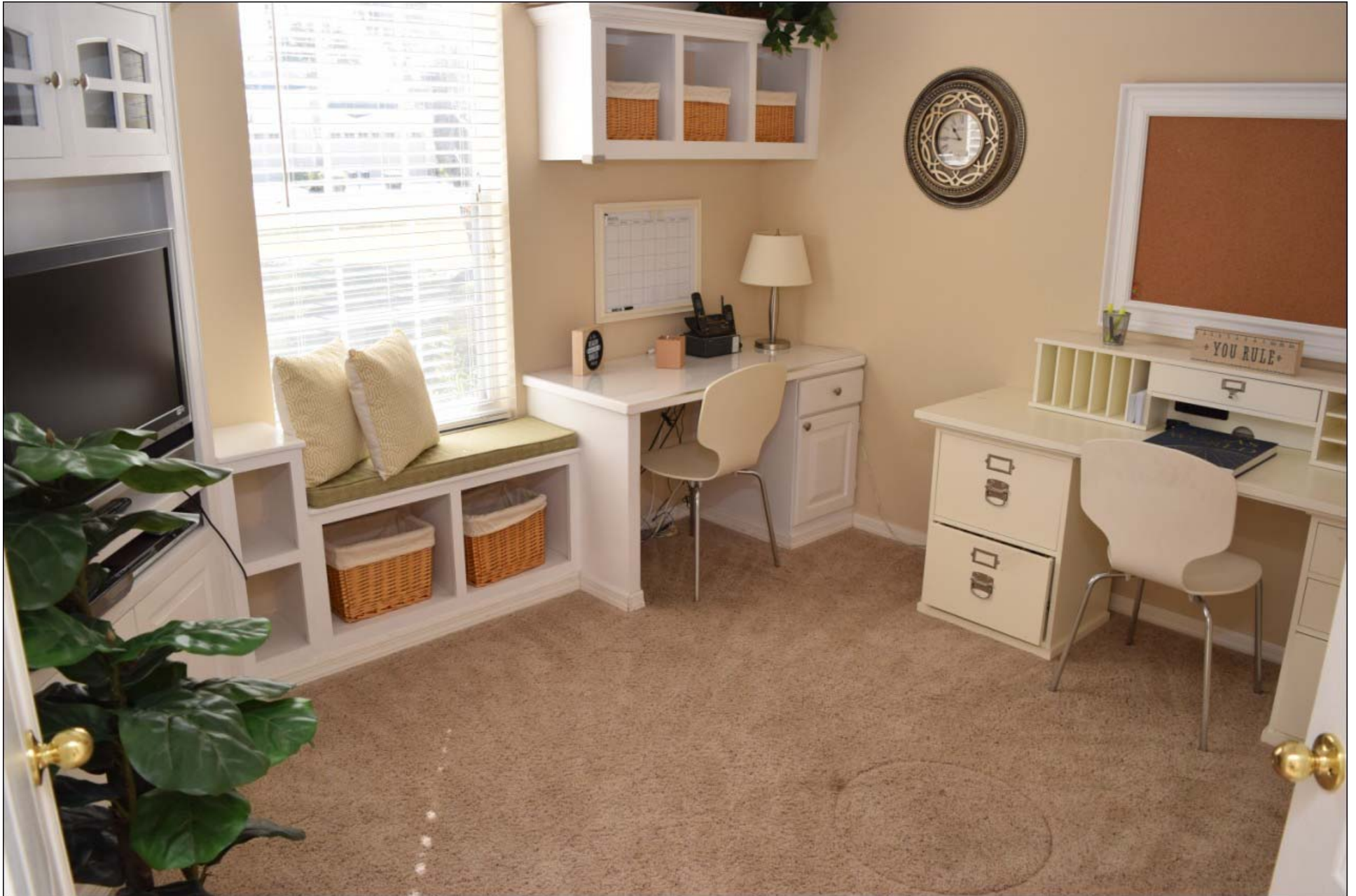
Fitted Office (or Bedroom 3) – 12' x 11'