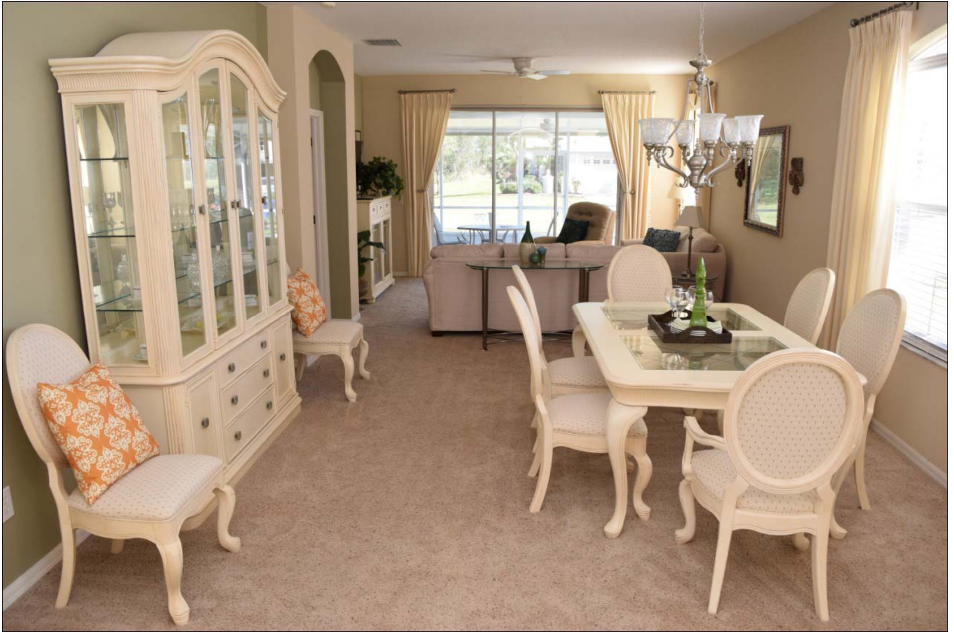
Dining Room w/ plush carpeting & natural light 14' x 12'