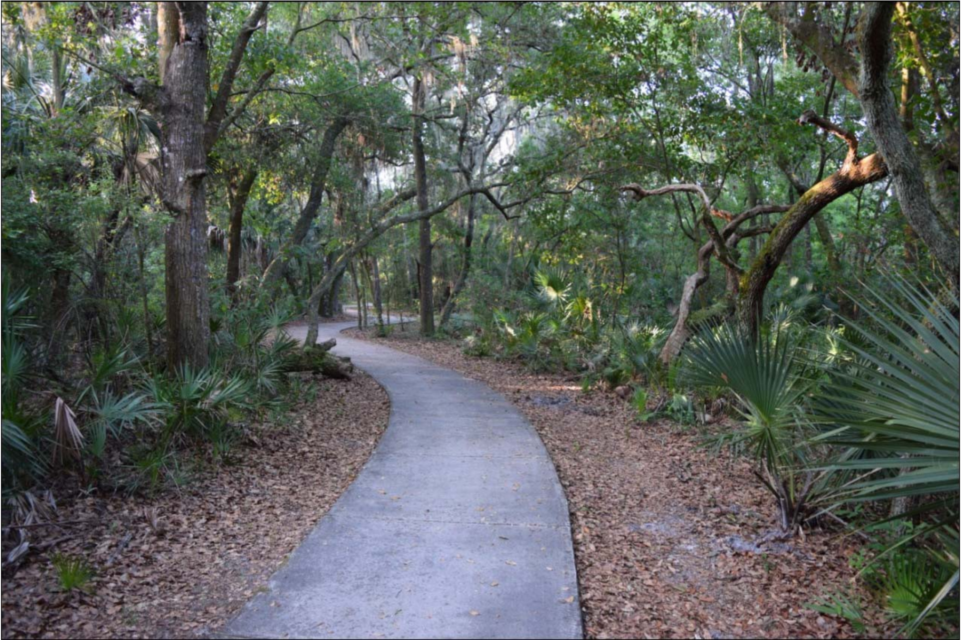
Wooded walking trails - a dog's paradise