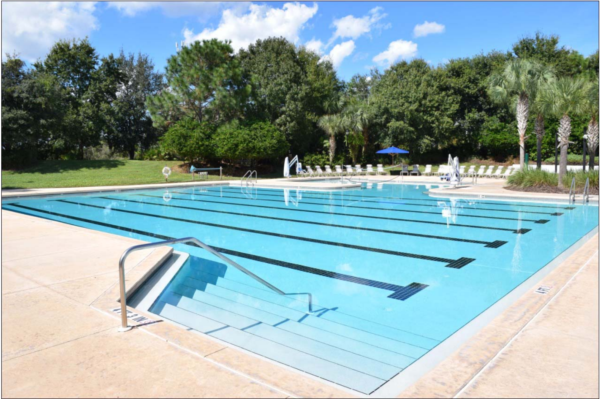
Swimming & Volleyball Pool