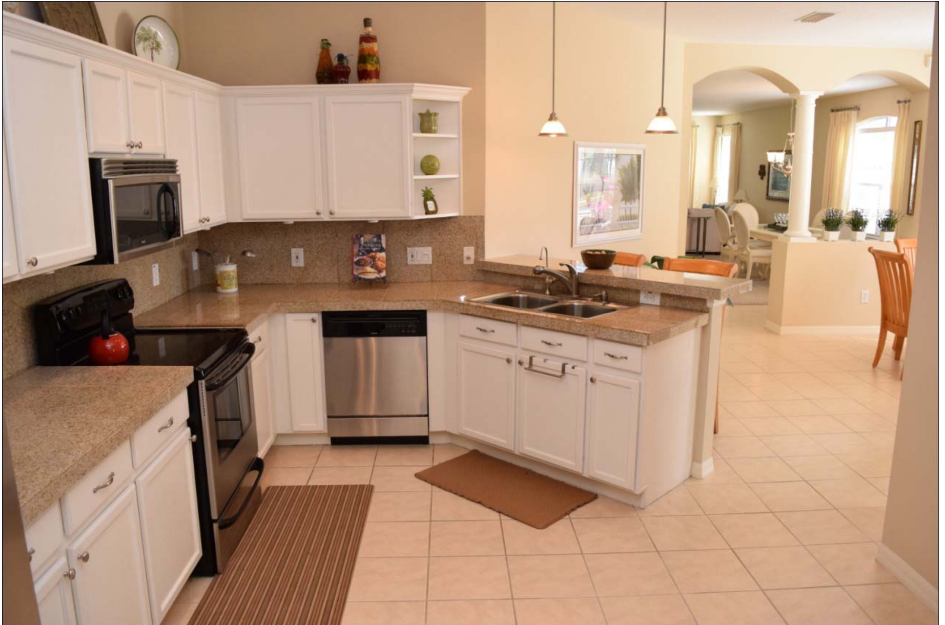
Kitchen with Crown Molding 15' x 12'