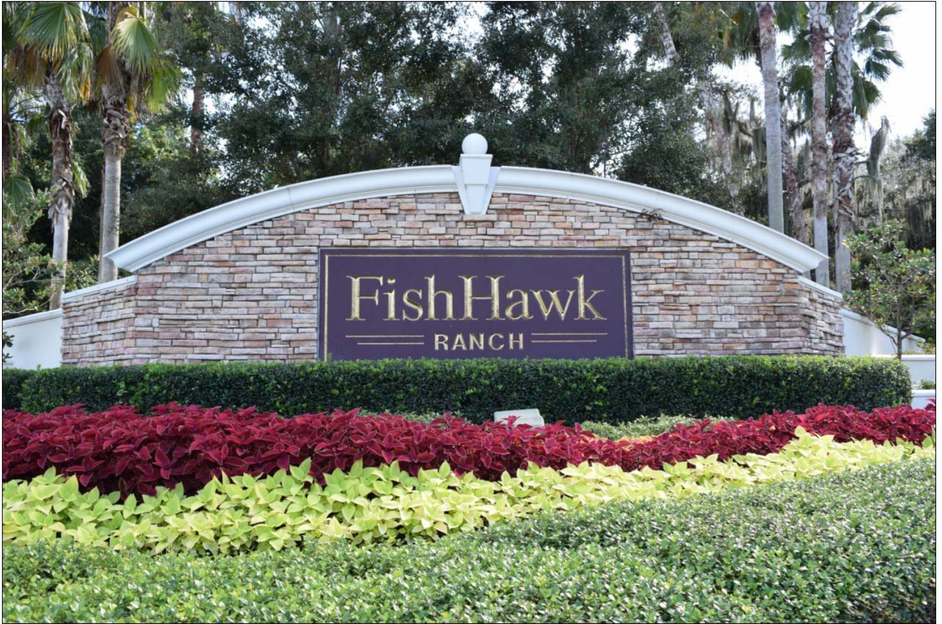
FishHawk Ranch – Tampa's #1 sought after community