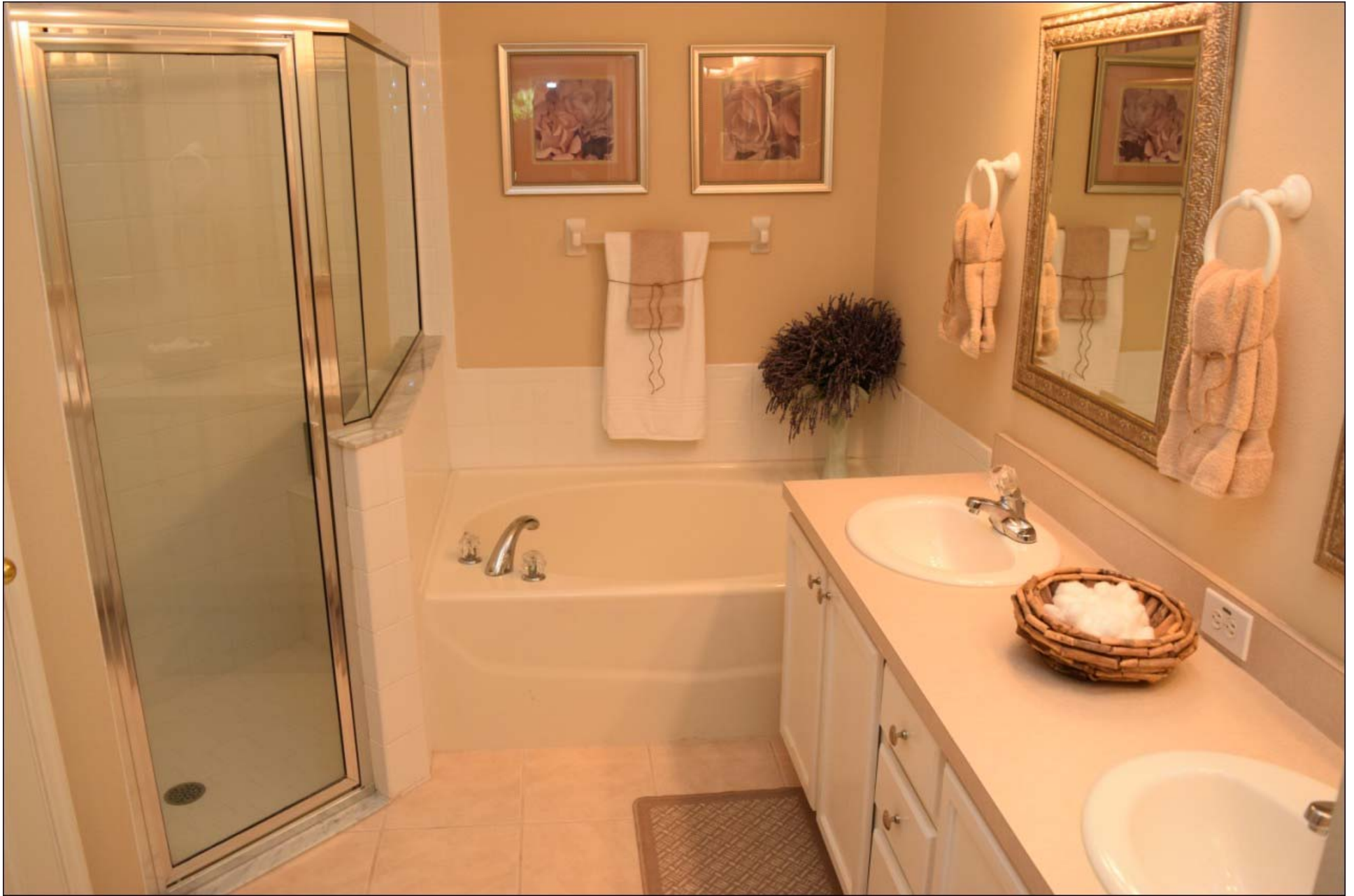
Master Bathroom w/ dual sinks, garden tub, shower & W.C.