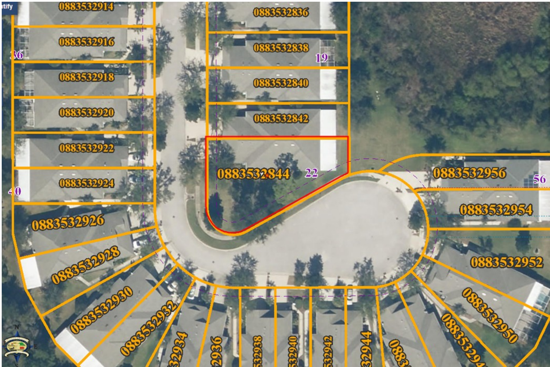
Aerial View – Double Lot