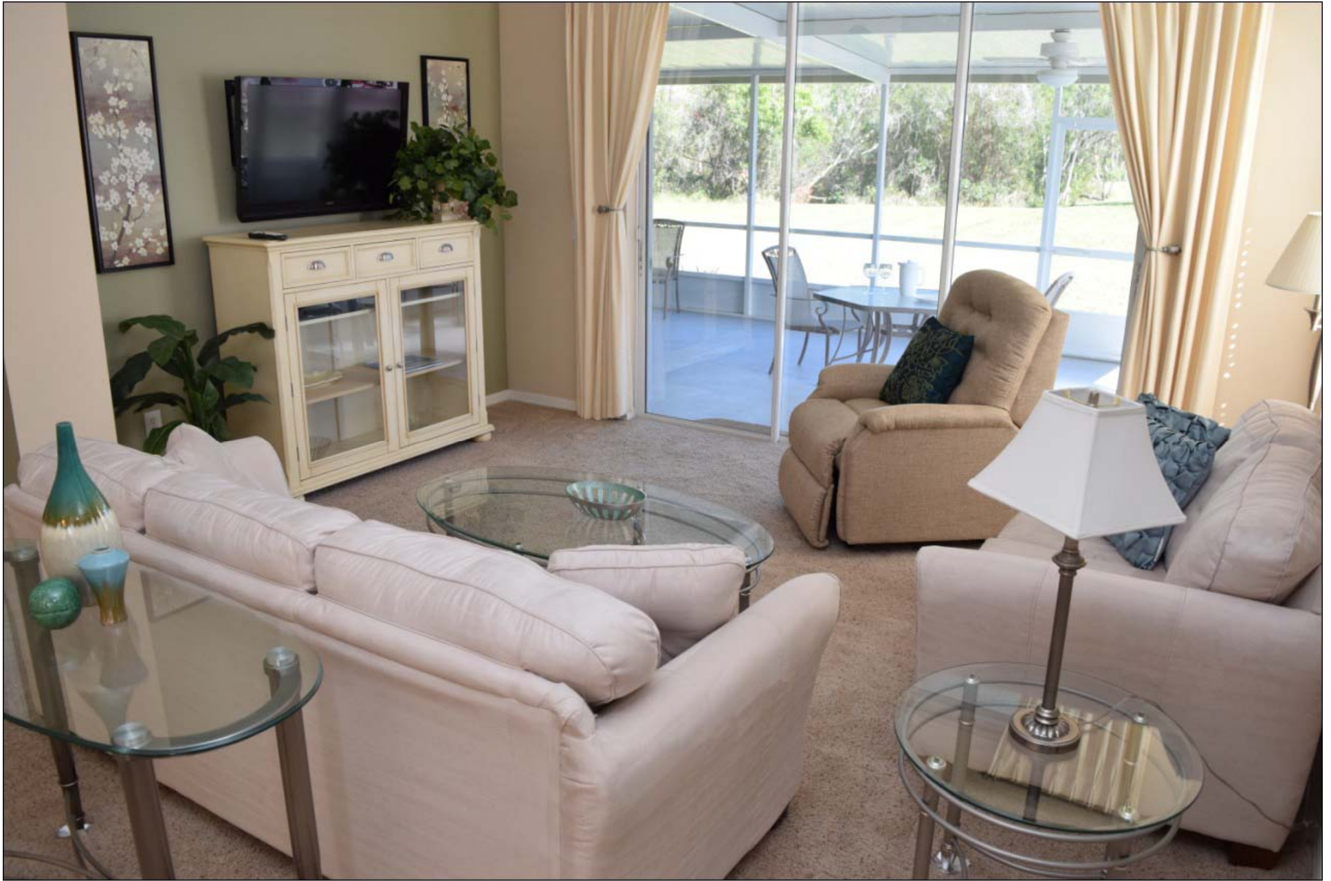
Formal Living Room 17' x 14'