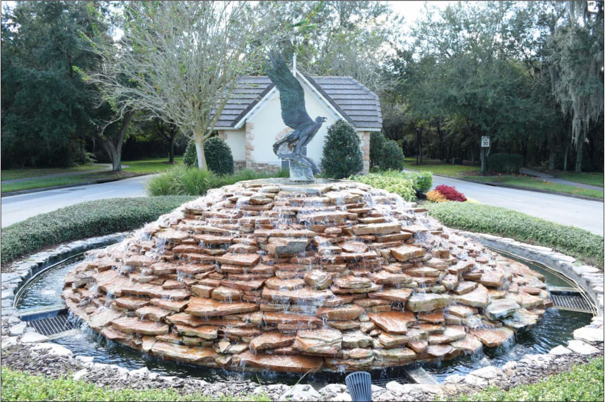
FishHawk Ranch fountain entrance