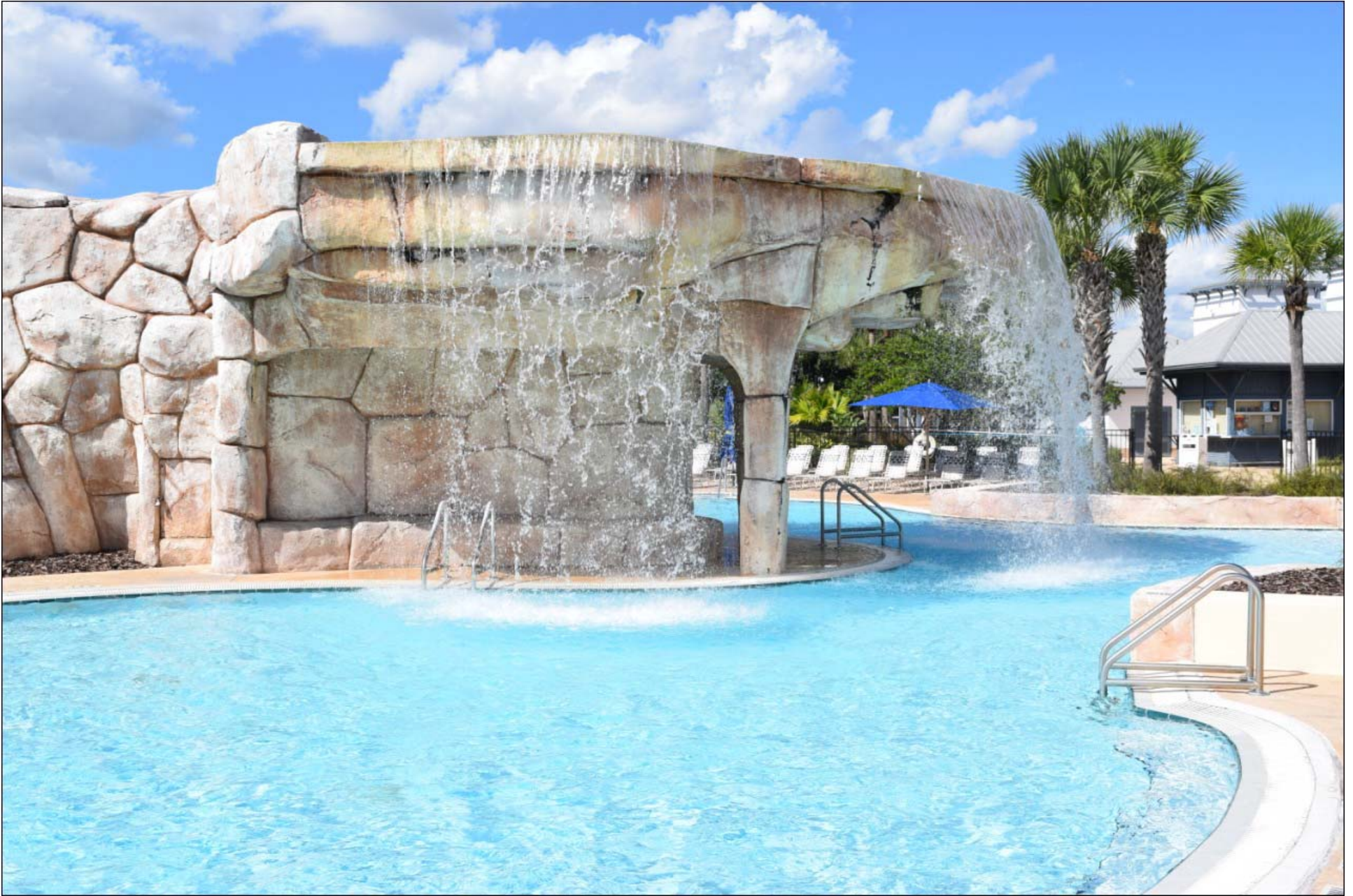
Community Play Pool