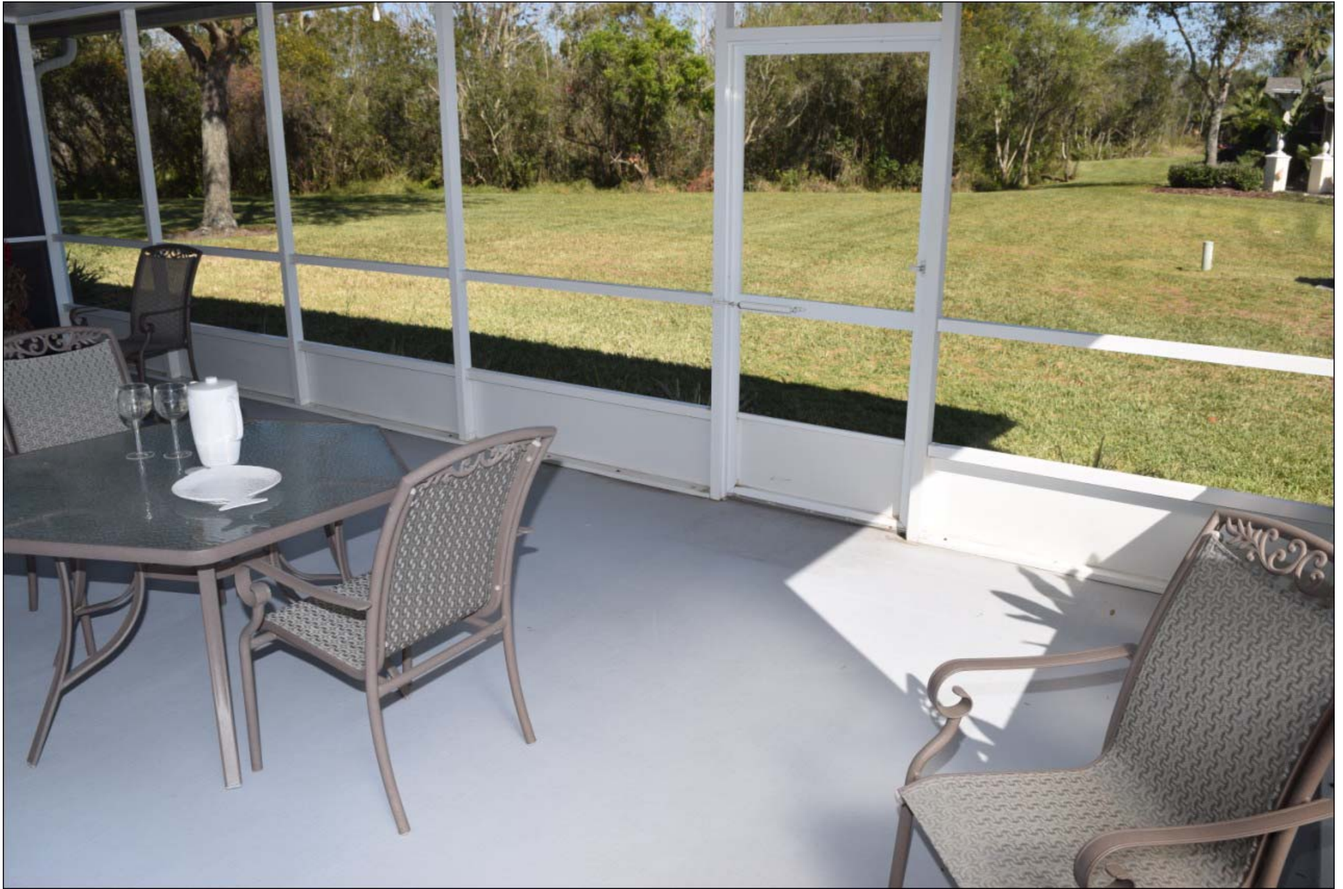
Large Back Patio with open back conservation view 27' x 12'