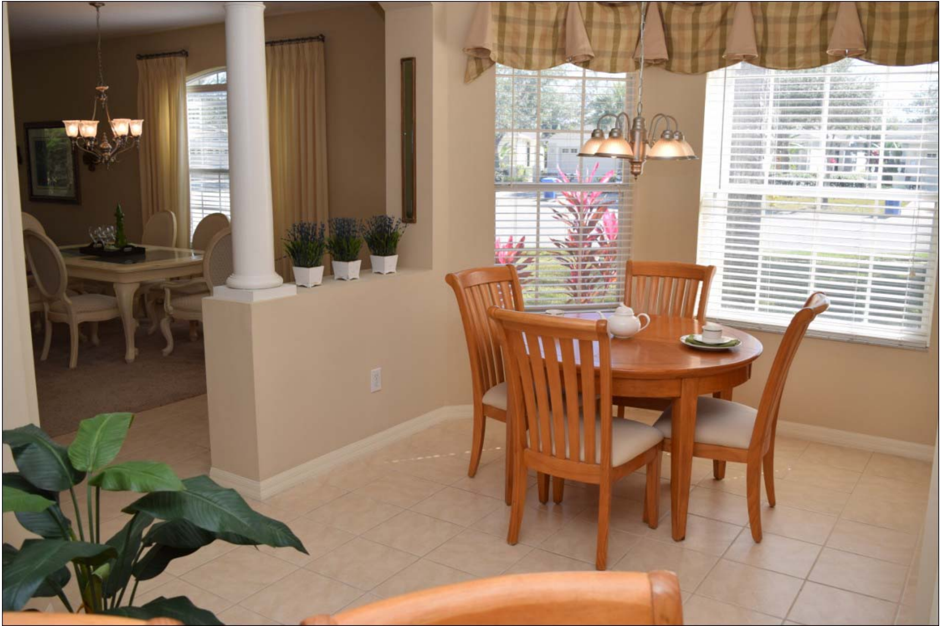
Dinette 10' x 9'