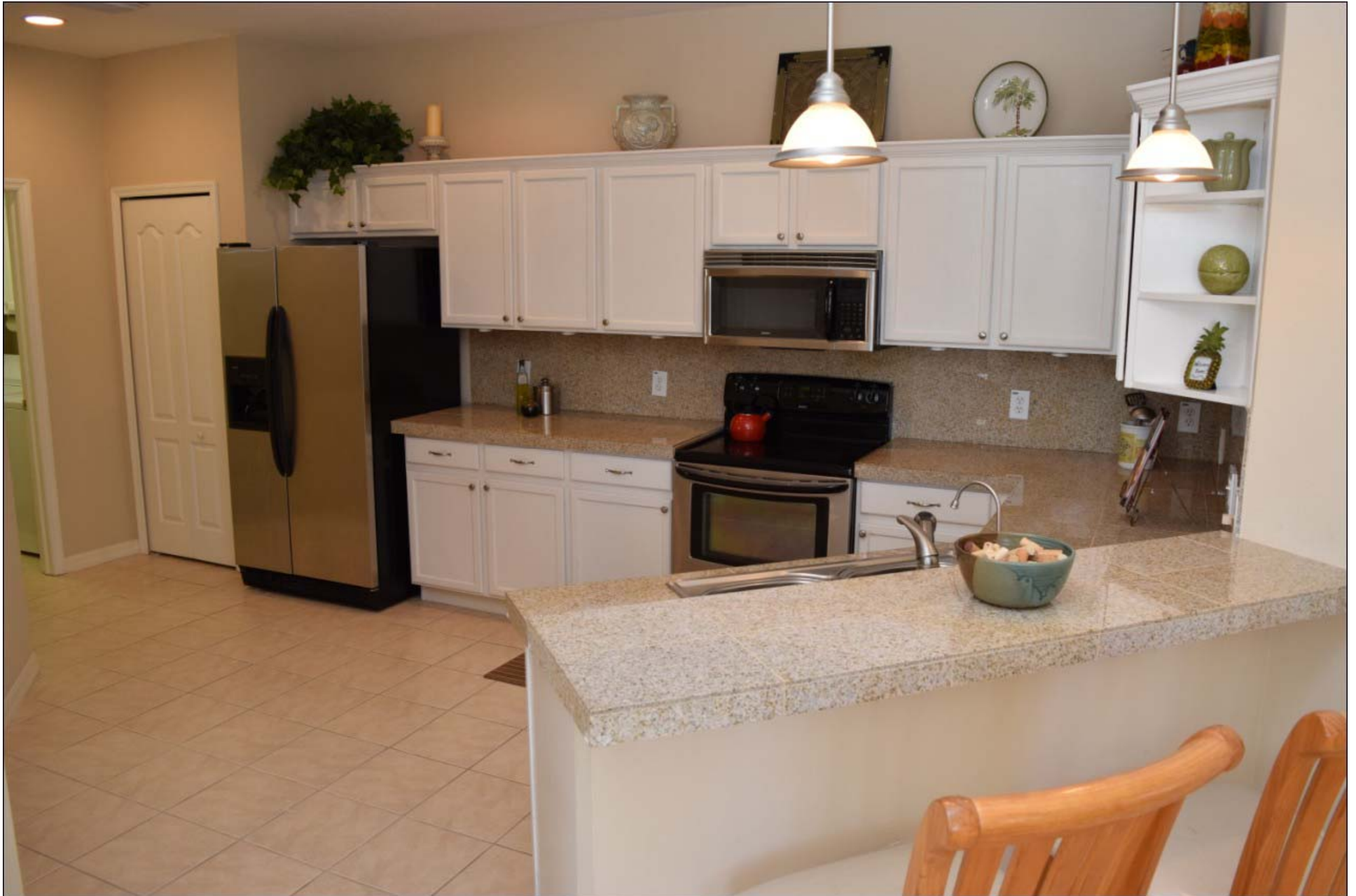
Kitchen with generous cabinets, counter space & pantry