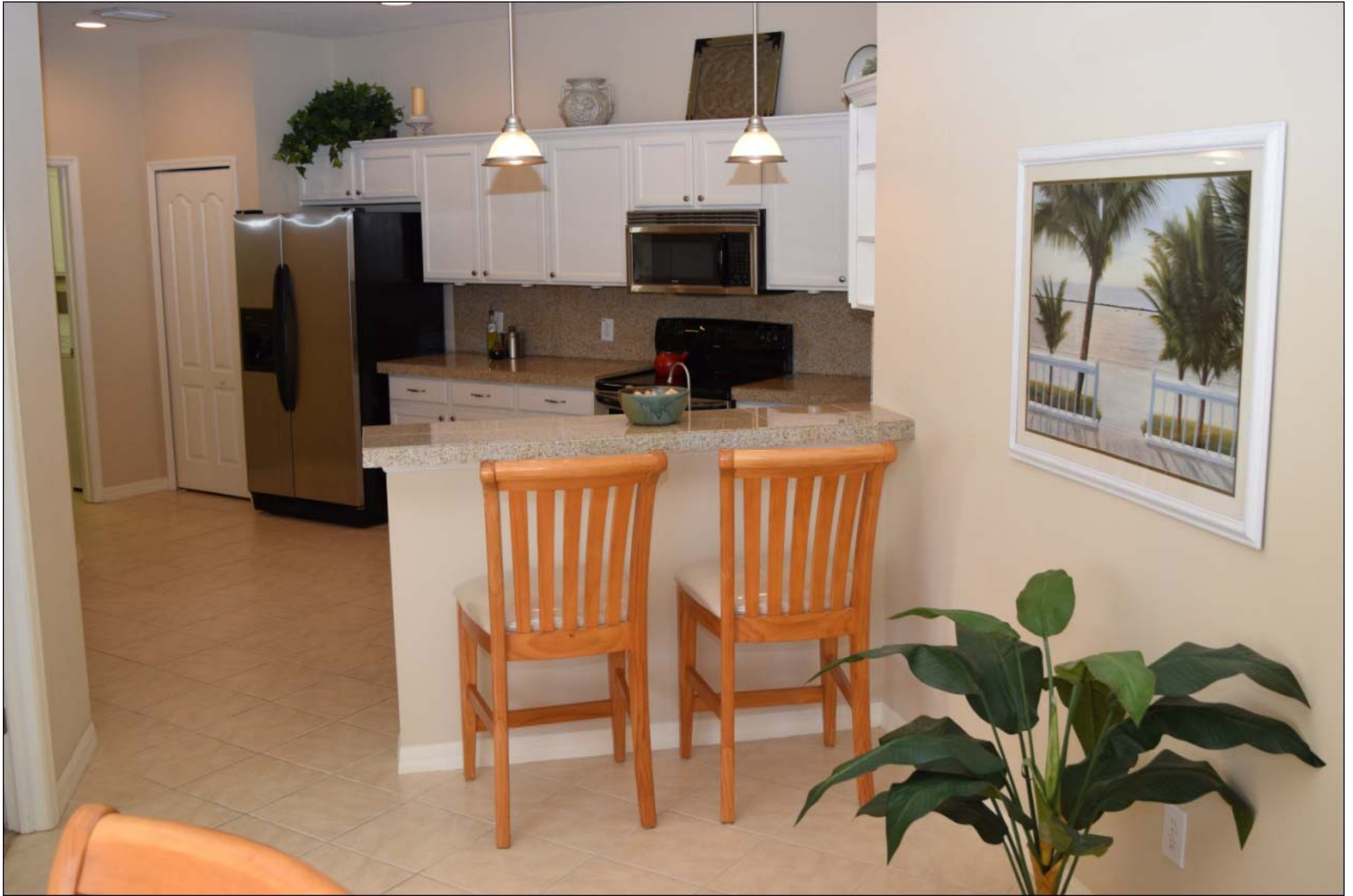
Breakfast Bar in Kitchen