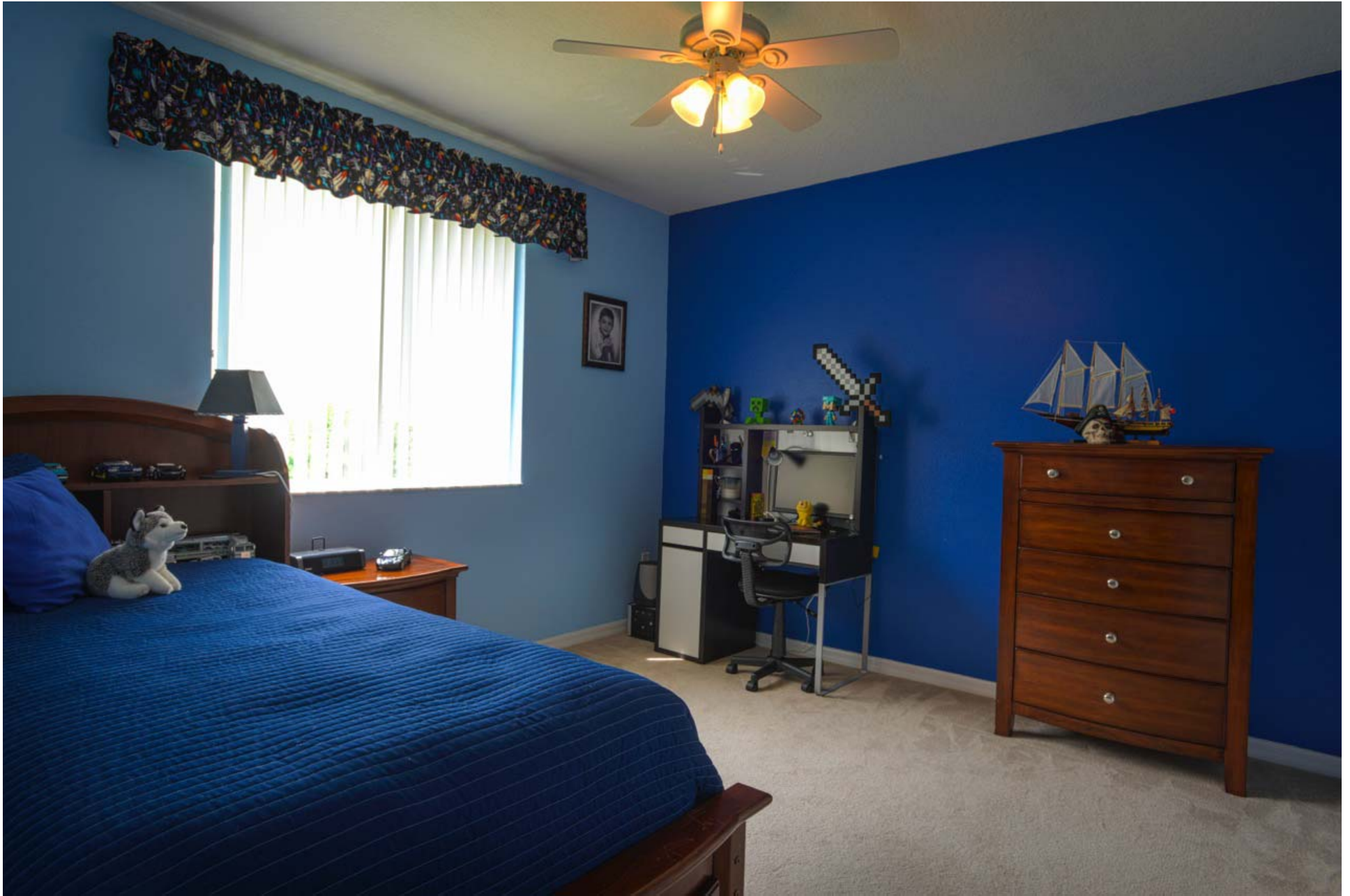
Bedroom 3 – 11' x 10'