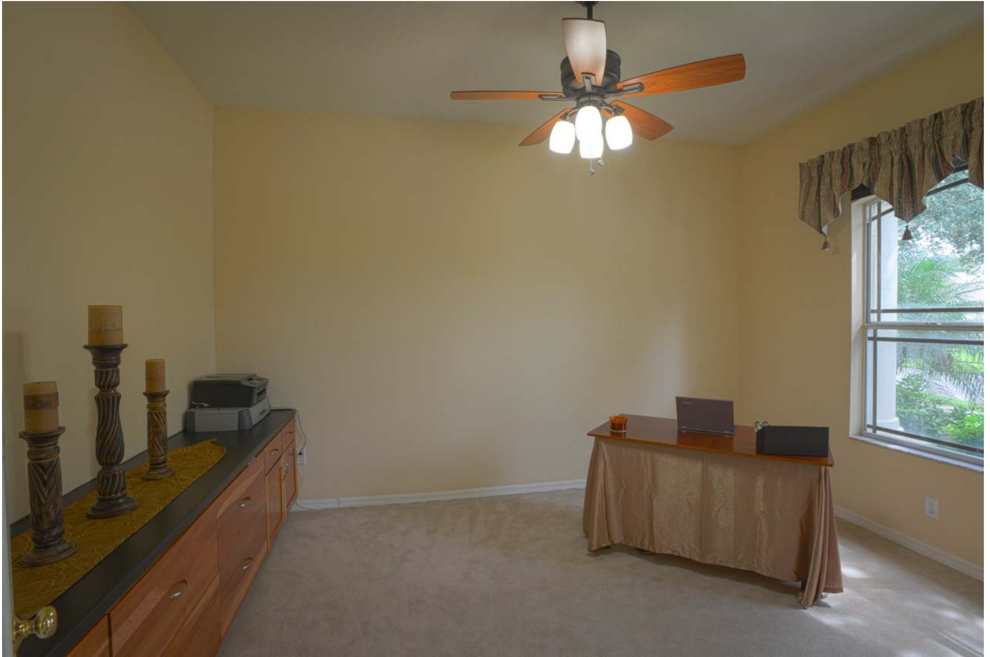
Front View Office 14' x 10'