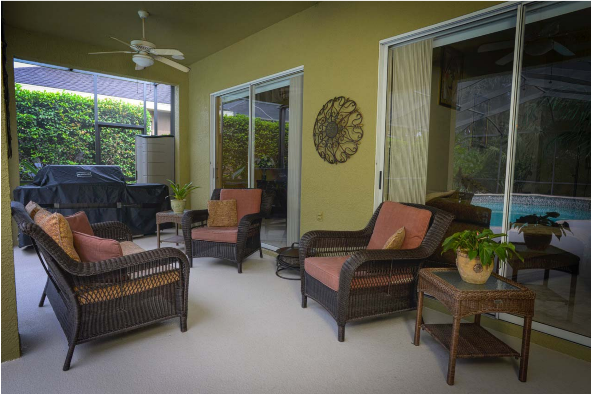
Covered Patio – in-line gas grill