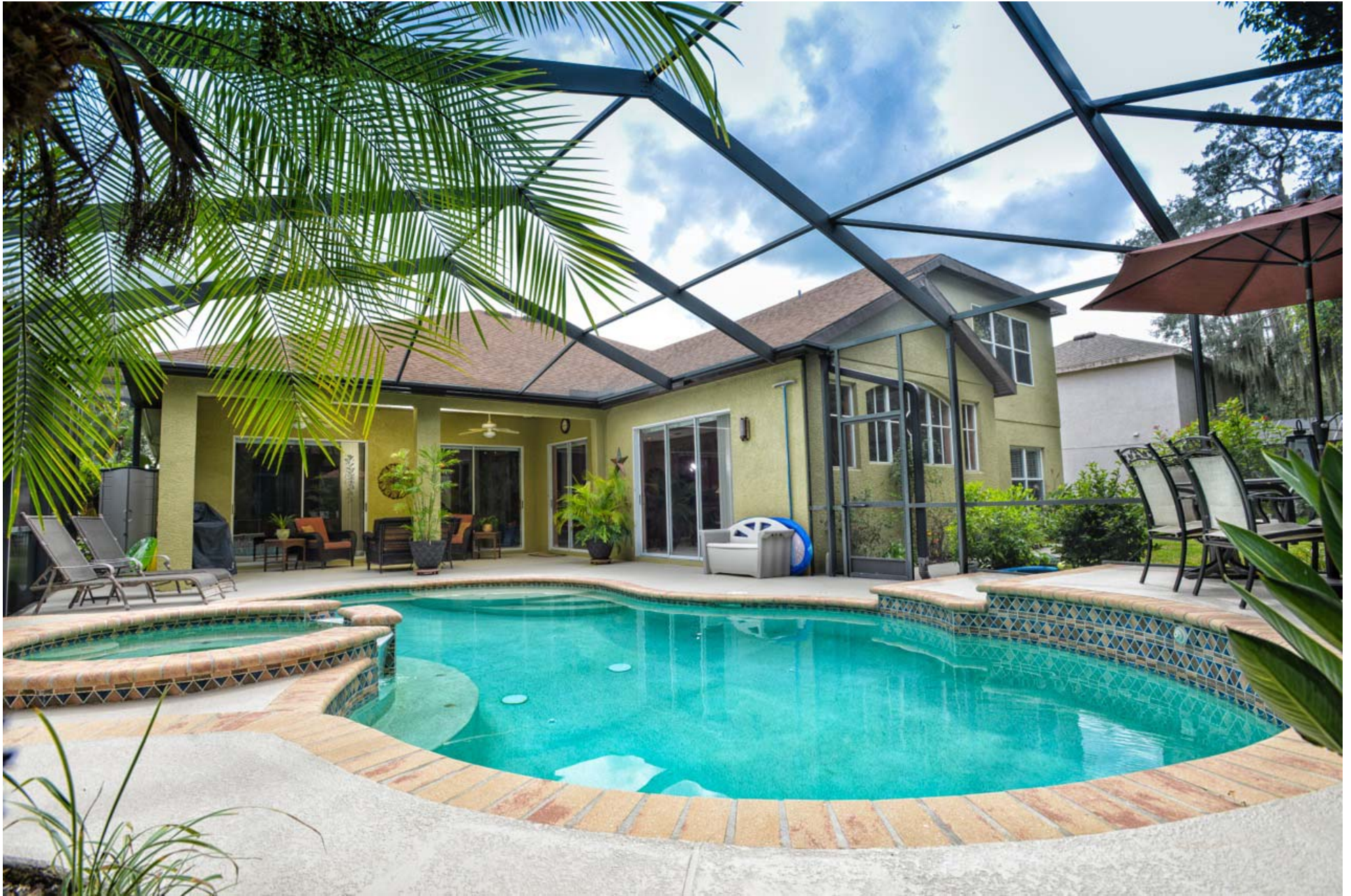
Pool, Spa & Lanai