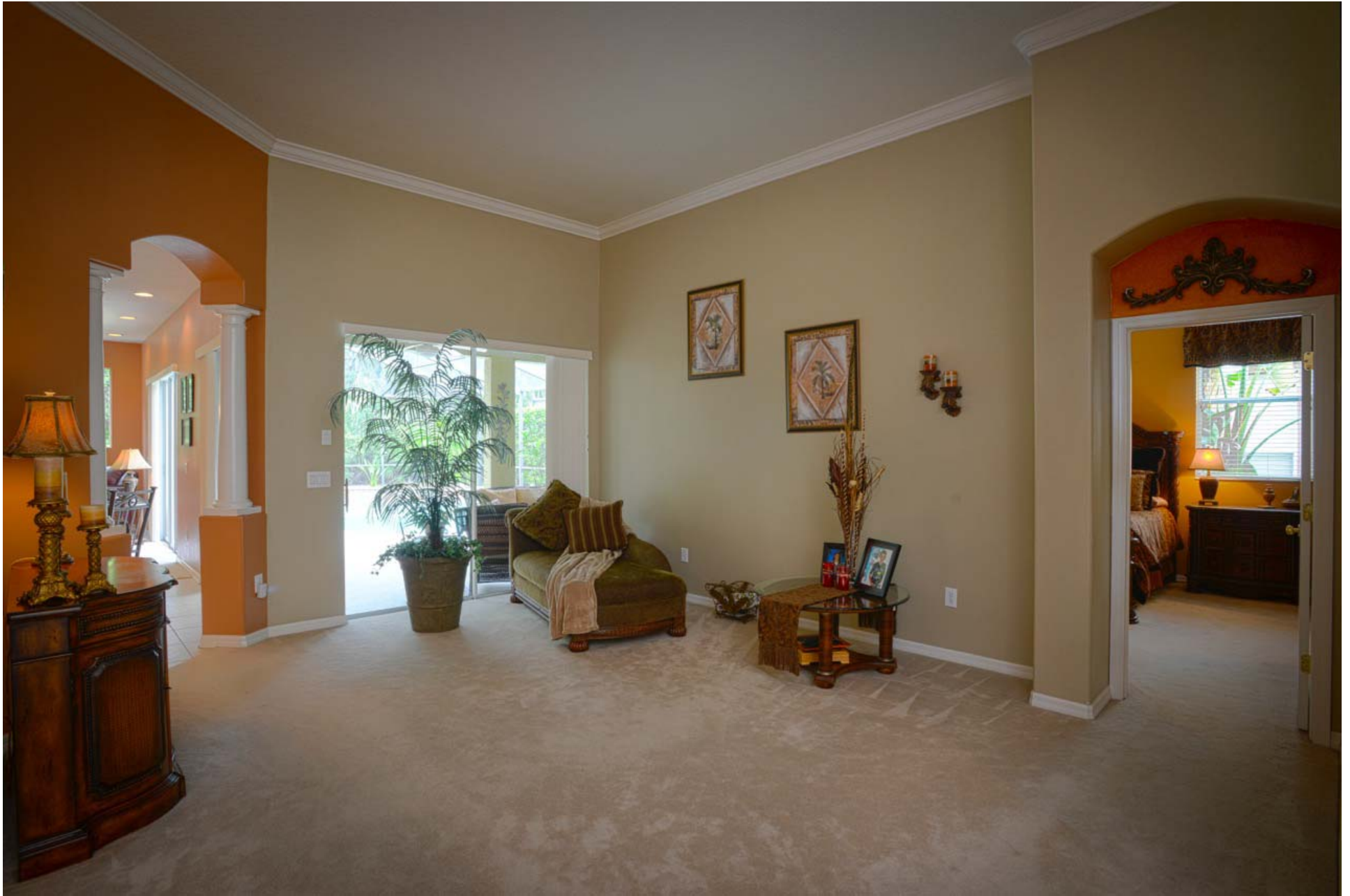
Living Room 17' x 16'