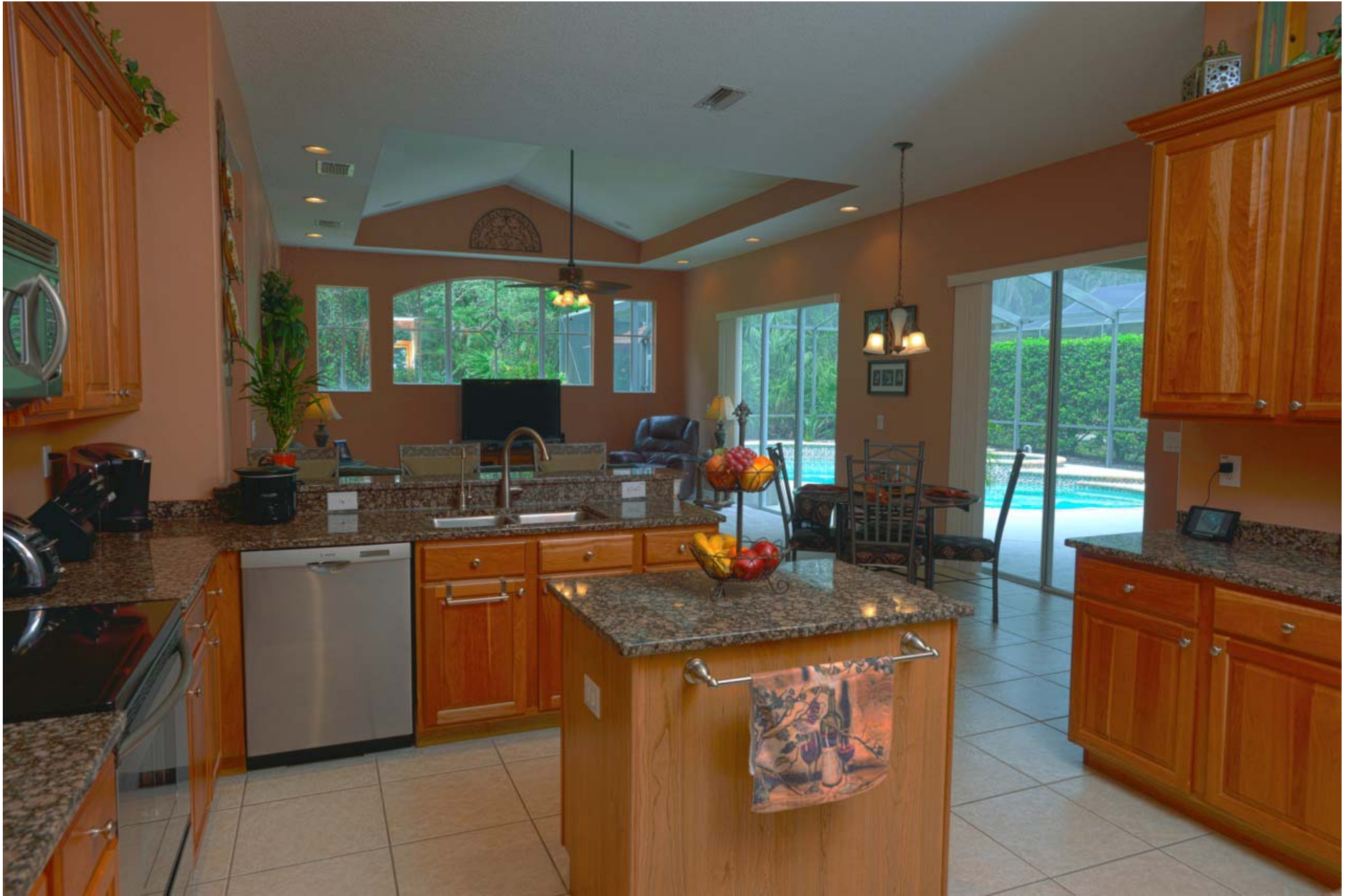
Kitchen – Family Room – Pool