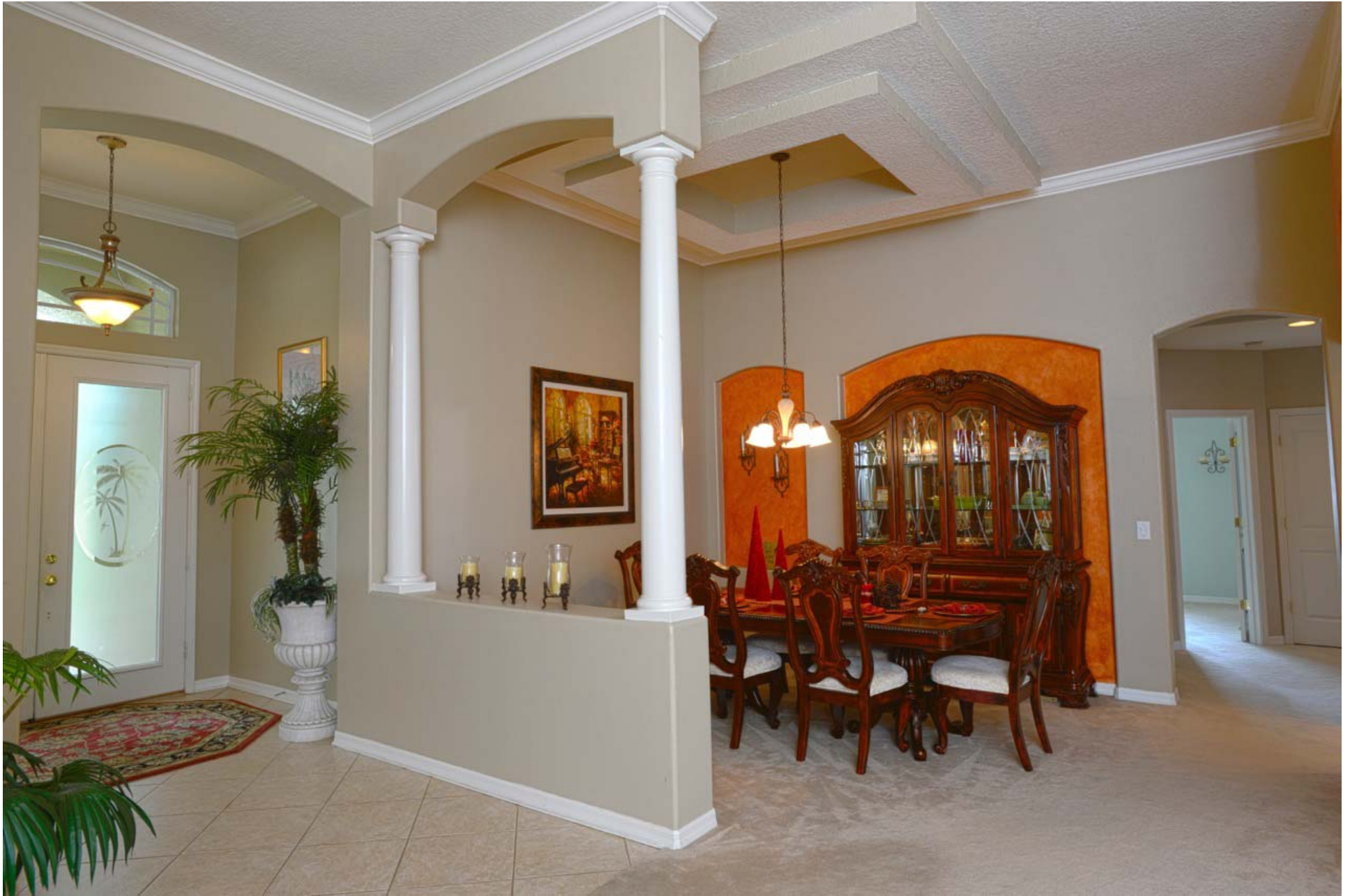
Entrance – Dining Room