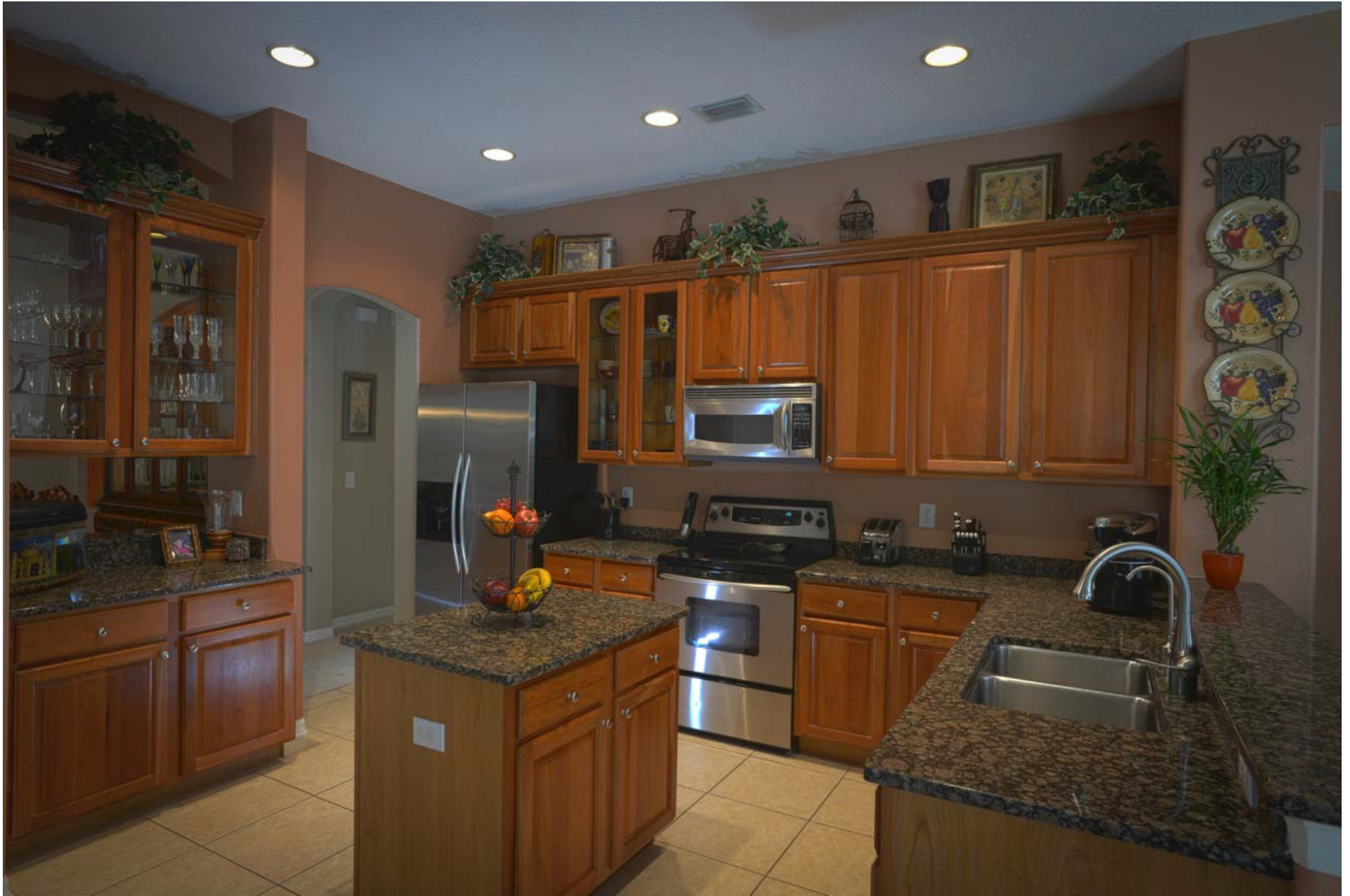
Kitchen 15' x 14'