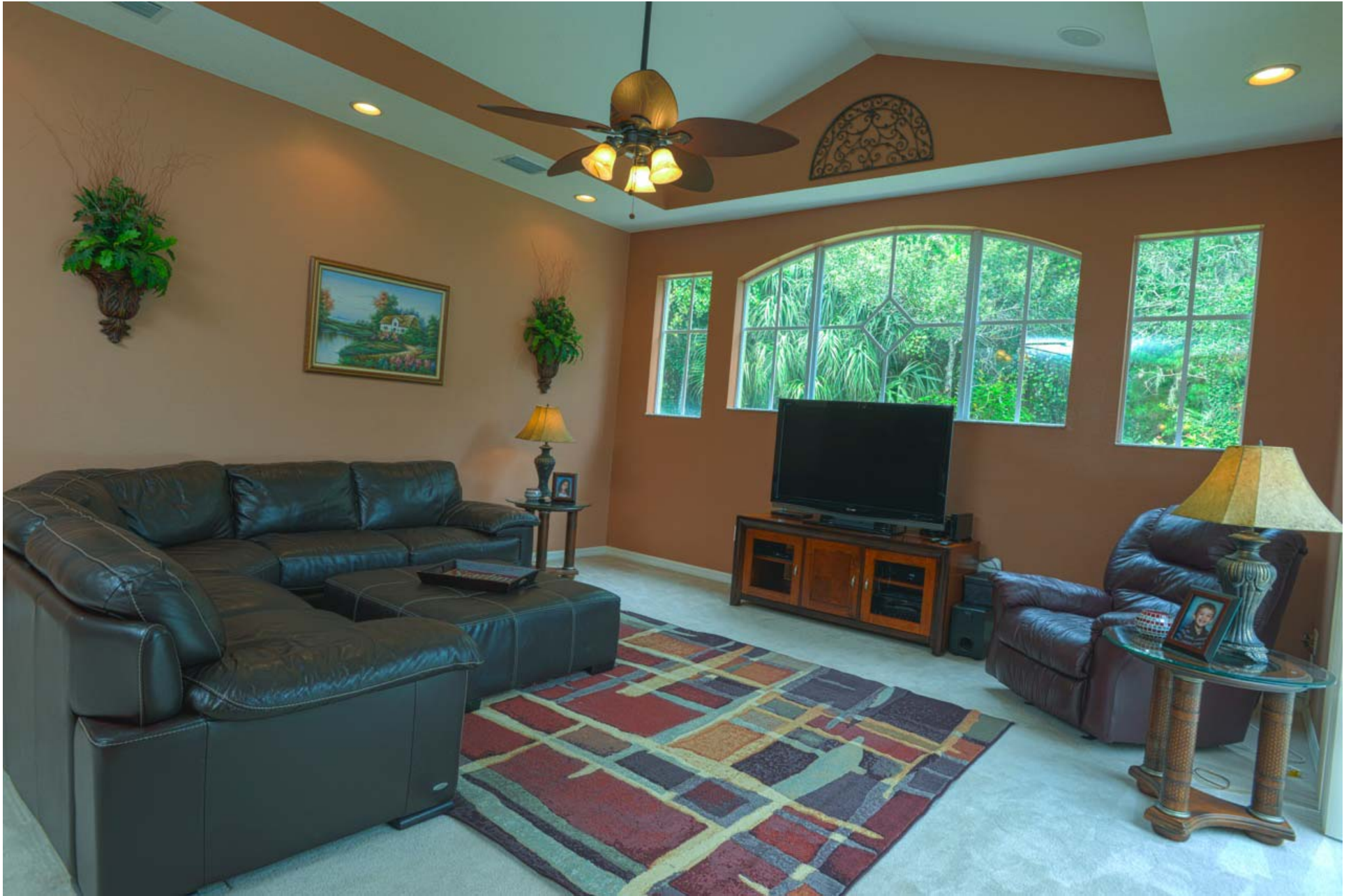
Family Room 17' x 16'