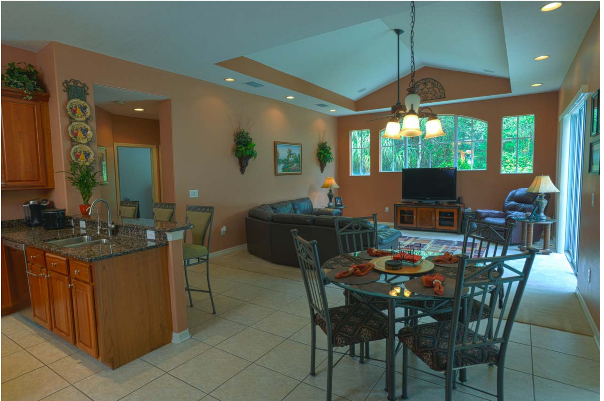
Dinette 7' x 7'