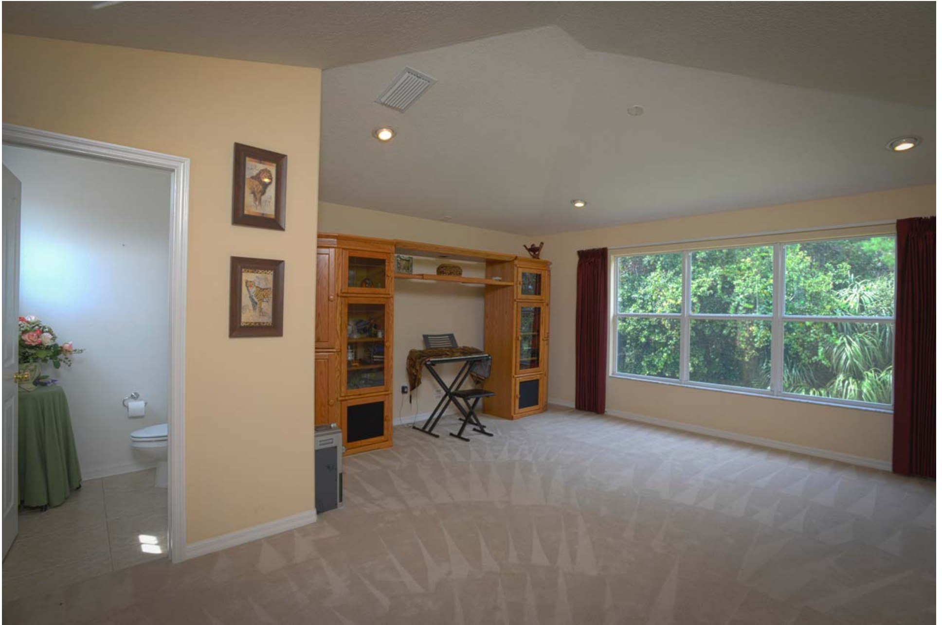
Bonus Room 18' x 16' – Half Bathroom