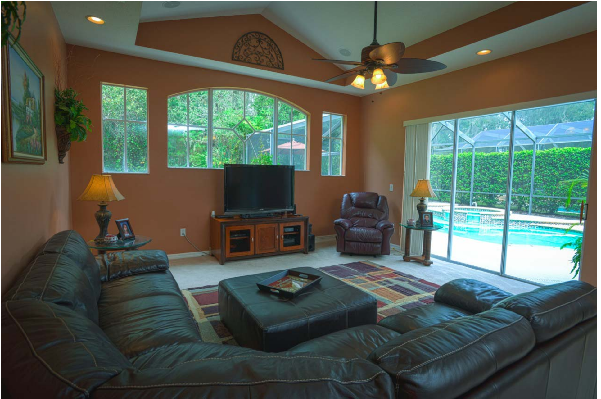
Family Room – Pool