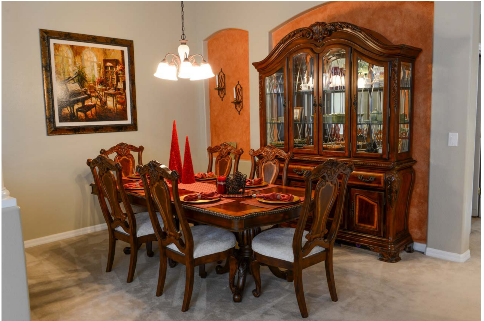
Dining Room 14' x 9'