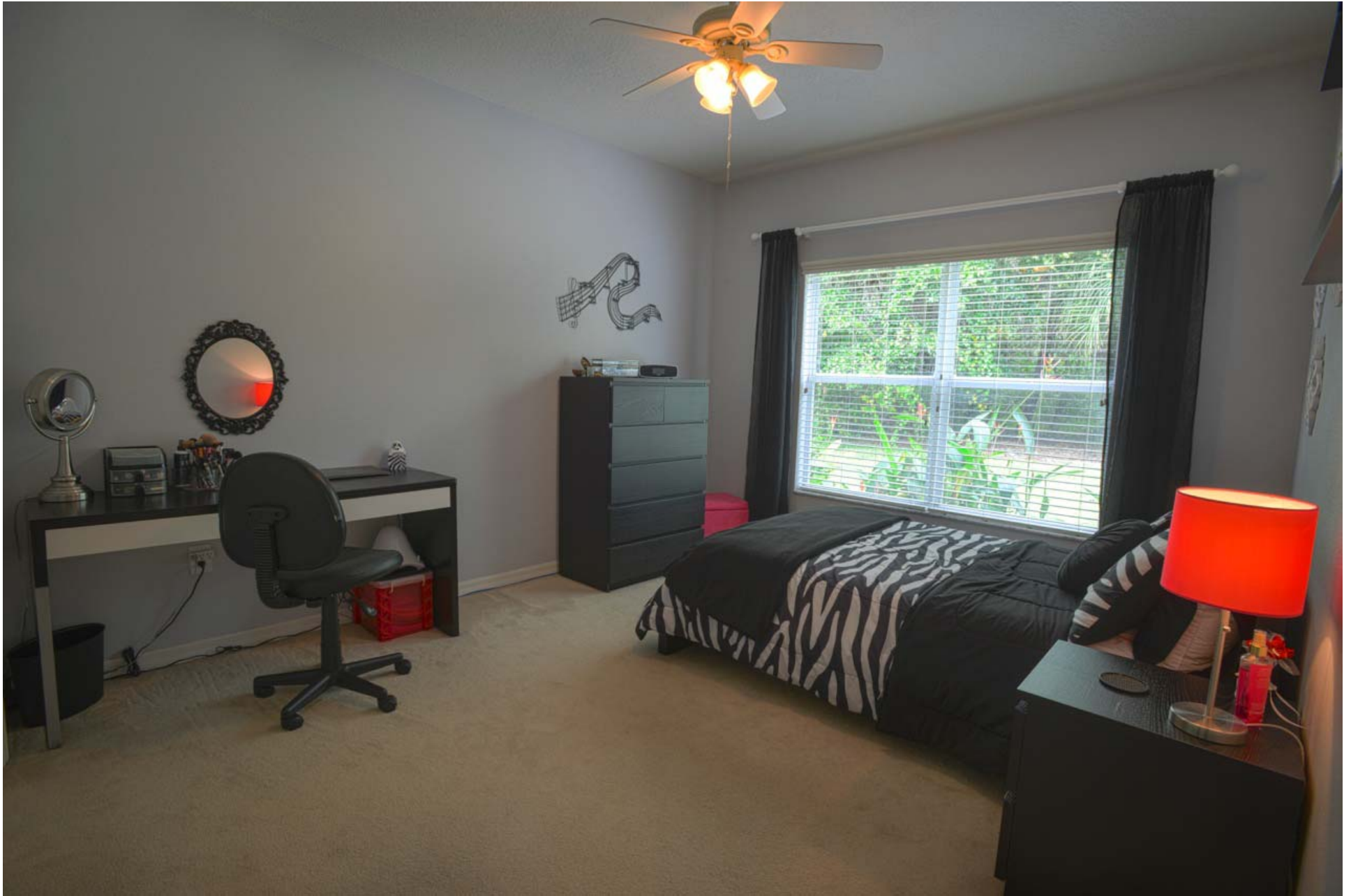
Bedroom 4 – 12' x 10'