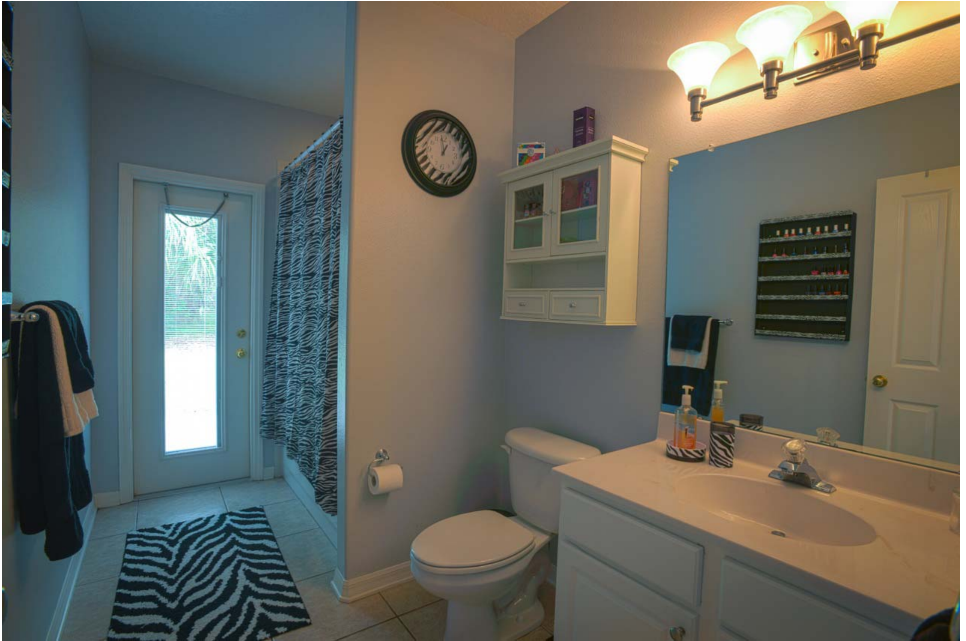
Pool Bathroom 3