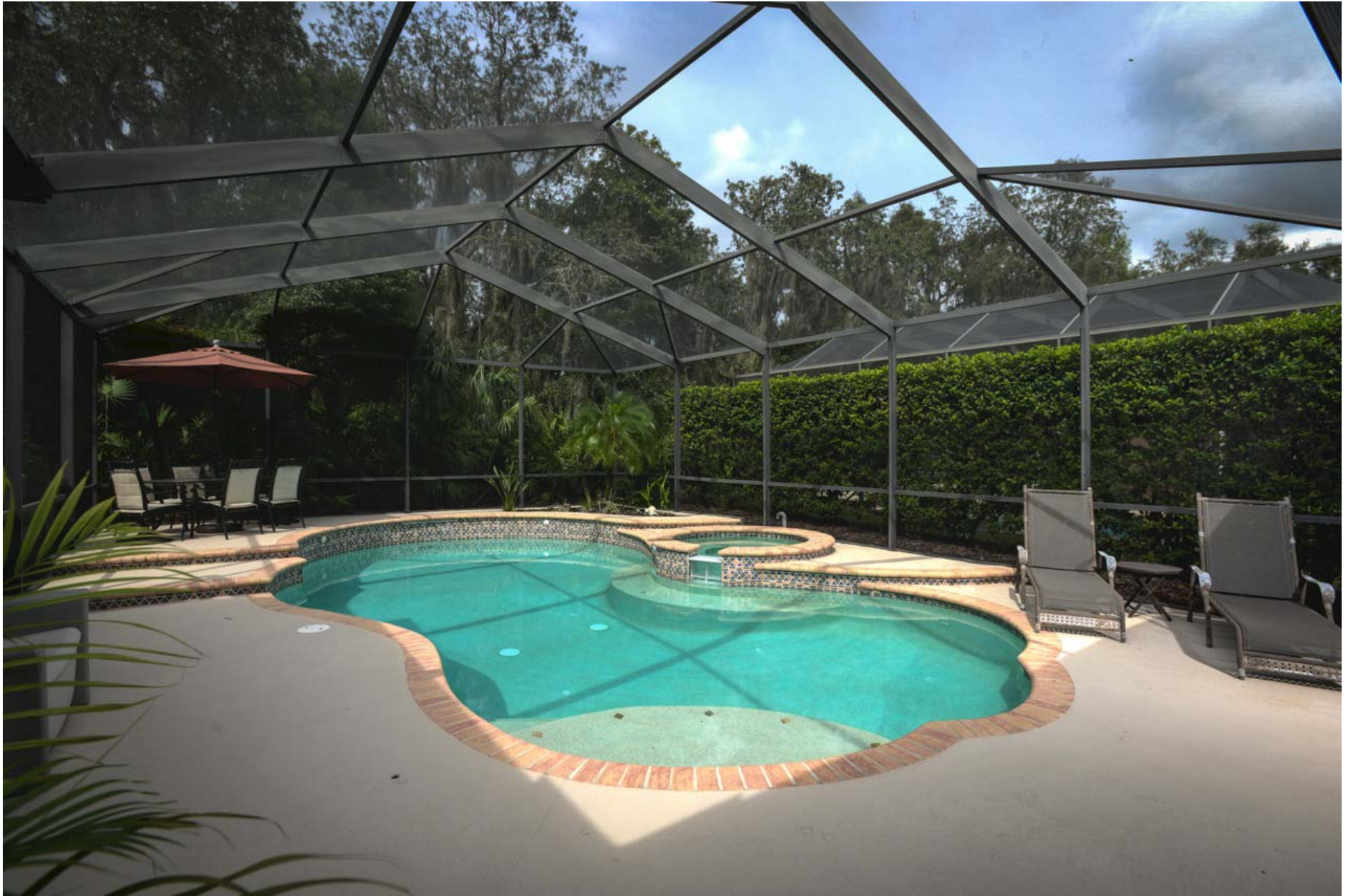
Pool – Private Conservation View