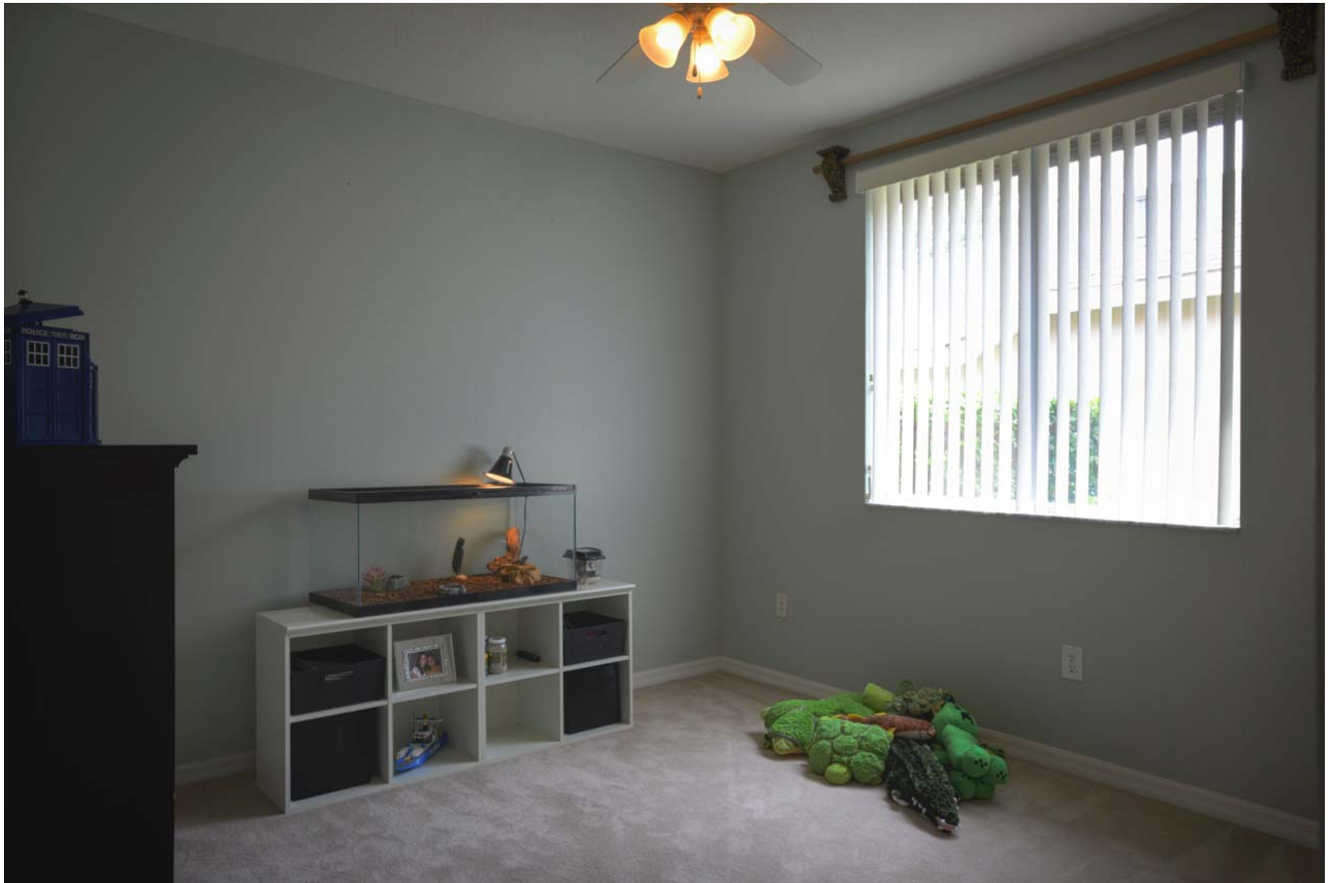
Bedroom 2 – 11' x 10'