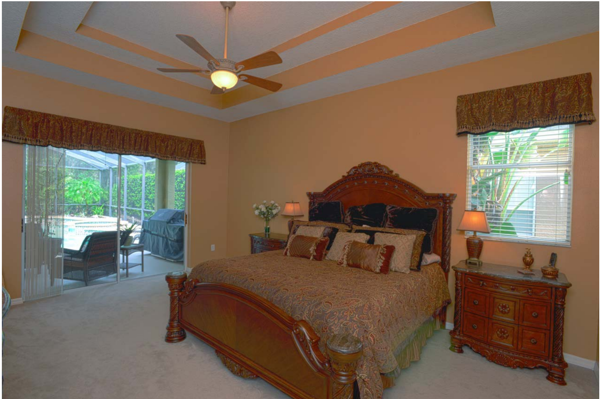
Master Bedroom 17' x 12' – his&hers fitted closets